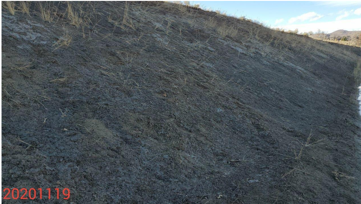
Photo 12: Photo taken from cut slopes on the west end of the Location. Operator has implemented hydromulch along cut slopes. BMP showing signs of degradation. Maintenance advised prior to failure of BMP.