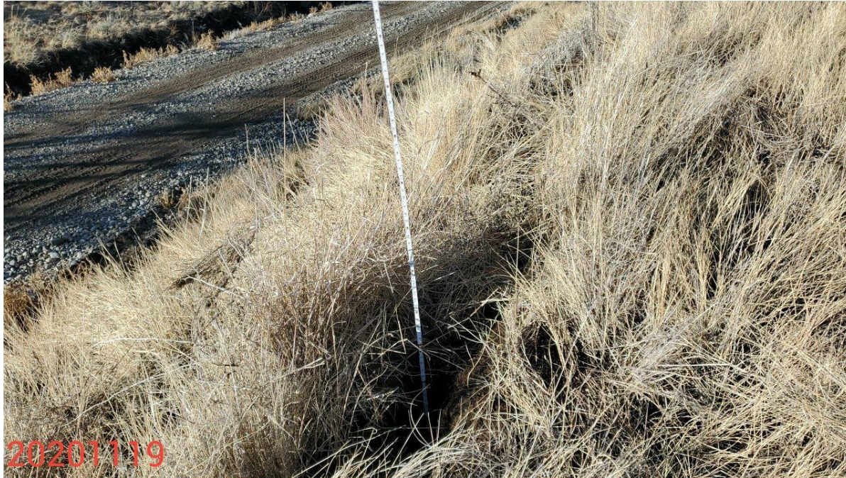
Photo 7: See comments under photo. Photo shows 6 foot measuring stick within a crack on top of the berm. Photo shows cracks were observed to exceed 30 inches in depth in some areas.