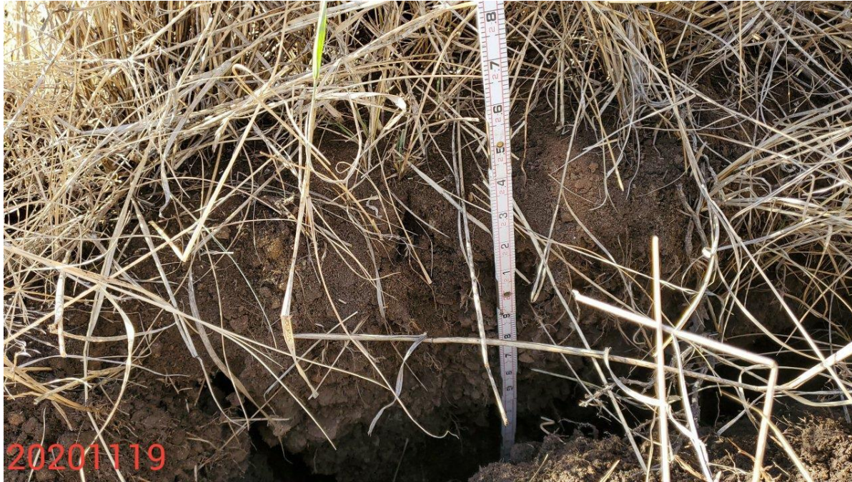
Photo 8: Continued from photo 7. Photo shows cracks were observed to exceed 30 inches in depth in some areas