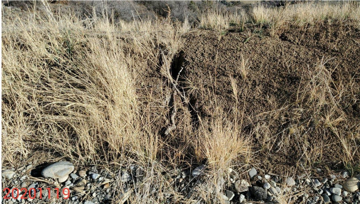
Photo 11: Photo taken from the berm on the east end of the Location. Photo shows example of cracking/erosion degradation that can be observed along the entire perimeter of the Location.