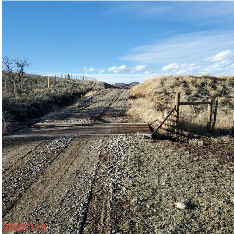
Photo 1: Photo taken from the Location entrance, facing north. Photo shows signage required per Delayed IR Form 4 #401721716 conditions has not been posted, or is not plainly visible.