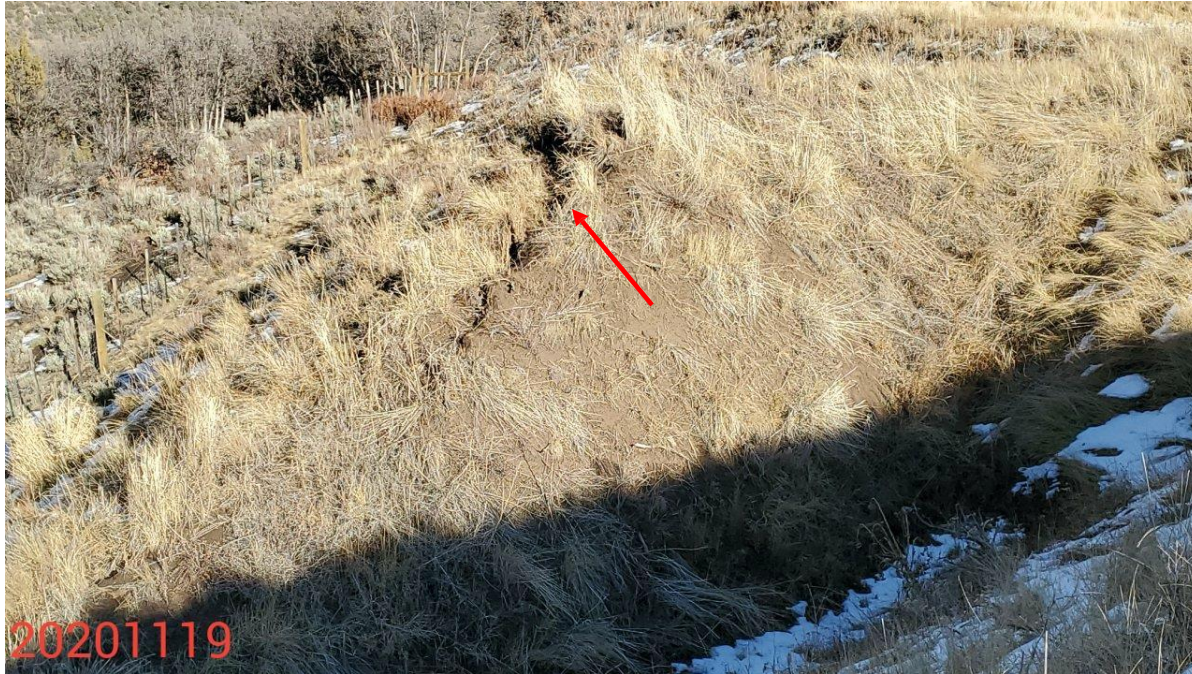
Photo 9: Photo taken from the north end of the Location, facing east. Photo shows areas where soils have not been sufficiently stabilized, and appear to be slipping.