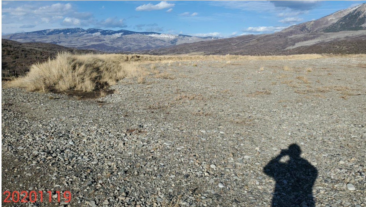
Photo 2: Photo taken from the northwest end of the Location, facing northeast. Photos 2-3 provide an overview of the Location from northeast, southeast to south.