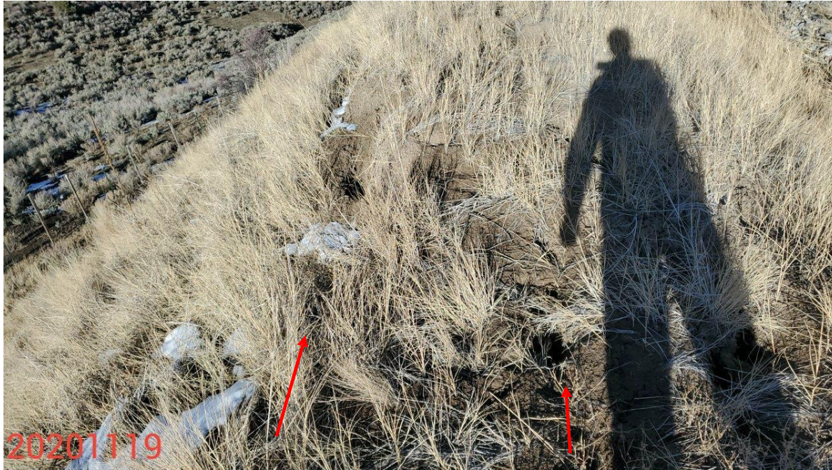
Photo 5: Photo taken from the top of the berm along the perimeter of the pad. Photo shows example of cracking/stabilization concerns that can be observed along the entire perimeter of the Location. Cracks were observed to exceed 30 inches in areas. Ongoing stormwater monitoring/management appears insufficient.