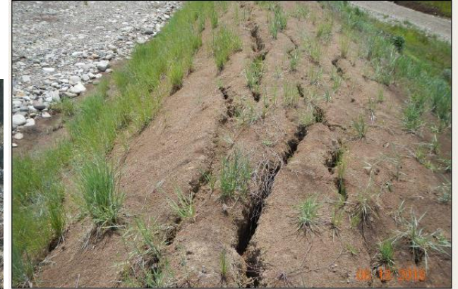
Photo 6: Photos taken from the top of the berm along the northern perimeter of the pad. Photo on right from the 6/18/2019 inspection. Side by side comparison shows that cracks observed along berms do not appear to have been repaired; Photo on left shows cracking/stabilization concerns remain evident along the perimeter of the Location. Cracks were observed to exceed 30 inches in areas. Ongoing stormwater monitoring/management appears insufficient.