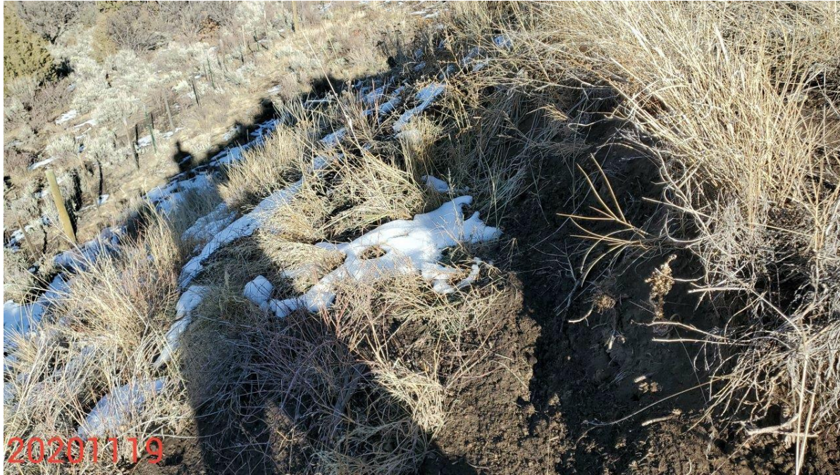
Photo 10: Continued from photo 9. Photo shows areas where soils have not been sufficiently stabilized, and appear to be slipping