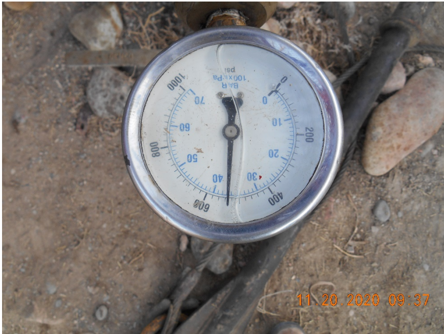
Wellhead gauge at start of MIT (0 min).