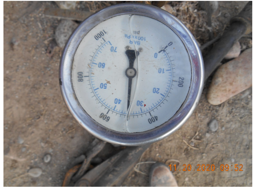
Wellhead gauge at end of MIT ( 15 min)