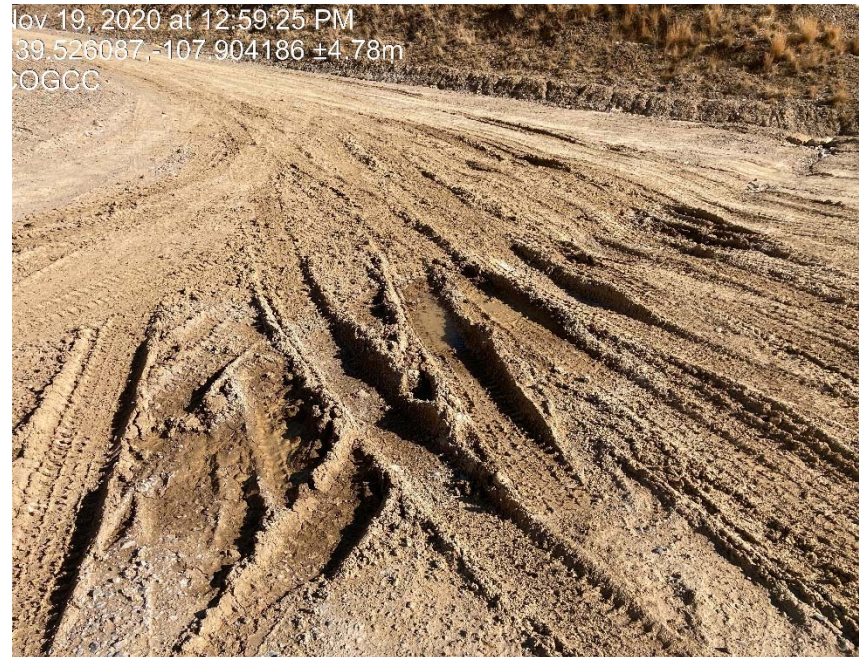
lack of stabilization