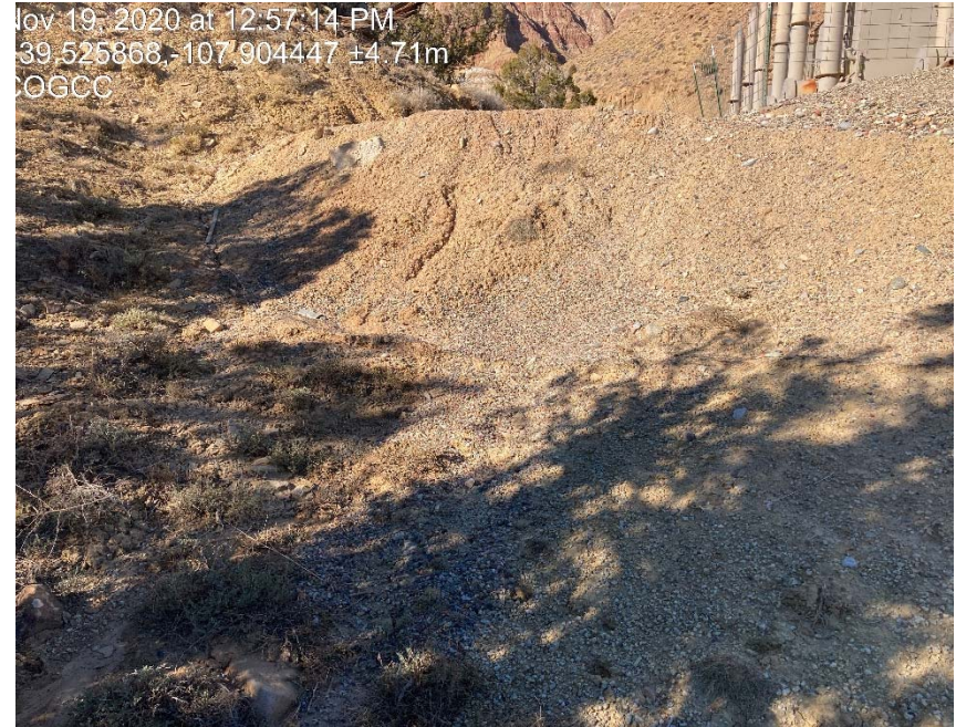
Follow up photo still no stabilization and sediment migration, old waddle is still in place