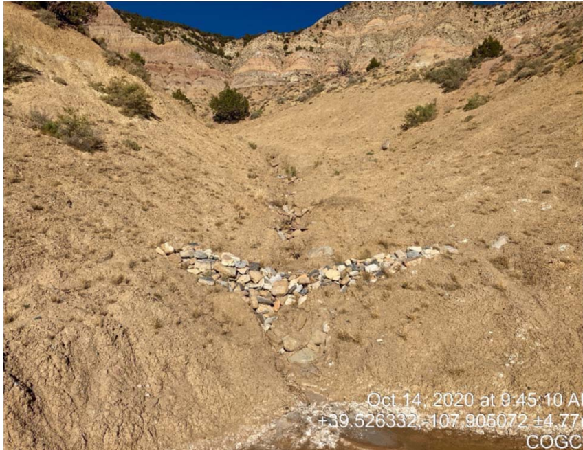
Previous inspection photo