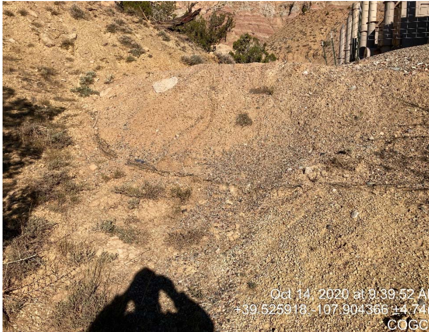
Previous inspection photo