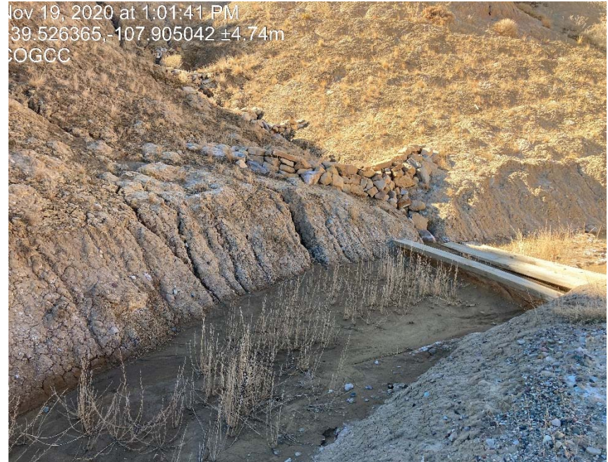
Follow up photo