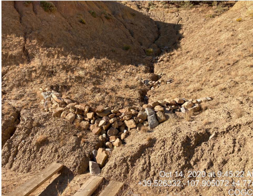
Previous inspection photo