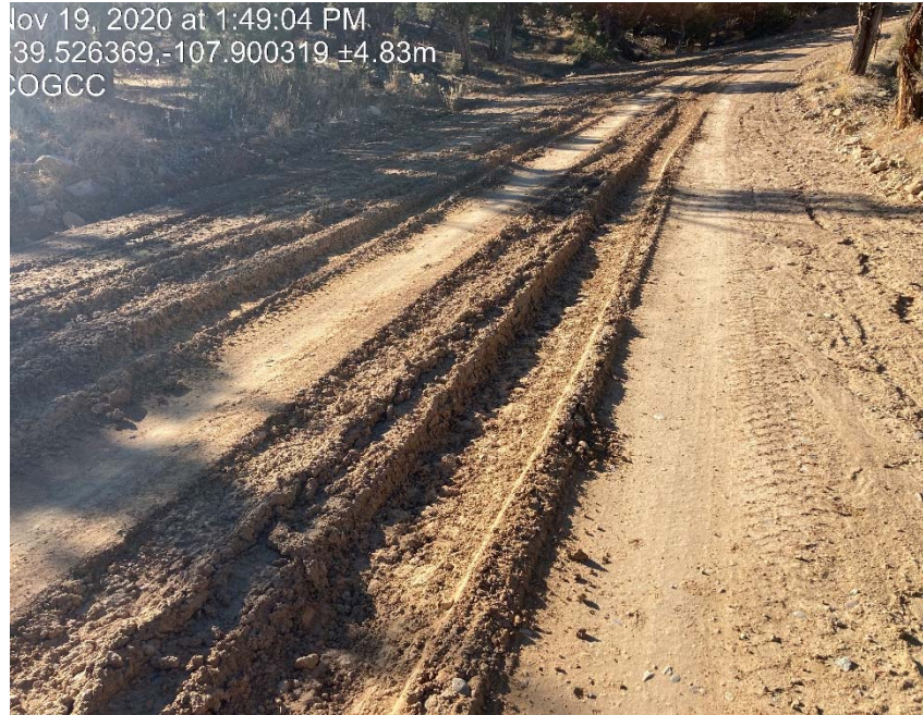
Access road has lack of stabilization