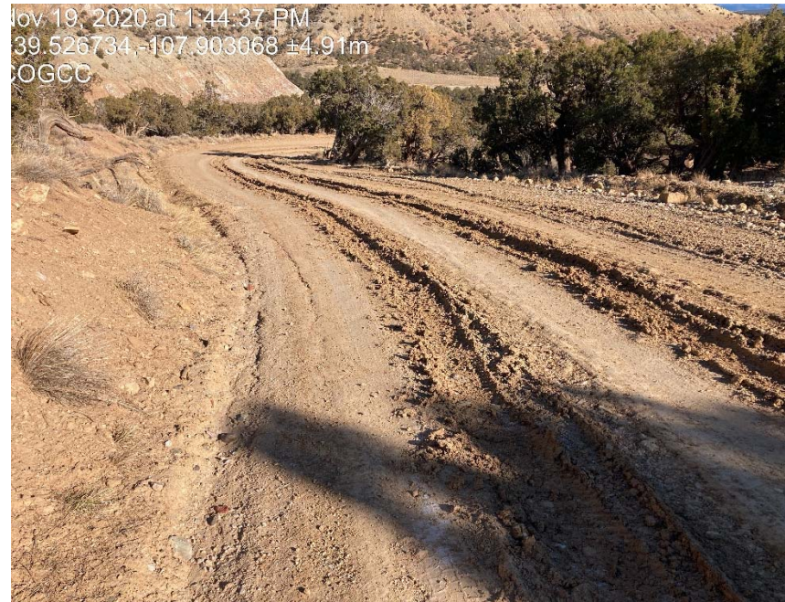
Access road has lack of stabilization