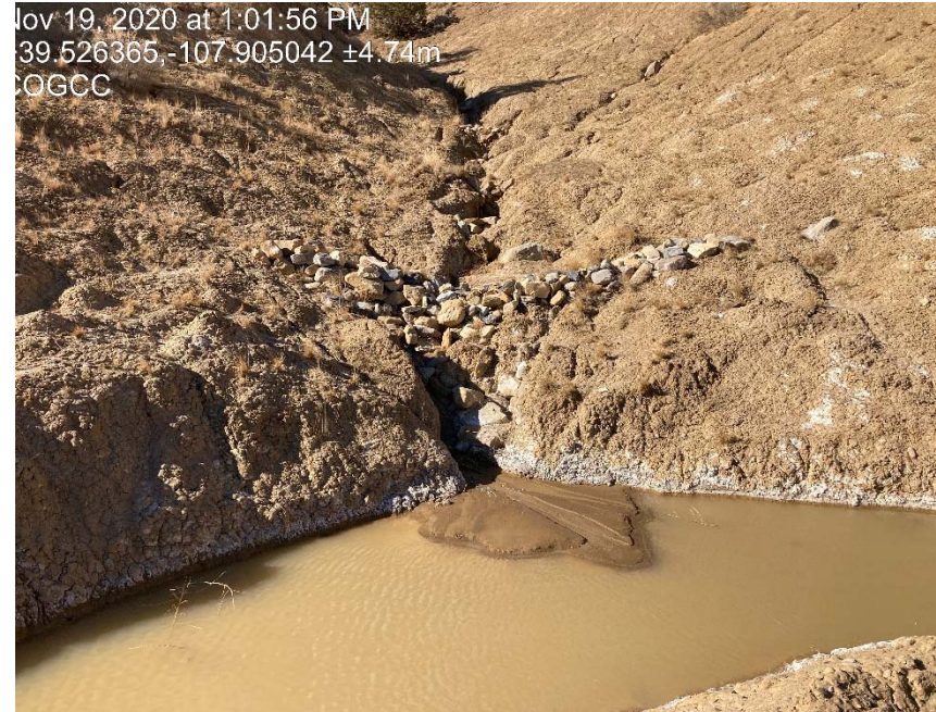
follow up photo