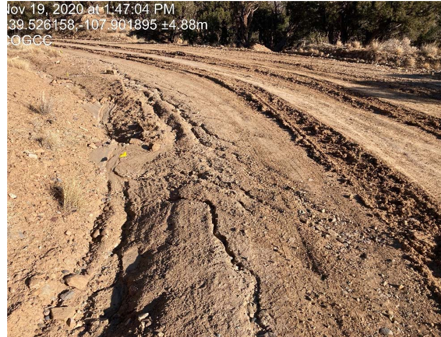
Access road has lack of stabilization