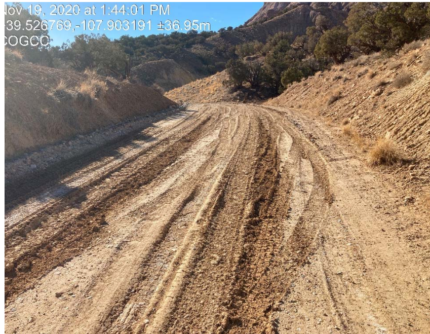
Access road has lack of stabilization