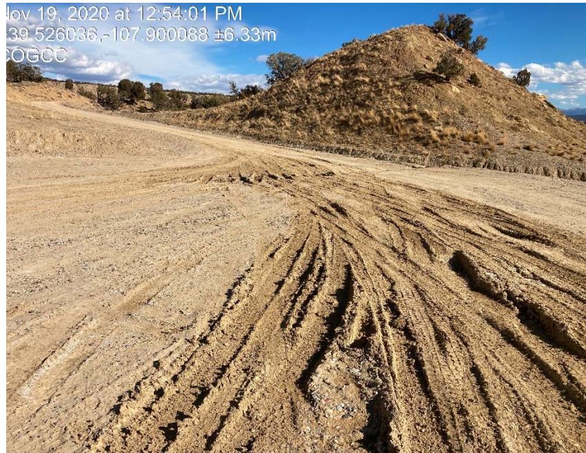
lack of stabilization