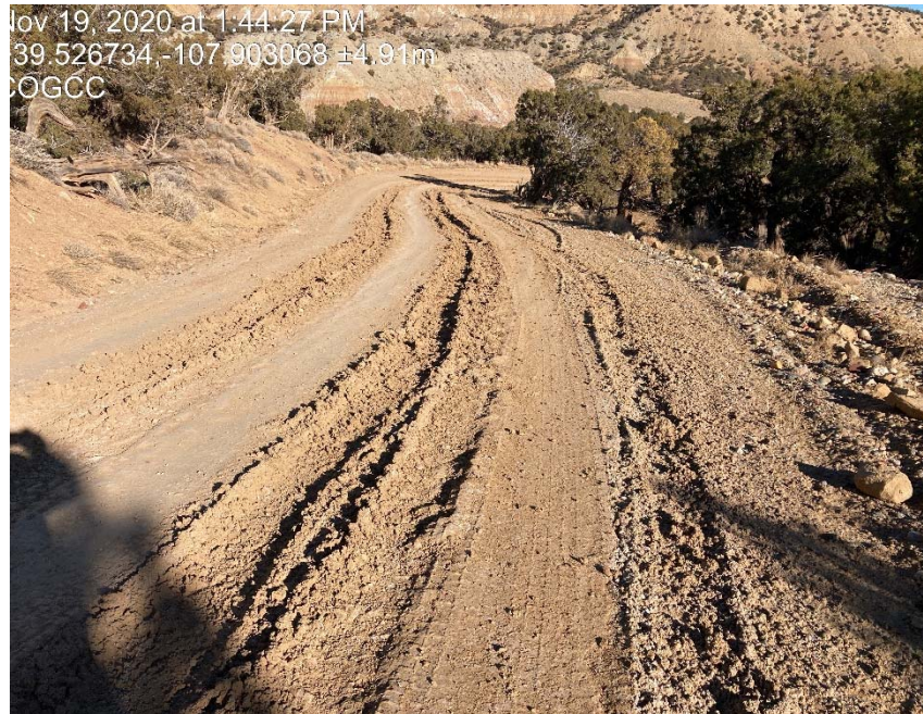
Access road has lack of stabilization