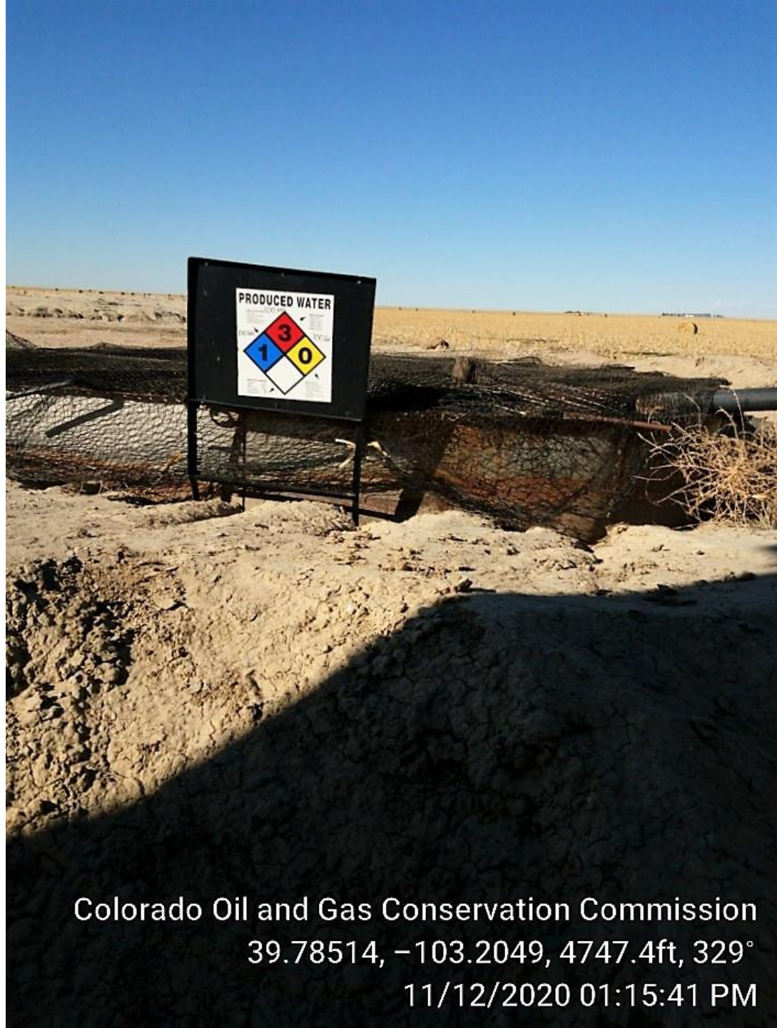
Colorado Oil and Gas Conservation Commission 39.78514, -103.2049, 4747.4ft, 329° 11/12/2020 01:15:41 PM