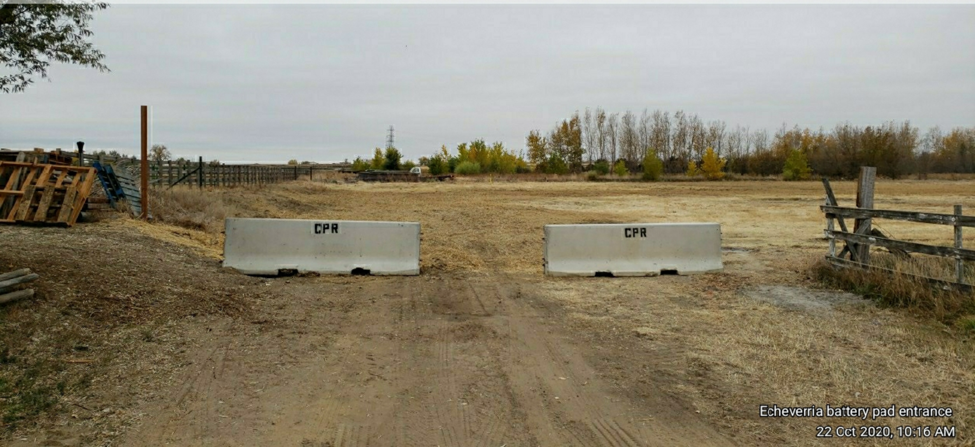
Echeverria battery pad entrance 22 Oct 2020, 10:16 AM