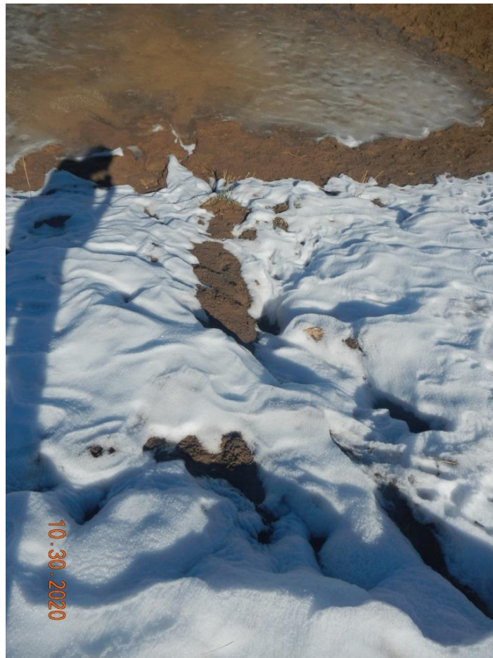
Photo#5: Stormwater tunneling through sink holes off ditches and pooling areas.