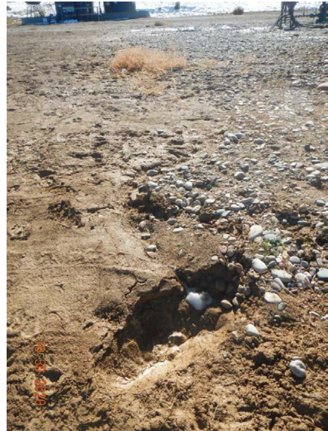
Photo#3: Stormwater tunneling through sink holes off ditches and pooling areas.