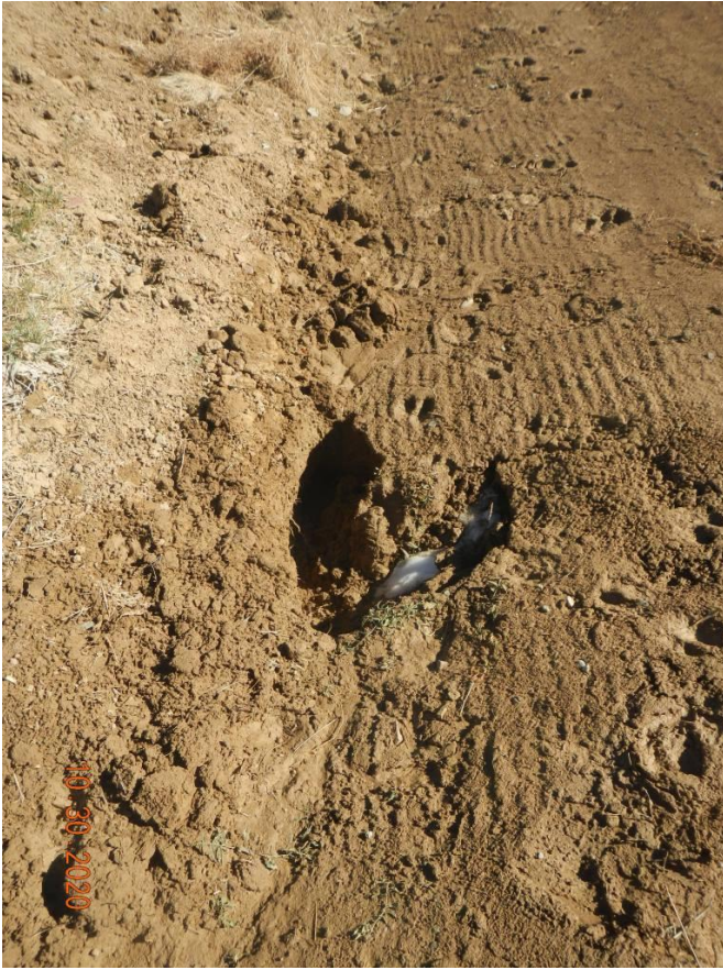
Photo#2: Stormwater tunneling through sink holes off ditches and pooling areas.