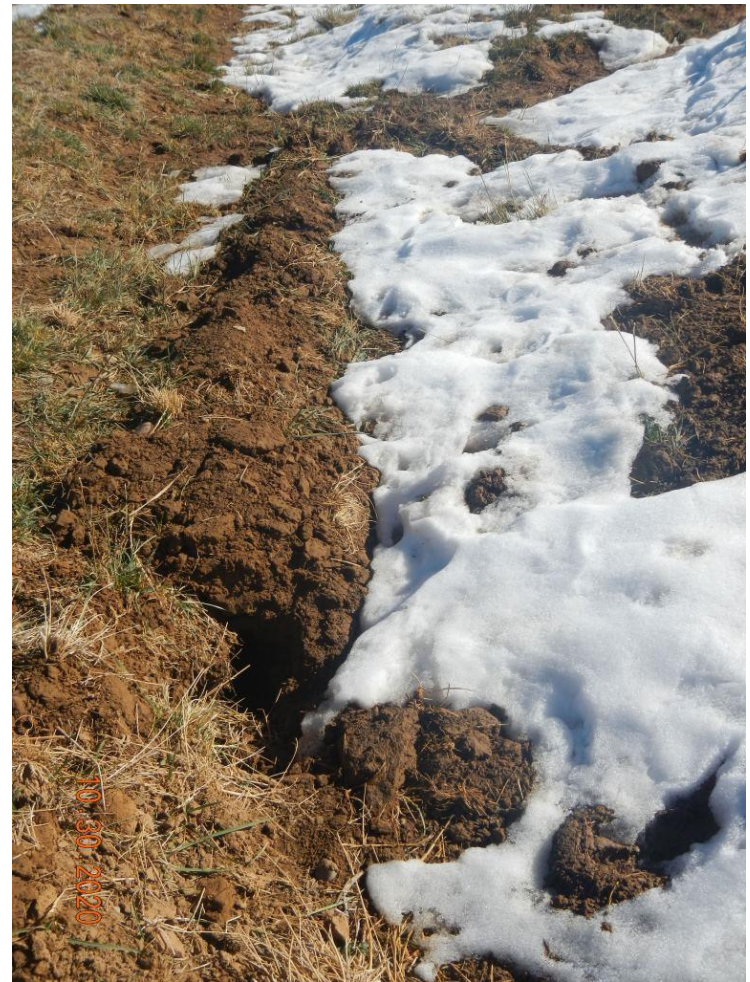
Photo#7: Stormwater tunneling through sink holes off ditches and pooling areas.