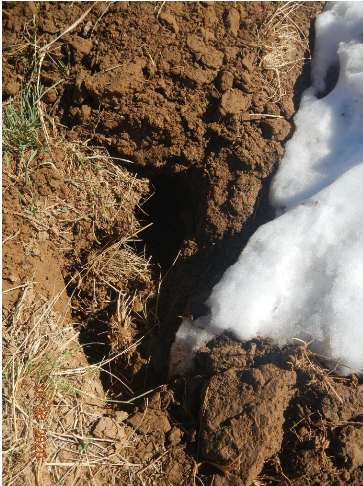
Photo#6: Stormwater tunneling through sink holes off ditches and pooling areas.