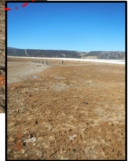
Photo#1: Overview of Location to East. Insert & outline, area no longer needed for use.