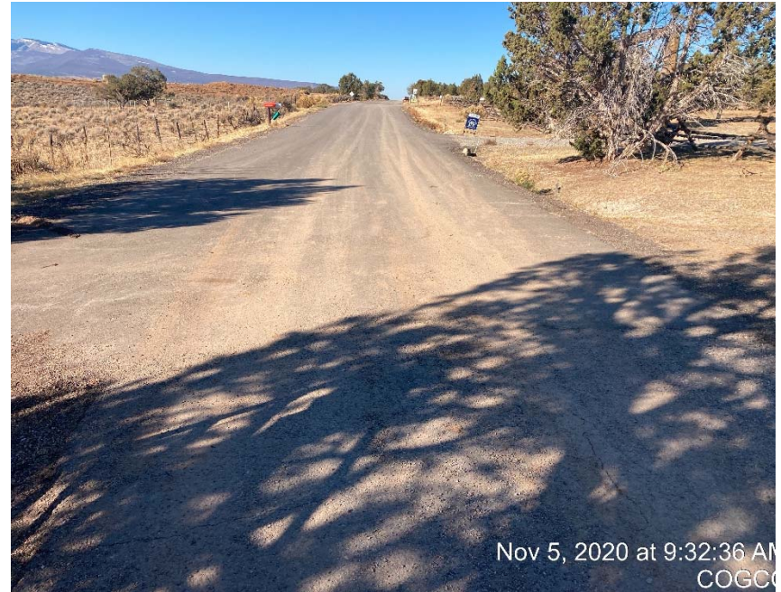
Vehicle Tracking on to county road from lease road