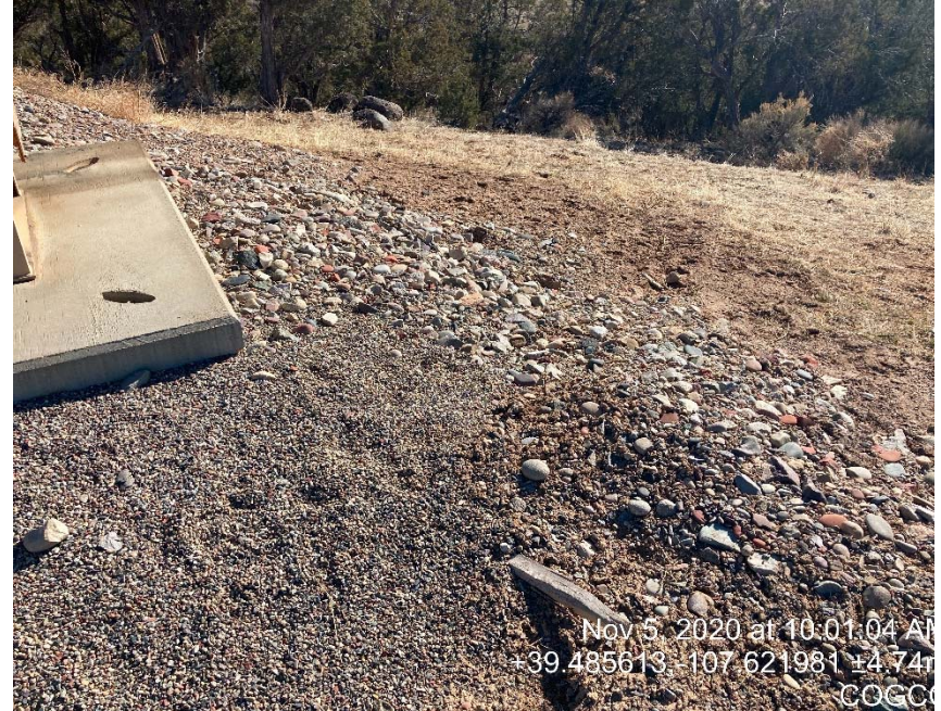
Sediment migration off of pad/ choking out vegetation