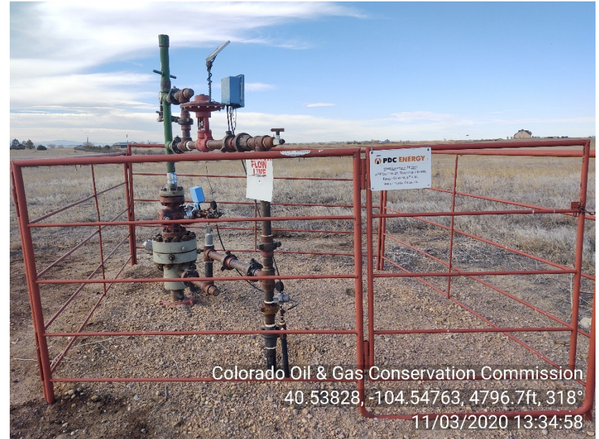
Colorado Oil & Gas Conservation Commission 40.53828, -104.54763, 4796.7ft, 318° 11/03/2020 13:34:58

Weld County 20-28 (05-123-34211) Wellsite Plugged & Abandoned | PA ~ 10 yds.