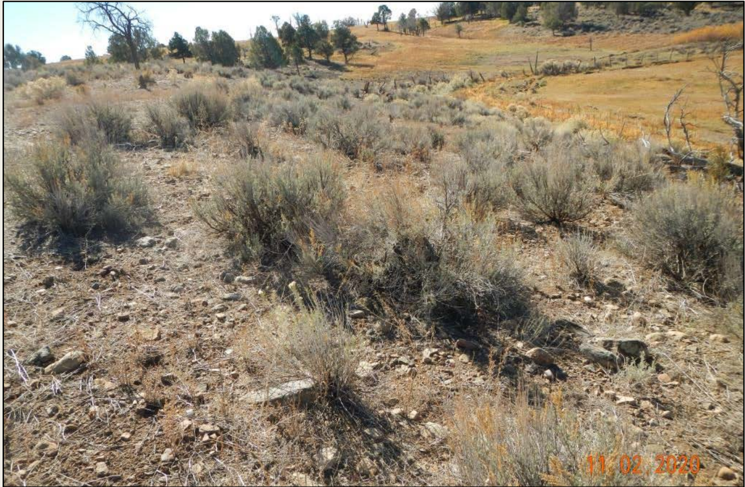
Photo 4. View of reference area comprised of mosaic of sagebrush shrubland with squirreltail and western wheatgrass, along with irrigated grass fields.