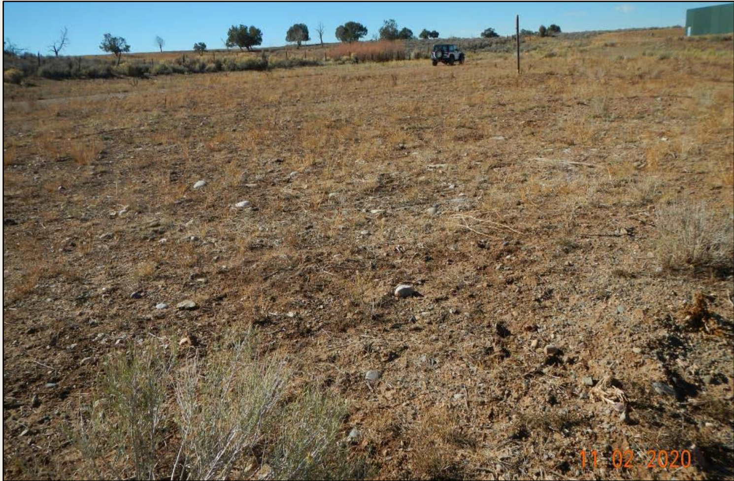
Photo 1. View of the project area from the northeastern corner facing center.