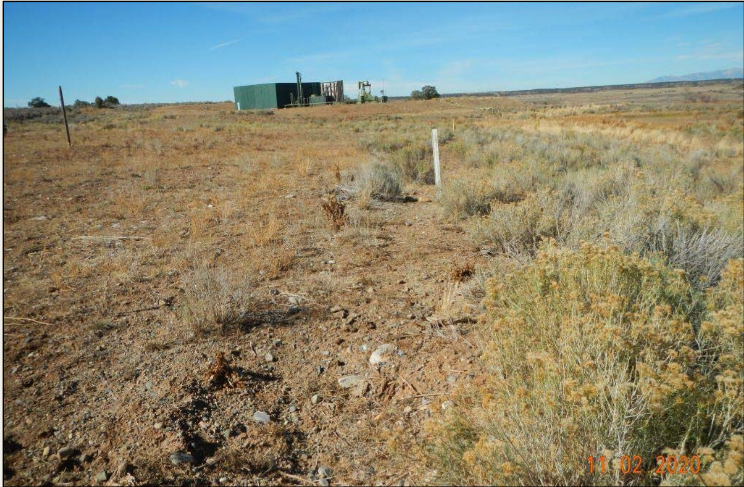
Photo 2. View of the northern project area from the northeastern corner facing westward. Revegetation is progressing with crested wheatgrass and smooth brome. Musk thistles appear to be herbicide-treated.