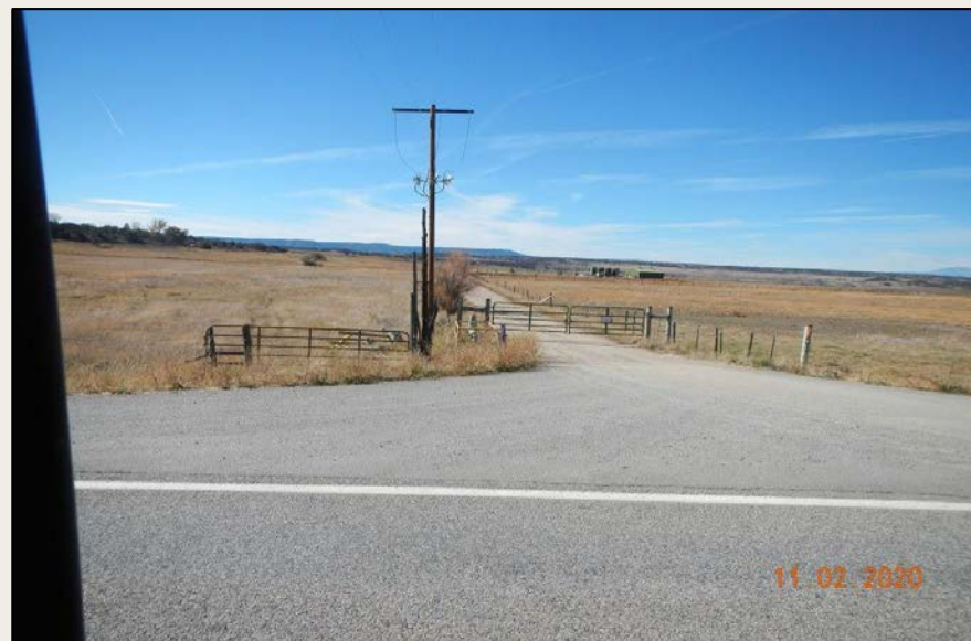
Photos 5/6. View of closed gates after entering (left) and leaving (right) project area.