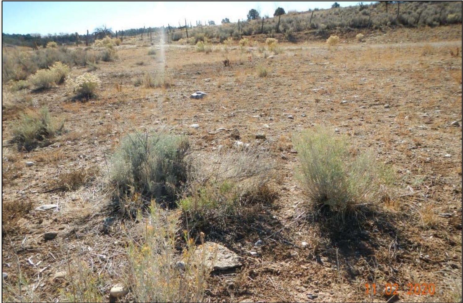
Photo 3. View of the eastern project area from the northeastern corner facing southward.