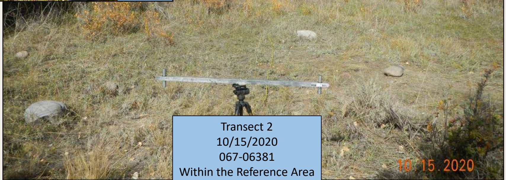
Transect 2 10/15/2020 067-06381 Within the Reference Area