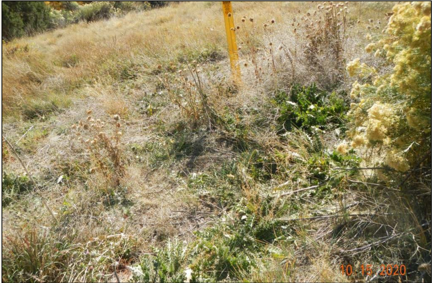
Photo 6. View of musk thistles within the southeastern project area. Approximately 200 individuals observed.