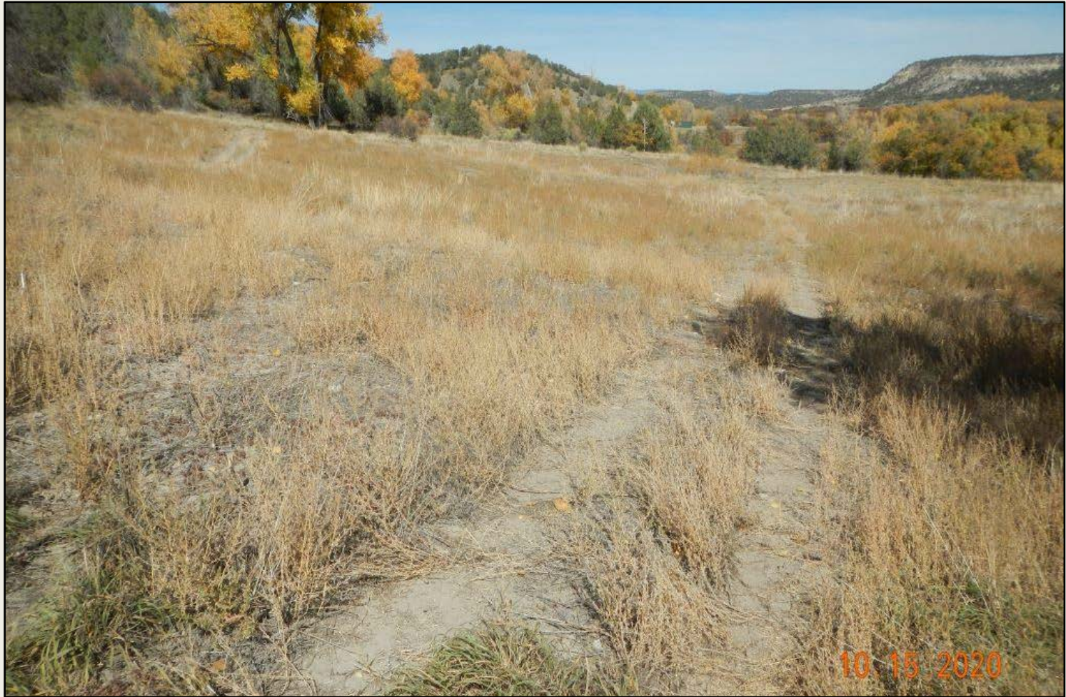
Photo 2. View of the western project area from the southwestern corner facing northward. Roads need to be closed and reclaimed.