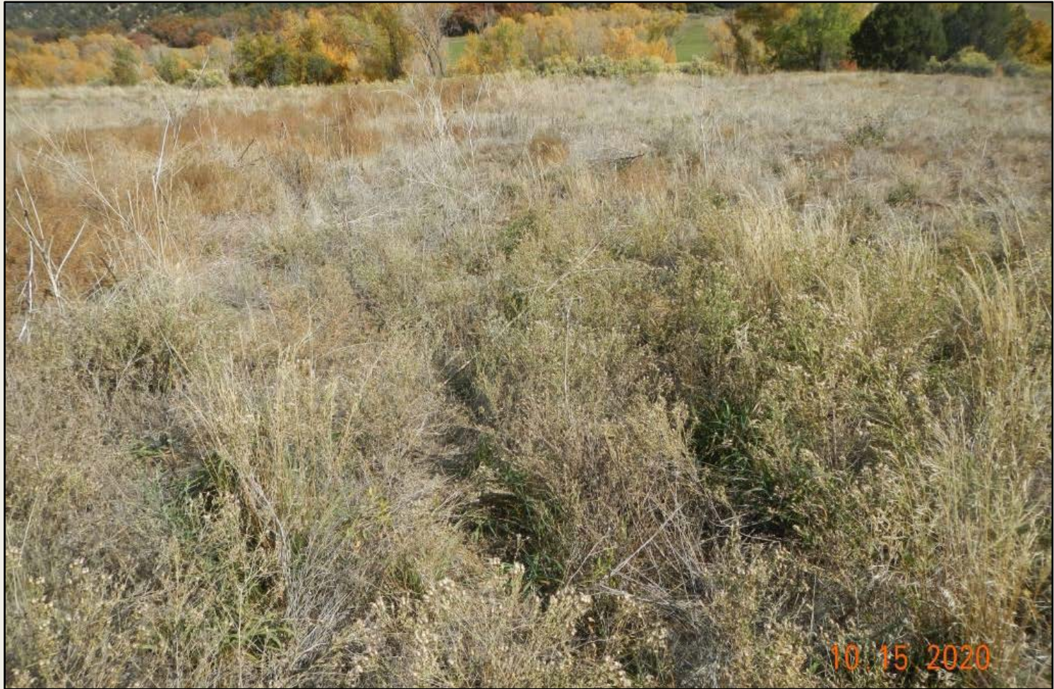
Photo 7. View of Russian knapweeds within the southern project area. Approximately 1000 individuals observed.