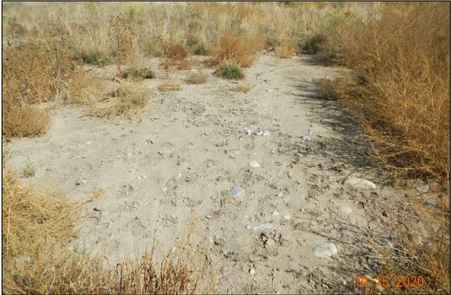
Photo 8. View of area within the northeastern project area with bare soils and little revegetation.