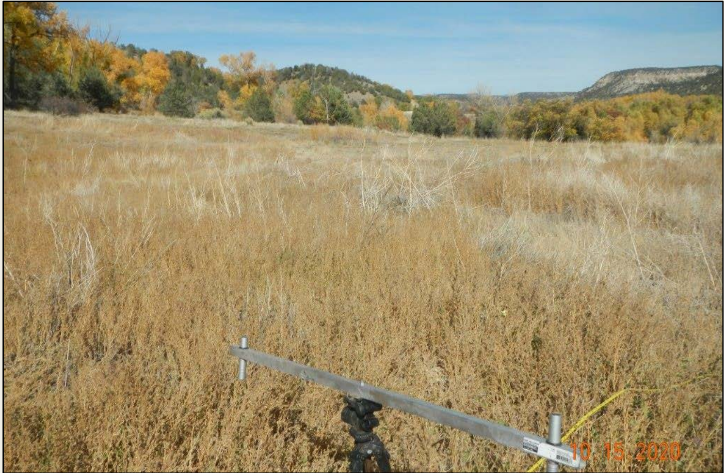
Photo 4. View of the project area from the mid-point along Transect 1, facing northward. Dense kochia observed.