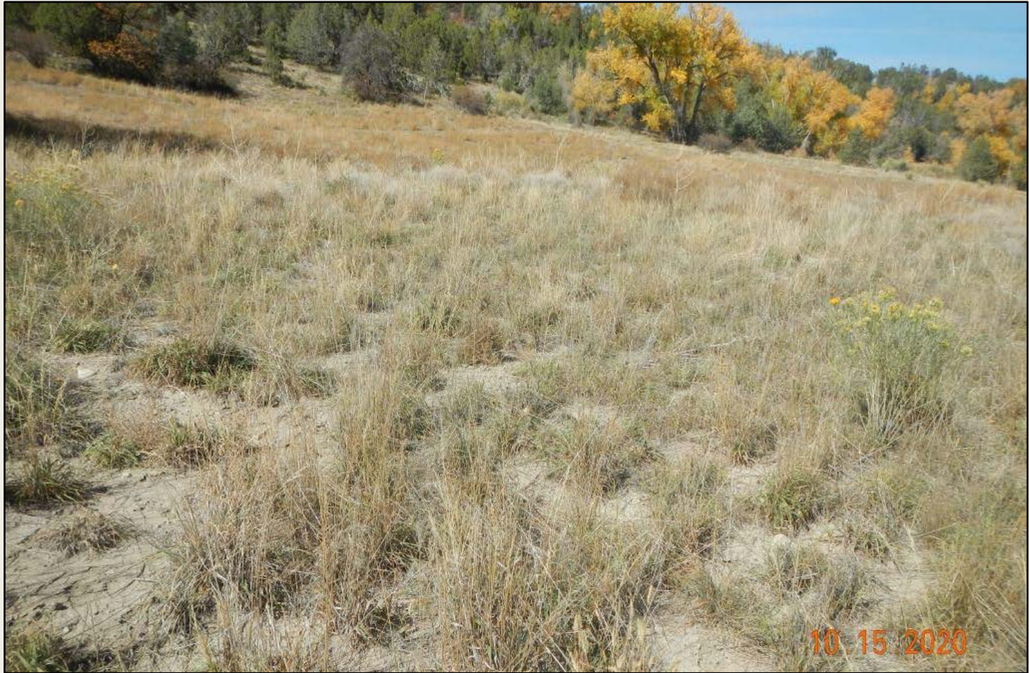
Photo 9. View of area within the southeastern project area where revegetation is progressing, largely with smooth brome.