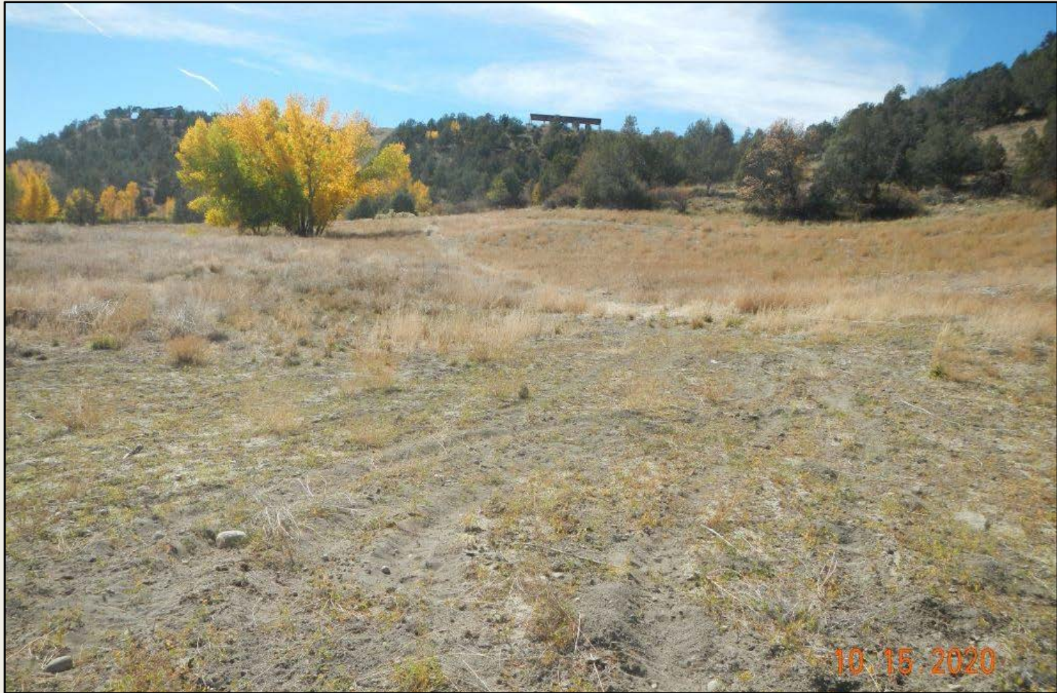
Photo 1. View of the project area from the northeastern corner facing center. Project area is recontoured. However, vehicles have been accessing the site and crushing vegetation. Access does not appear to have specific need as turnaround is on well pad.