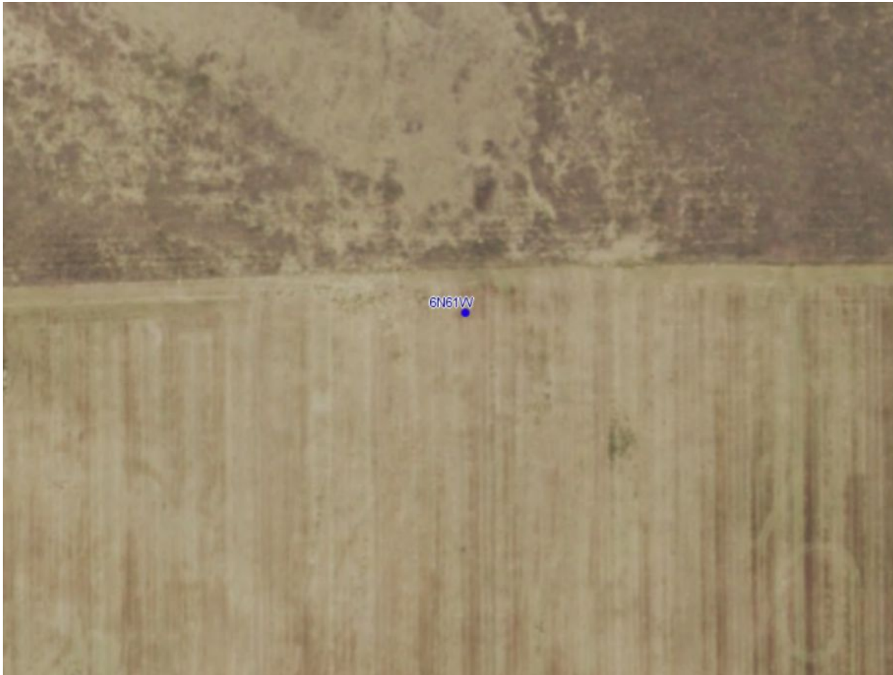
Photo 6. COGCC GISOnline aerial imagery from 2017. Imagery does not suggest any issues to the extent that was observed in October 2020.