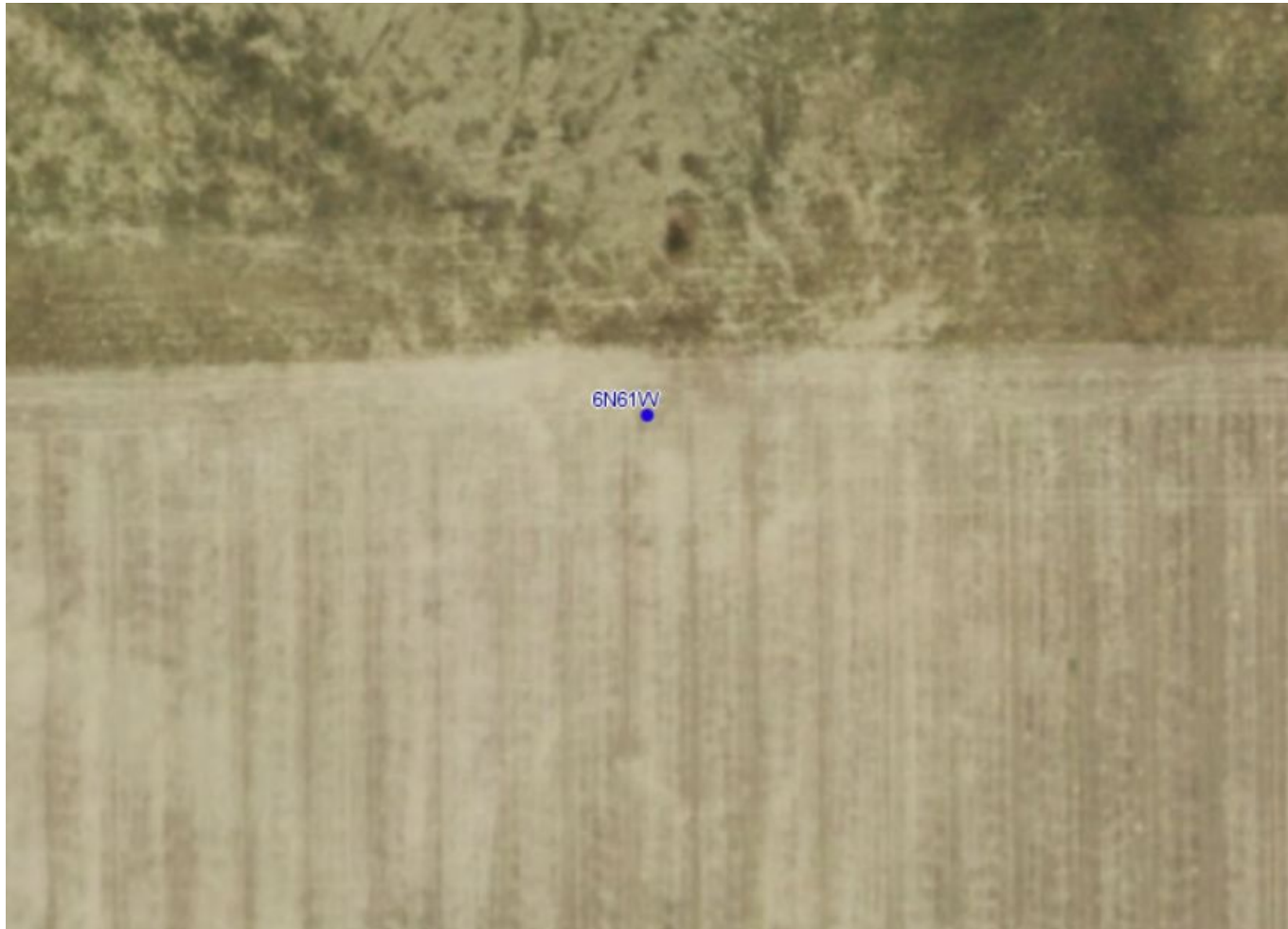
Photo 7. COGCC GISOnline aerial imagery from 2019. Imagery does not suggest any issues to the extent that was observed in October 2020.