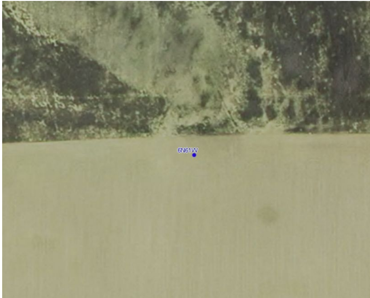
Photo 4. COGCC GISOnline aerial imagery from 2013. Imagery does not suggest any issues to the extent that was observed in October 2020.