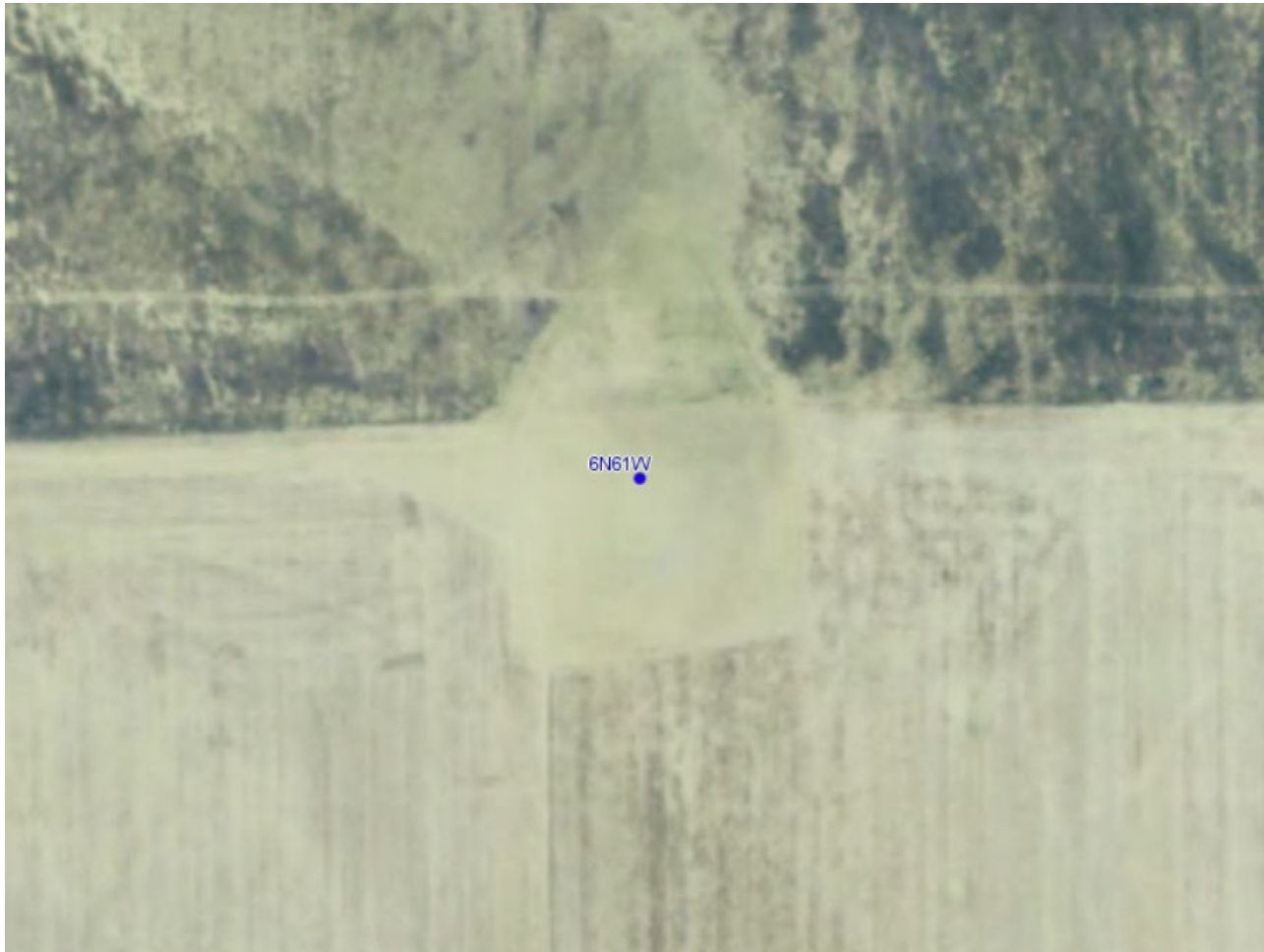
Photo 3. COGCC GISOnline aerial imagery from 2011. Imagery illustrates the initial disturbance. Based on records, this appears to be a dry and abandoned well that never produced.