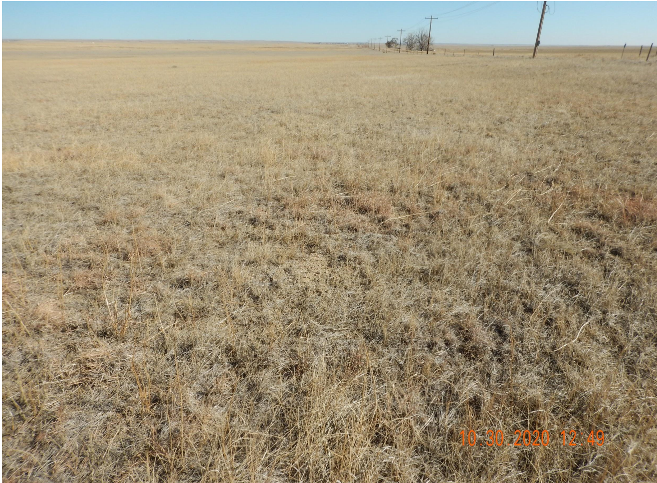
Photo 7. Reference photo taken east of the pit area, facing East.