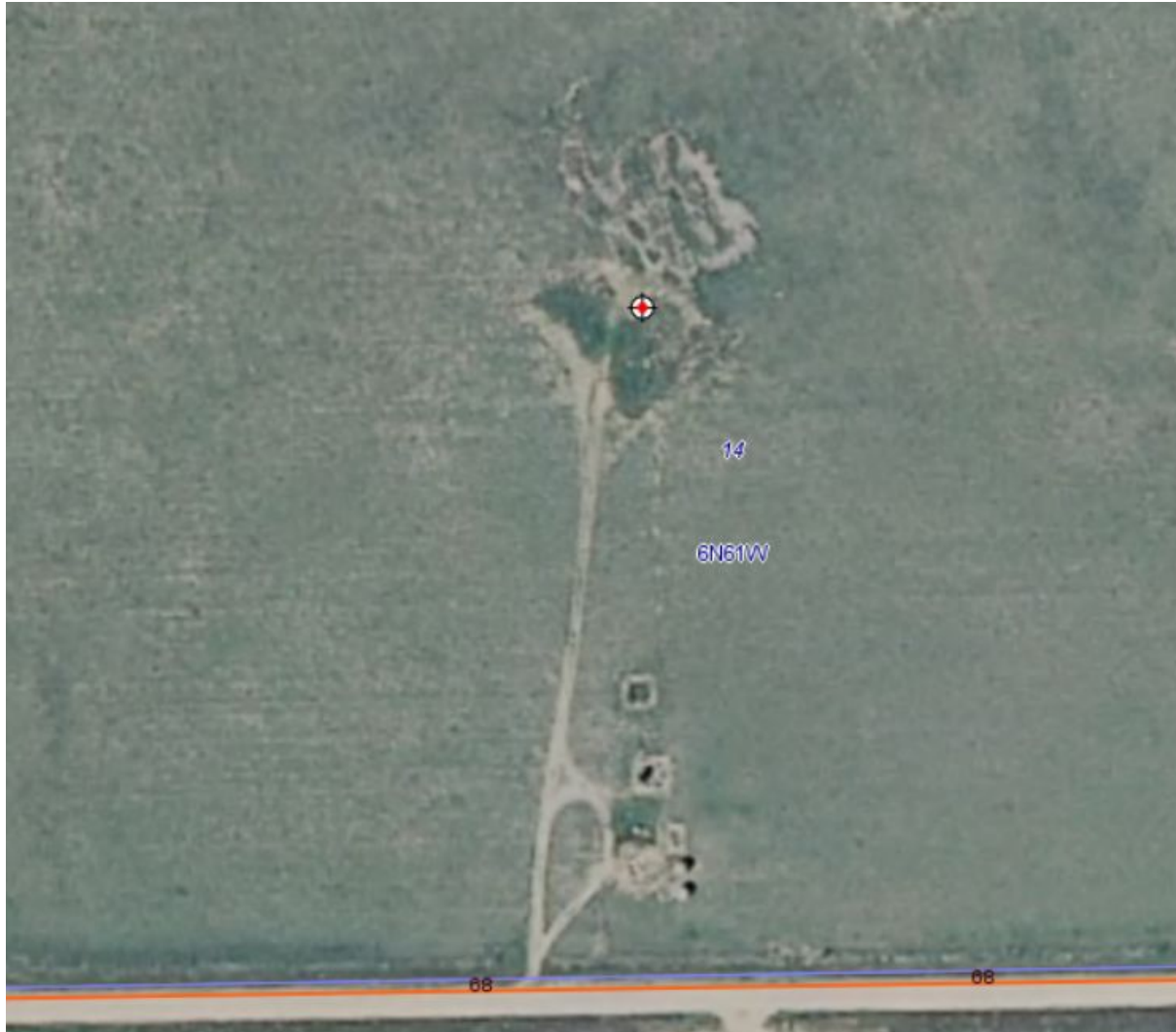
Photo 1. COGCC GISOnline aerial imagery from 2009 during active operations illustrates some of the surface disturbance.