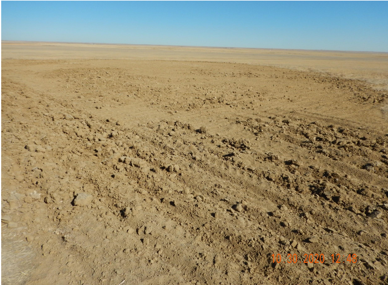
Photo 3. Photo taken from the southwestern pit area, facing Northeast. Photo illustrates recontouring has been performed but does not appear to be seeded.