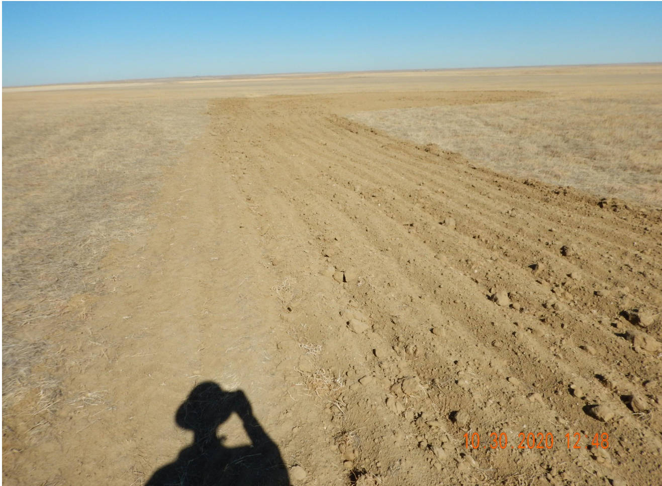
Photo 2. Photo taken from the entrance point off CR68, facing North. Photo illustrates recontouring has been performed but does not appear to be seeded.