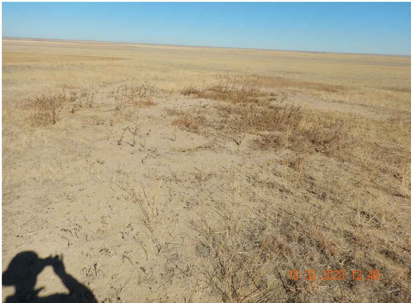
Photo 4. Photo taken south of the pit area, facing Northeast. Photo illustrates an area associated with the tank battery that is mostly bare soil or only growing annual vegetation.