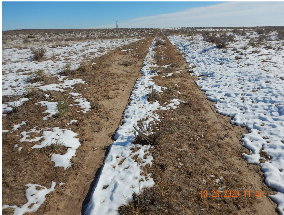
Photo 3. Photo taken from the western access road, facing East. Photo illustrates the Operator has failed to reclaim the access road.