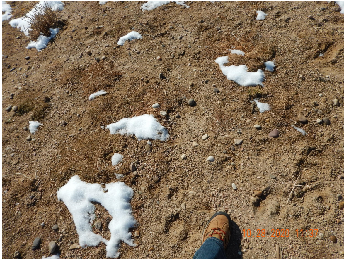
Photo 6. Close up photo of the well location, illustrating the bare ground.