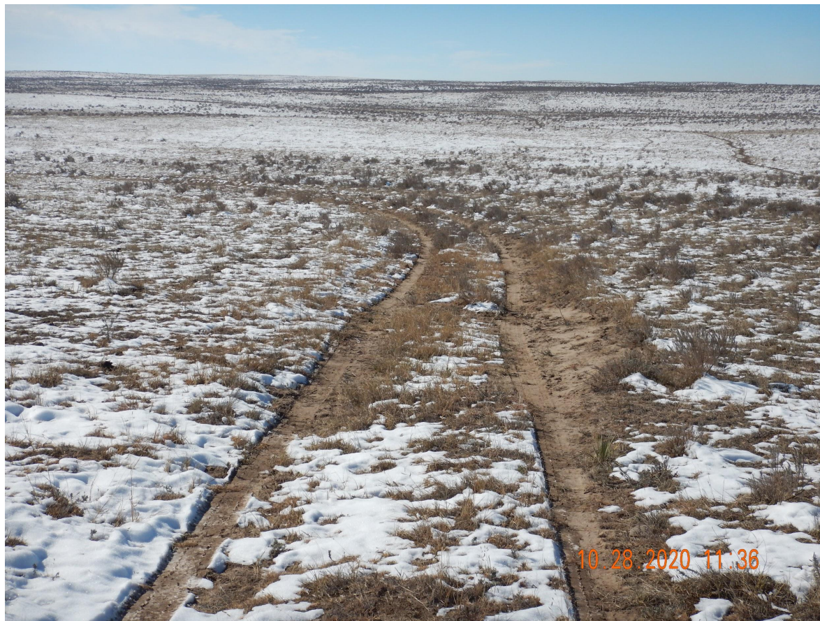
Photo 4. Photo taken from the northern access road, facing West. Photo illustrates the Operator has failed to reclaim the access road.