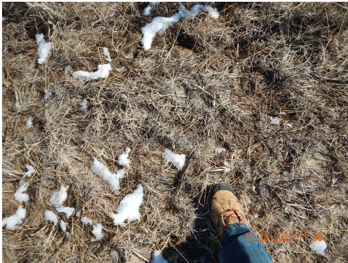
Photo 8. Close up reference photo taken north of the well location.