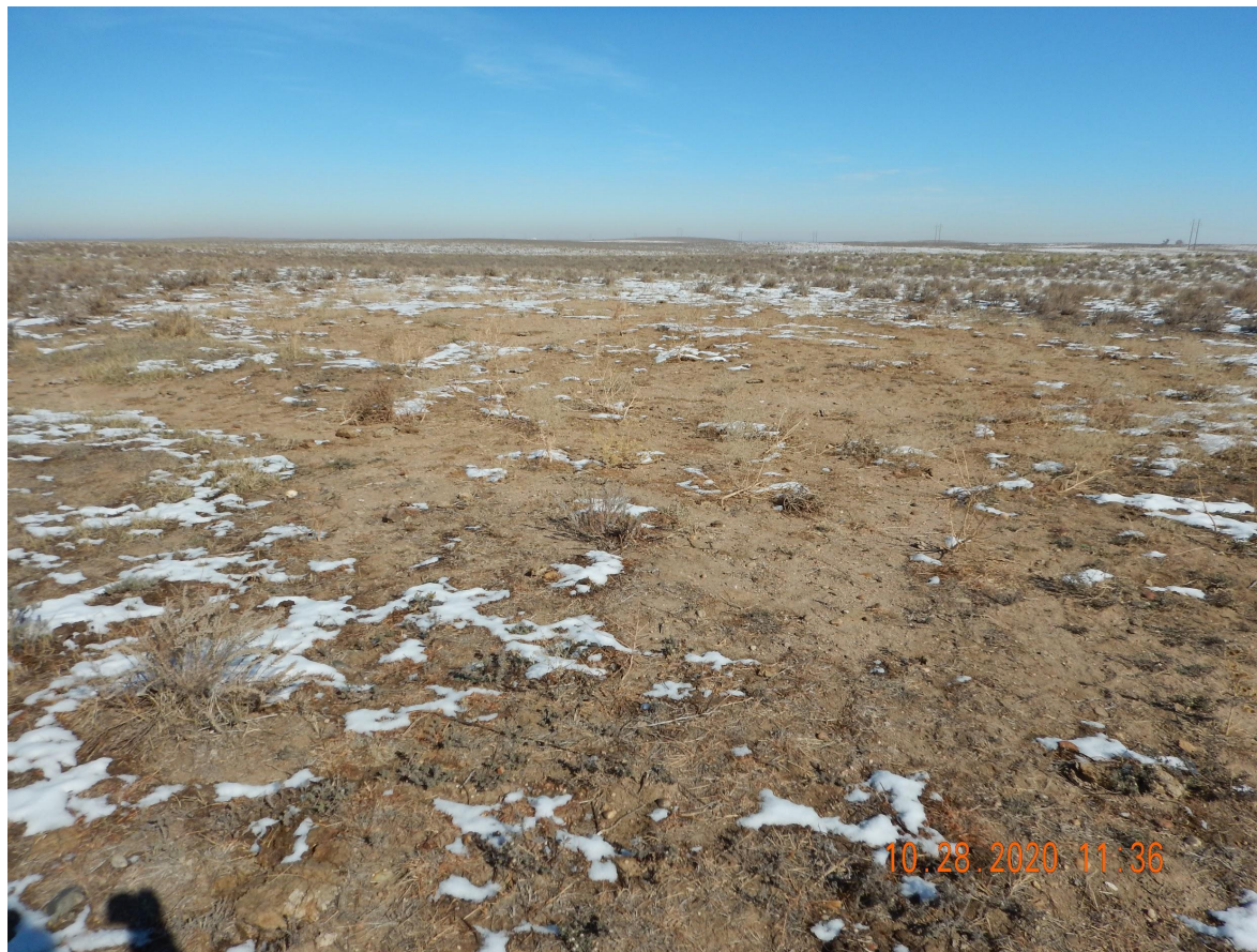
Photo 5. Photo taken from the well location, facing North. Photo illustrates an ~45'x~65 area where the pump jack was located has not been reclaimed. The well location is bare of vegetation.