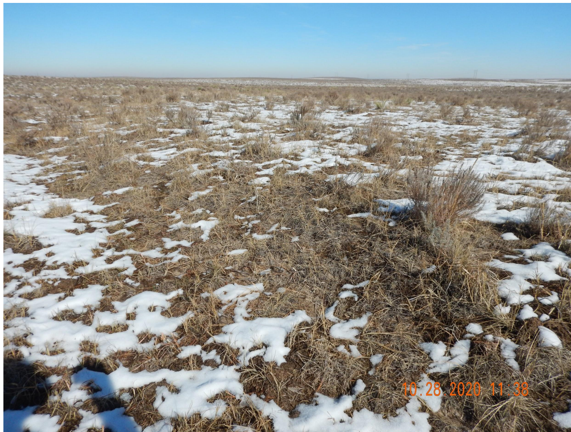
Photo 7. Reference photo taken north of the well location, facing North. Photo illustrates blue grama, purple three-awn, and sand sage.