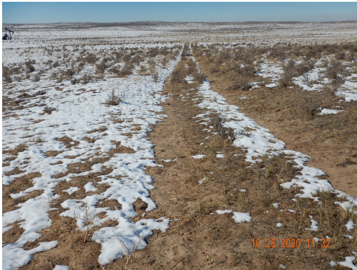
Photo 2. Photo taken from the southern access road, facing West. Photo illustrates the Operator has failed to reclaim the access road.