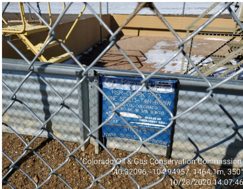
Battery sign emergency contact number