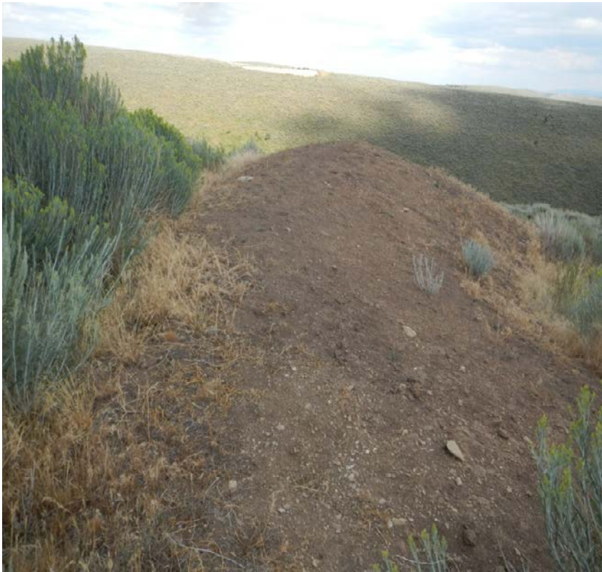
Photo#5: Bermed (topsoil) appears to be used for livestock access and loafing area.