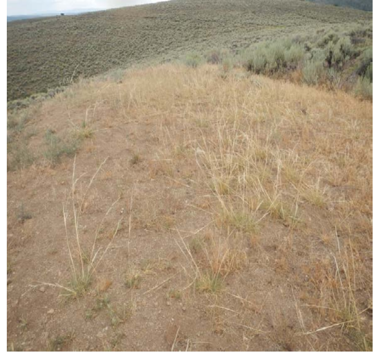
Photo#7: Berms (topsoil) , not revegetated & appear to be used for livestock loafing areas.