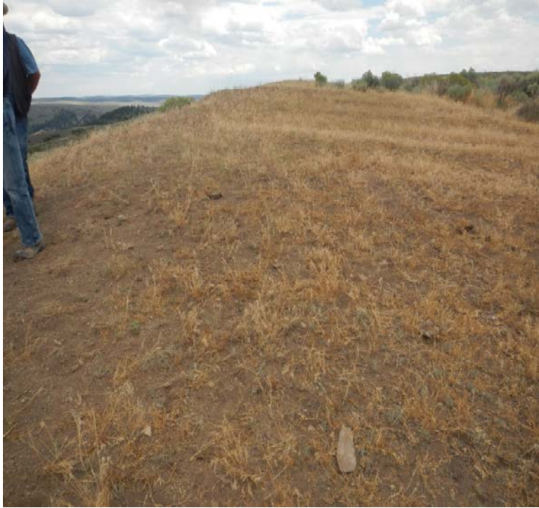
Photo#6: Berms (topsoil) , not revegetated & appear to be used for livestock loafing areas.