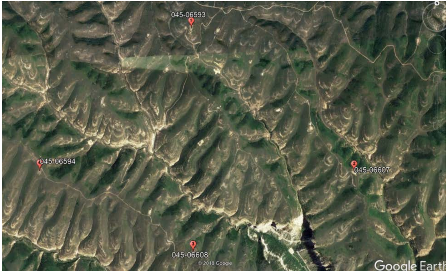
Photo#8: Aerial showing four Chevron Variance Requests. Subject Well #3 Balloon.