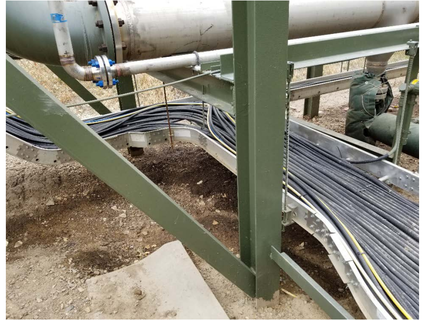
Photo #8 - Photo of residual hydrocarbon impacts along flowpath of Spill/Release ID #478242.