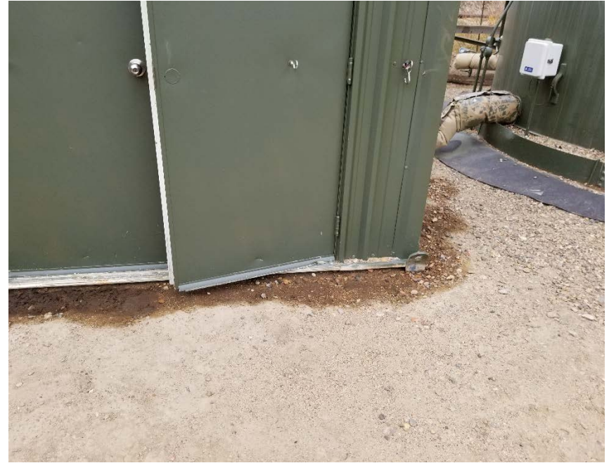
Photo #12 - Photo of residual hydrocarbon impacts along flowpath of Spill/Release ID #478242.