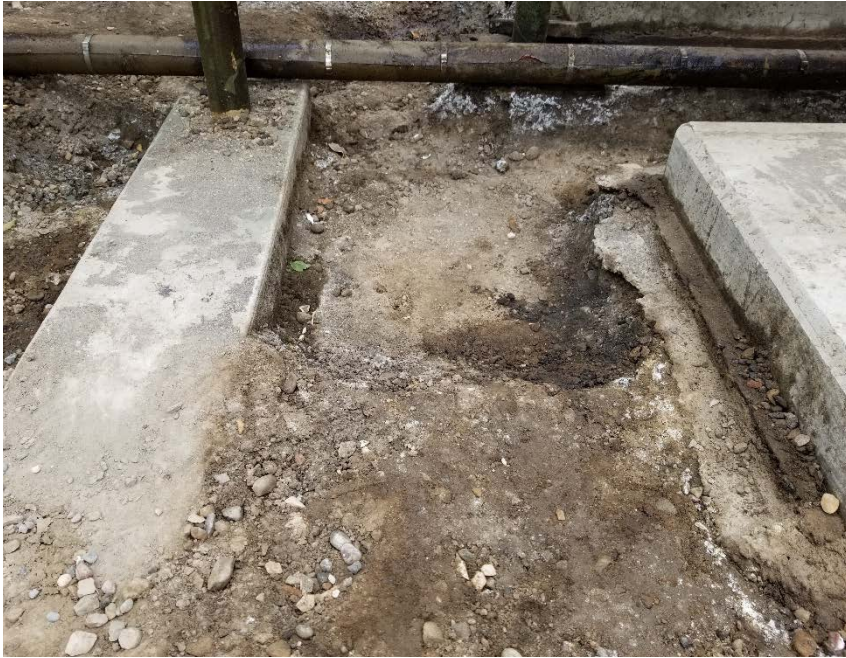
Photo #3 - Photo of residual hydrocarbon impacts around the point of release (POR) of Spill/Release ID #478242.