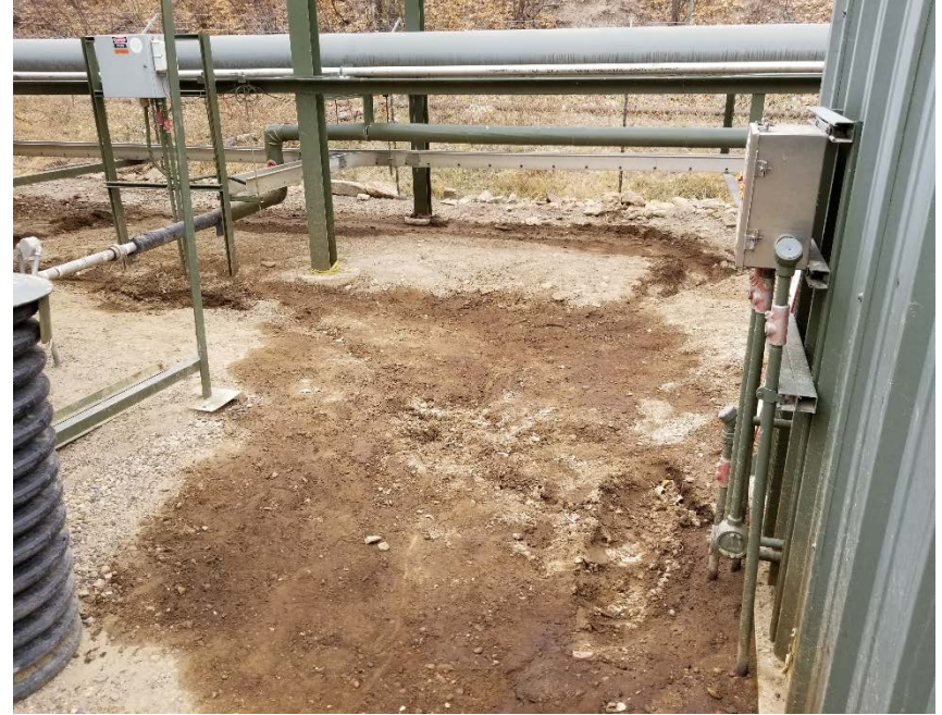
Photo #10 - Photo of residual hydrocarbon impacts along flowpath of Spill/Release ID #478242.