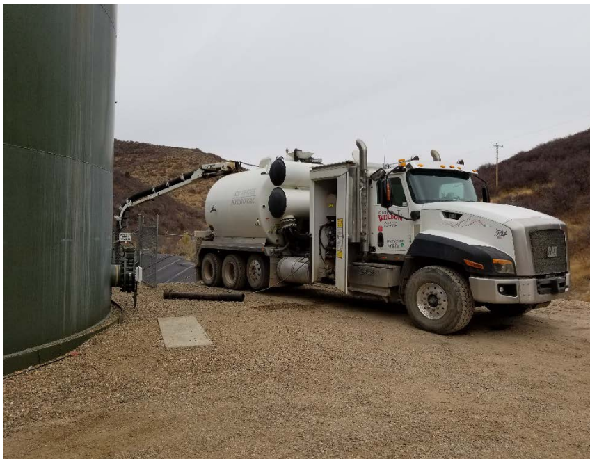
Photo #15 – Operator had staff onsite to remove materials from lined pit on inspection date.