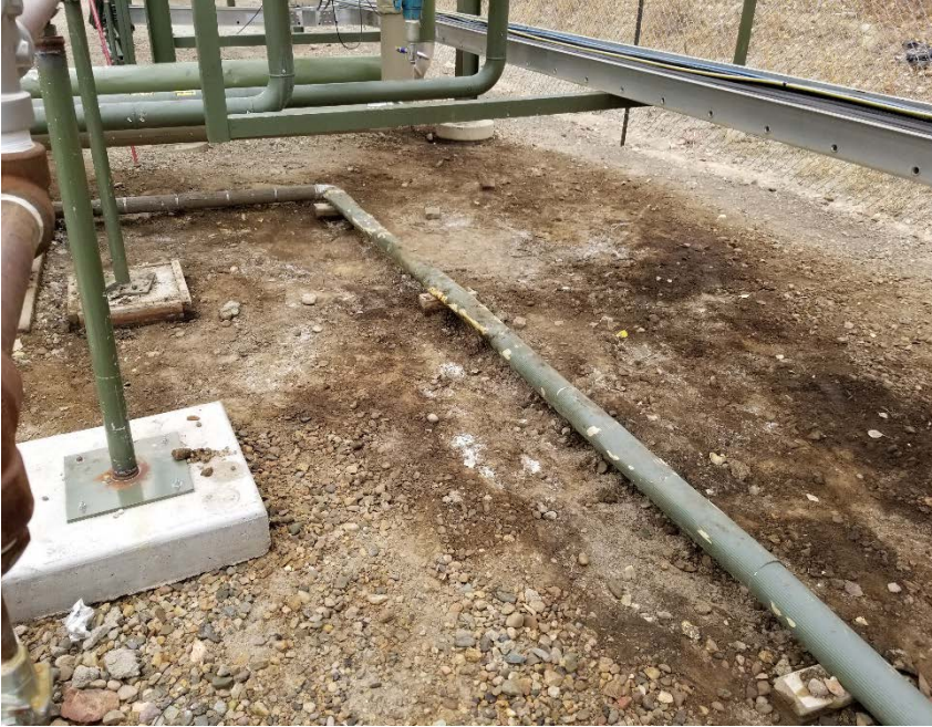
Photo #5 - Photo of residual hydrocarbon impacts along flowpath of Spill/Release ID #478242.