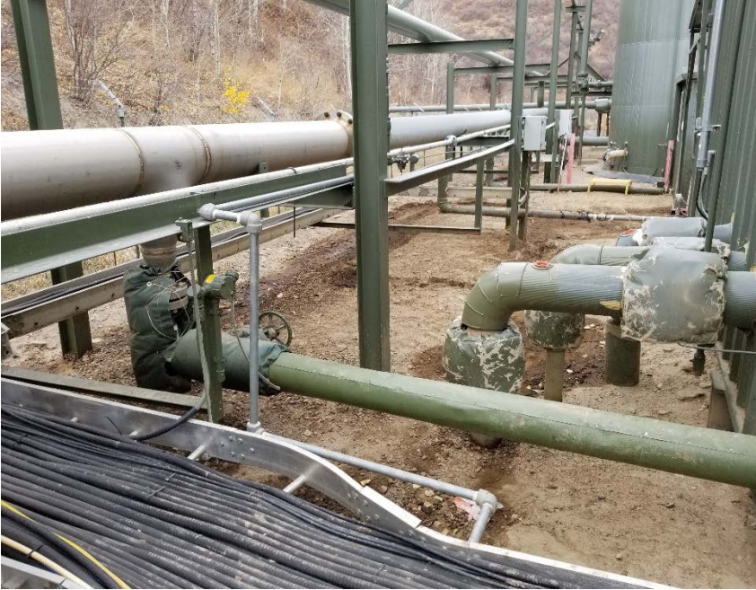
Photo #9 - Photo of residual hydrocarbon impacts along flowpath of Spill/Release ID #478242.