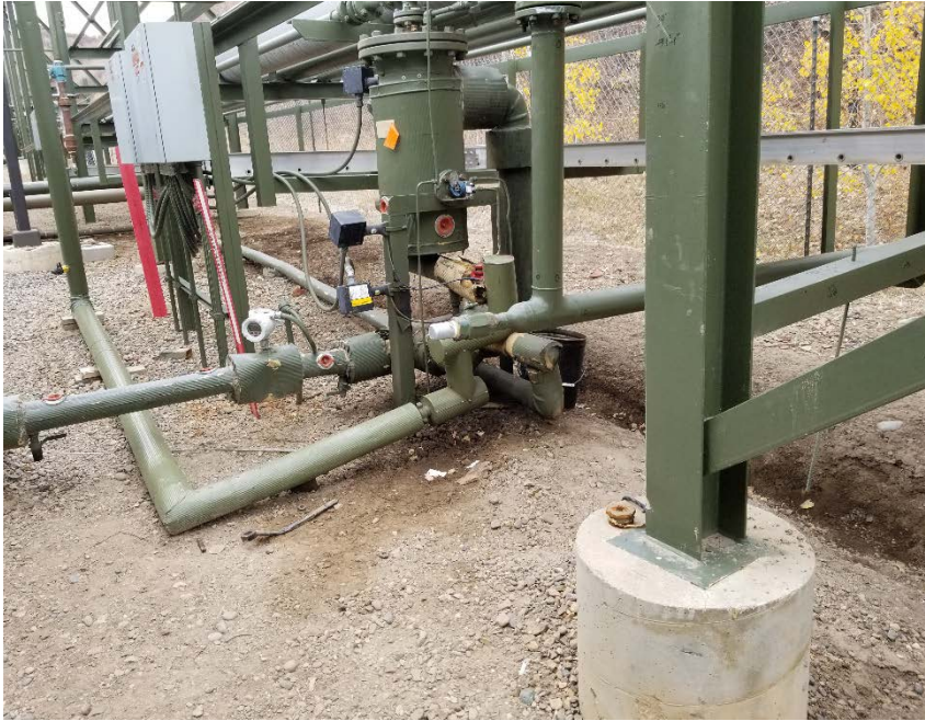
Photo #7 - Photo of residual hydrocarbon impacts along flowpath of Spill/Release ID #478242.