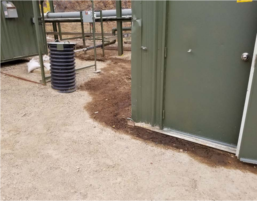
Photo #11 - Photo of residual hydrocarbon impacts along flowpath of Spill/Release ID #478242.