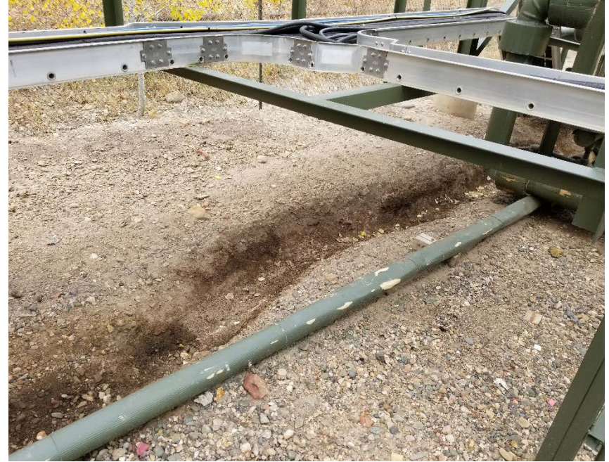
Photo #6 - Photo of residual hydrocarbon impacts along flowpath of Spill/Release ID #478242.