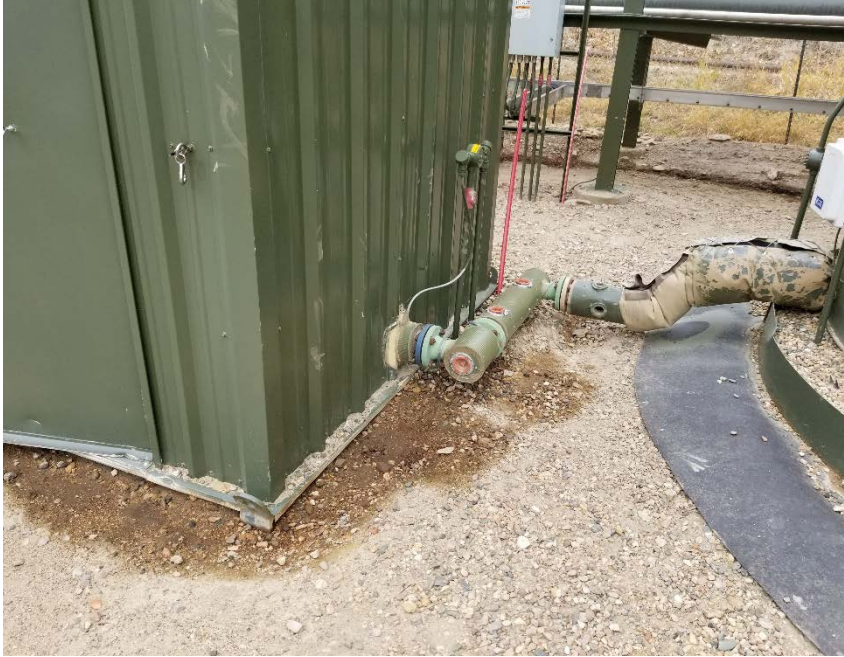
Photo #13 - Photo of residual hydrocarbon impacts along flowpath of Spill/Release ID #478242.