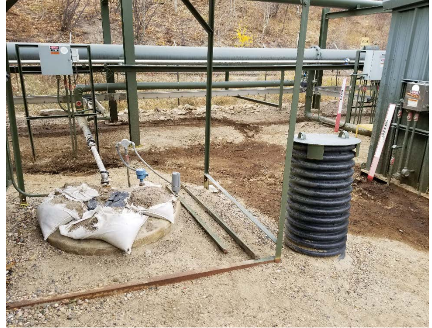
Photo #14 - Photo of residual hydrocarbon impacts along flowpath of Spill/Release ID #478242.