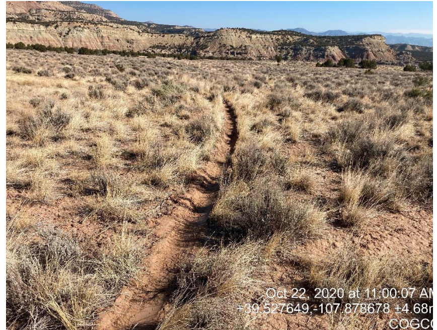
Surface disturbance from poly pipe.