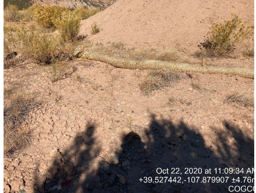
Top soil stock pile has migrated past waddles