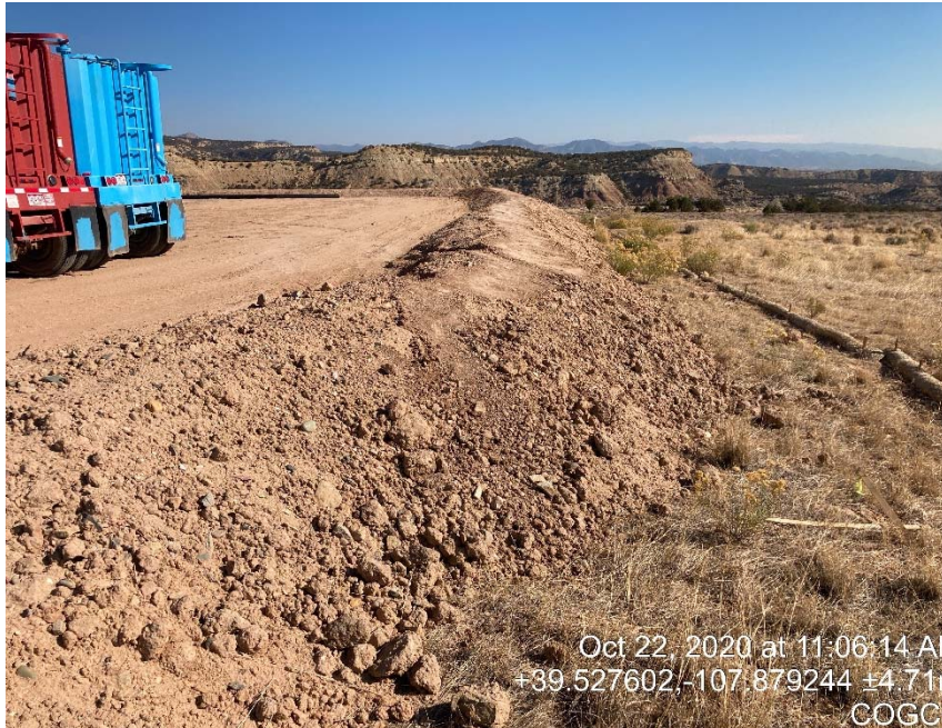
Surface disturbance from poly pipe being dragged on to pad.