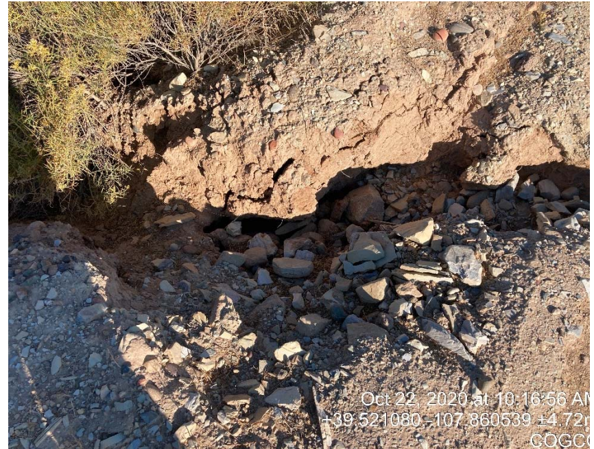
Main road to access pad erosion. At top of hill just before compressor station.