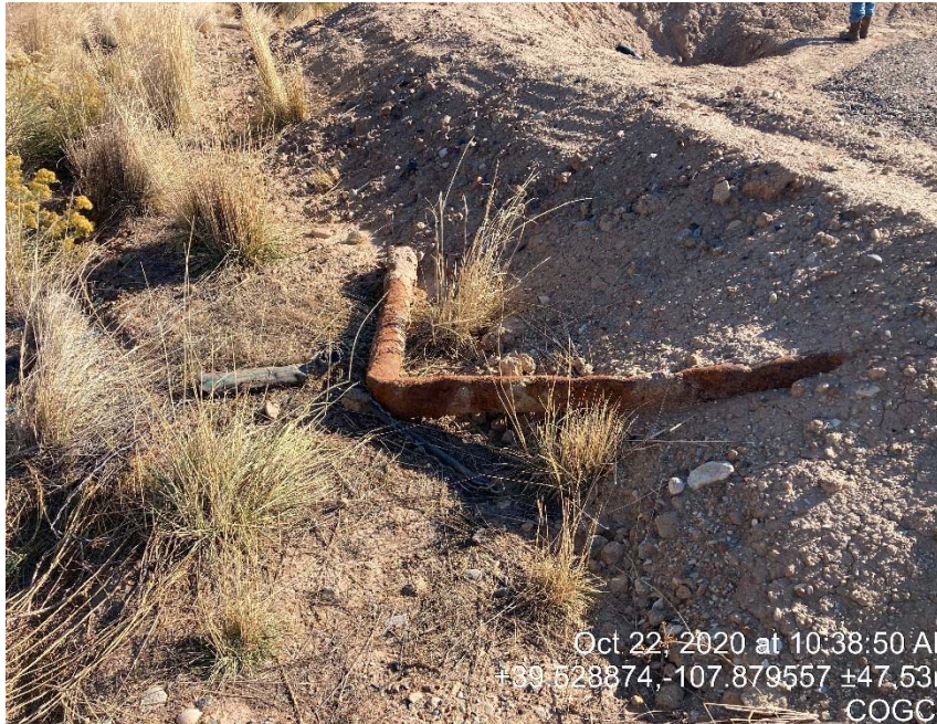
Debris in and next to new berm.