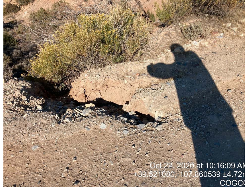
Main road to access pad erosion. At top of hill just before compressor station.