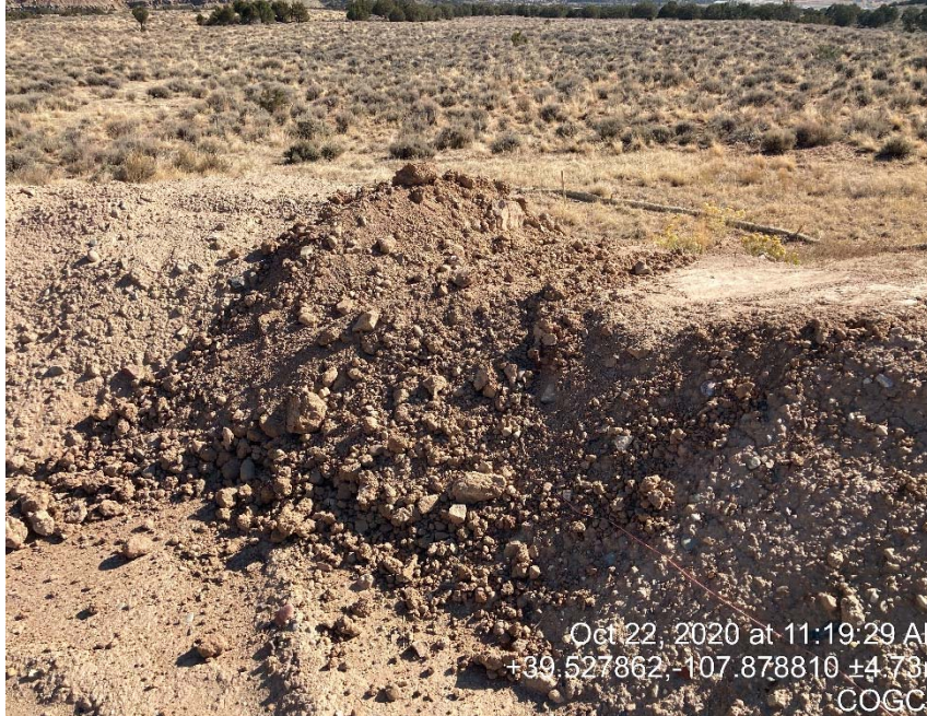
Surface disturbance from poly pipe being dragged on to pad.