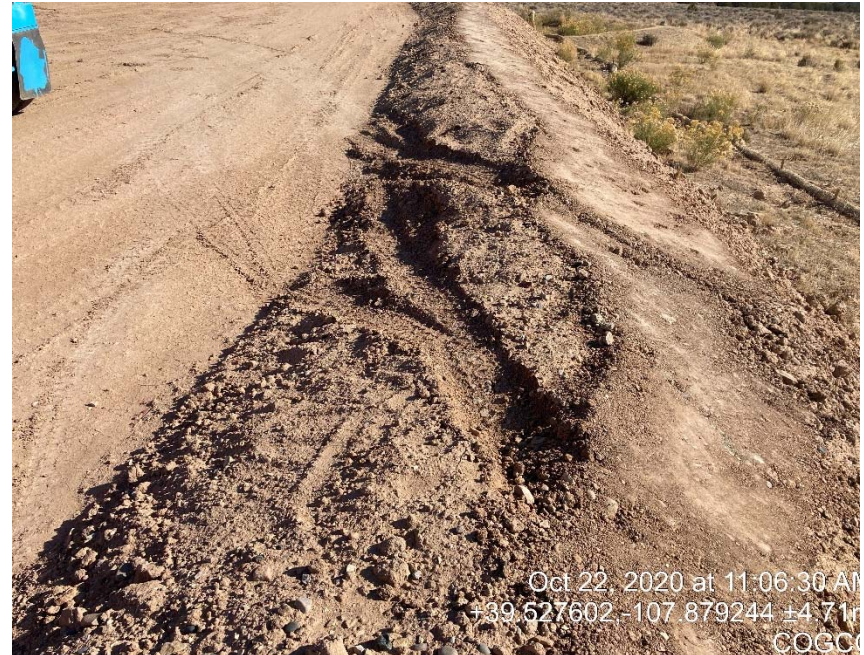
Surface disturbance from poly pipe being dragged on to pad. Truck has degraded integrity of berm.