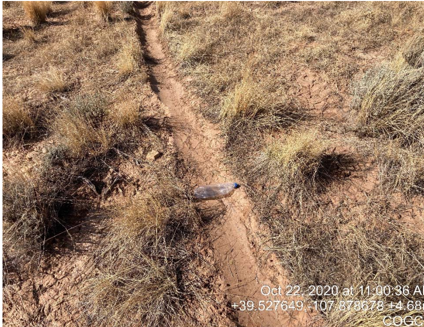
Surface disturbance from poly pipe.