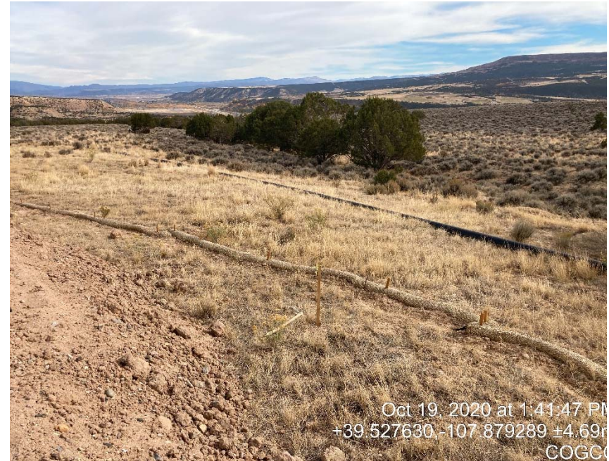
Poly pipe location before it was moved onto pad.