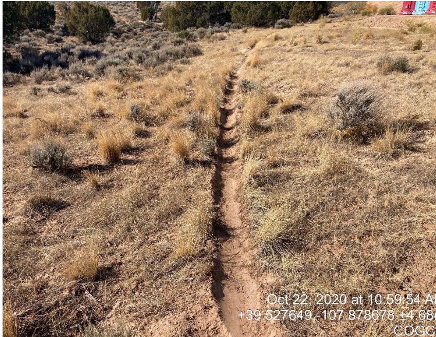
Surface disturbance from poly pipe.