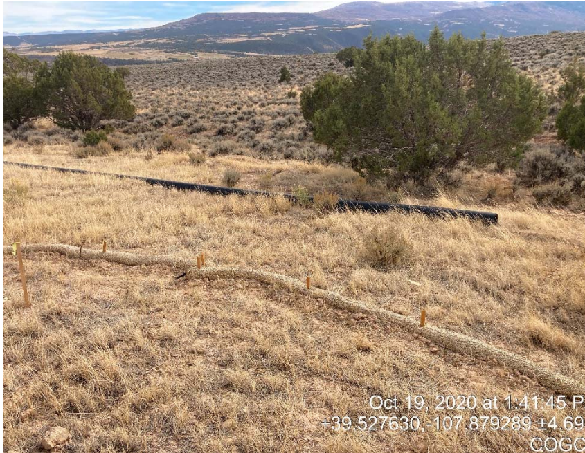
Poly pipe location before it was moved onto pad.