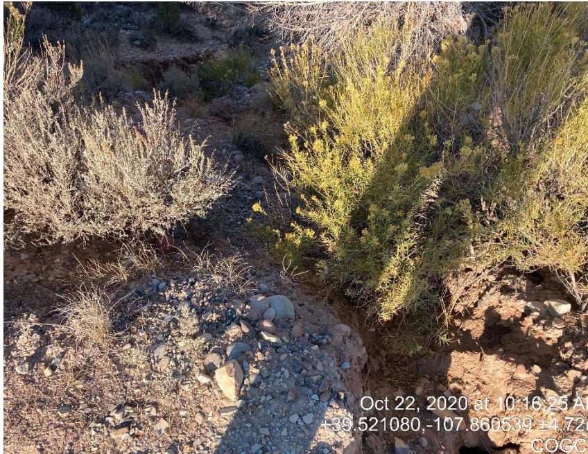
Main road to access pad erosion. At top of hill just before compressor station.