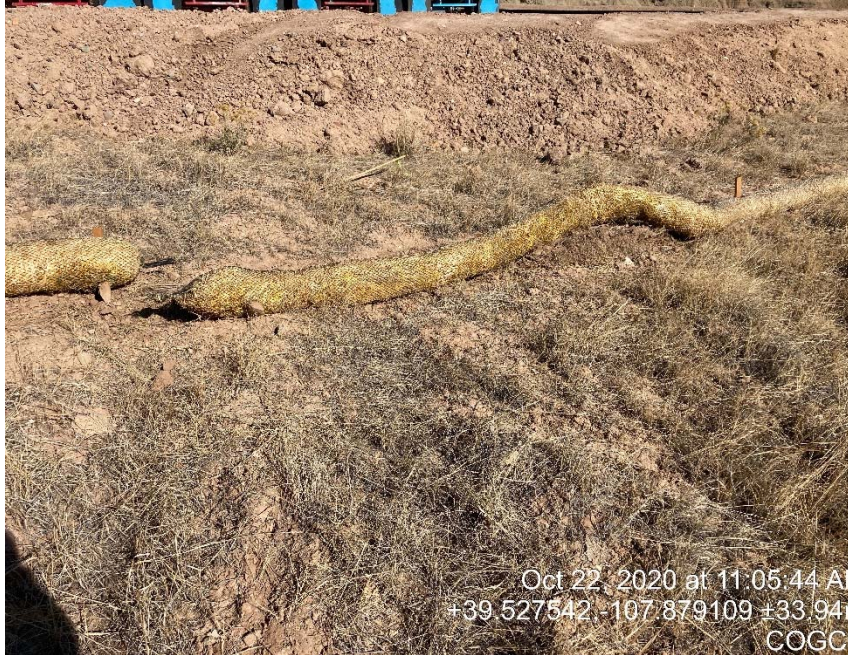
Surface disturbance from poly pipe being dragged on to pad.