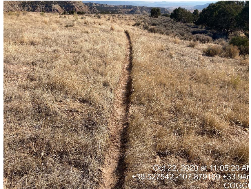
Surface disturbance from poly pipe.