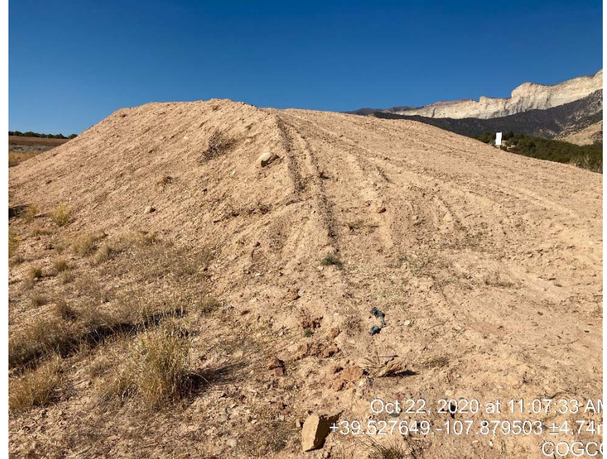
Top soil stock pile need stabilization.