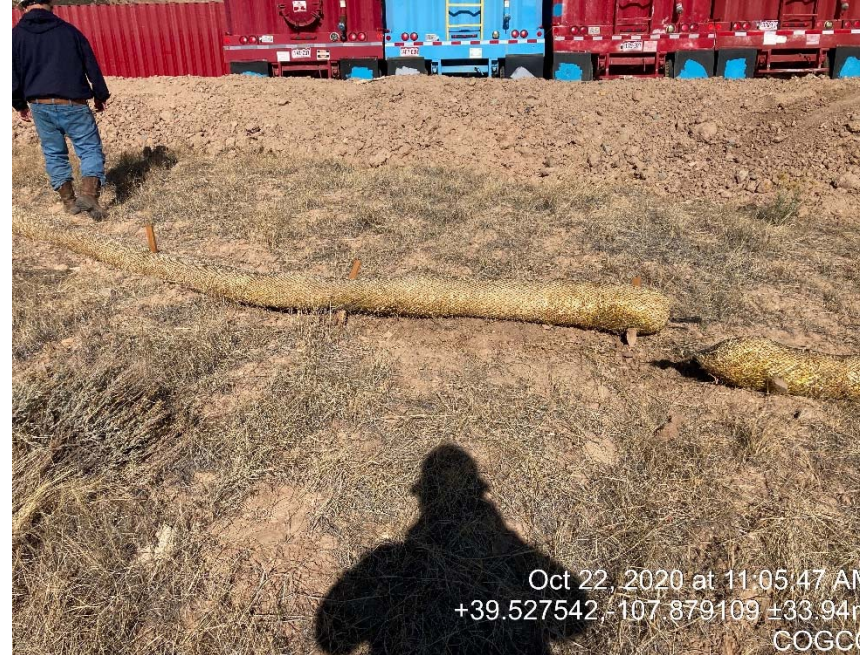
Surface disturbance from poly pipe being dragged on to pad.