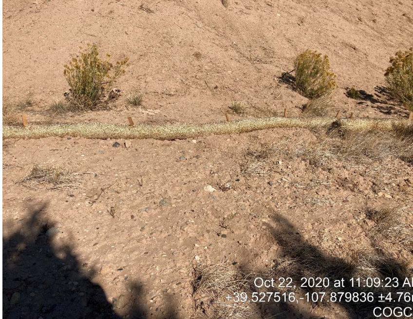
Top soil stock pile has migrated past waddles