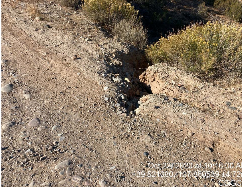
Main road to access pad erosion. At top of hill just before compressor station.