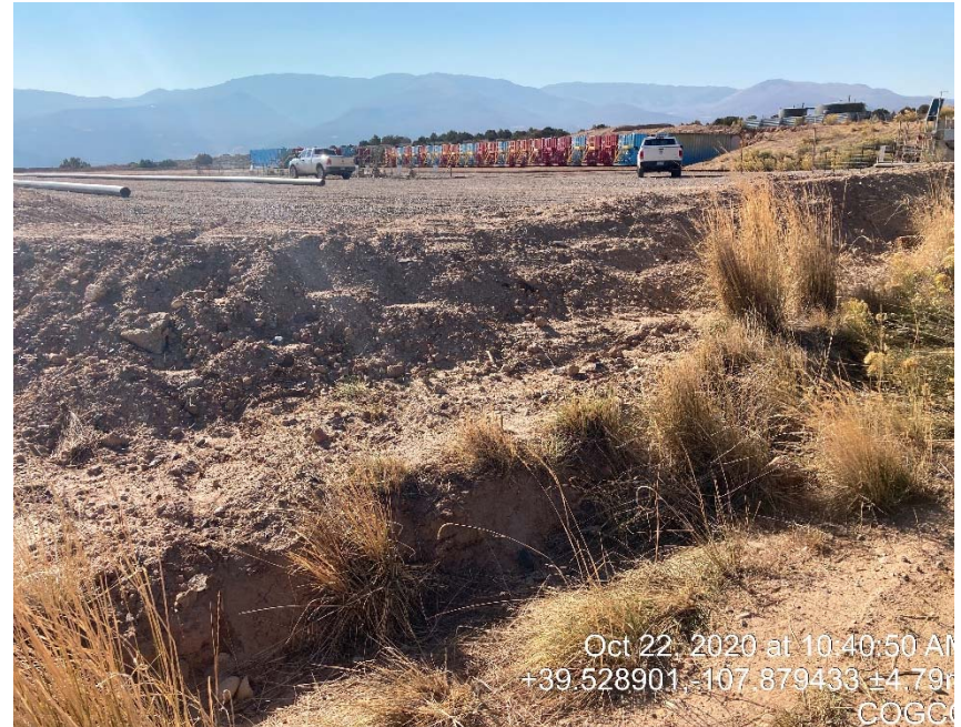
Berm sediment migration to ditch on main road.