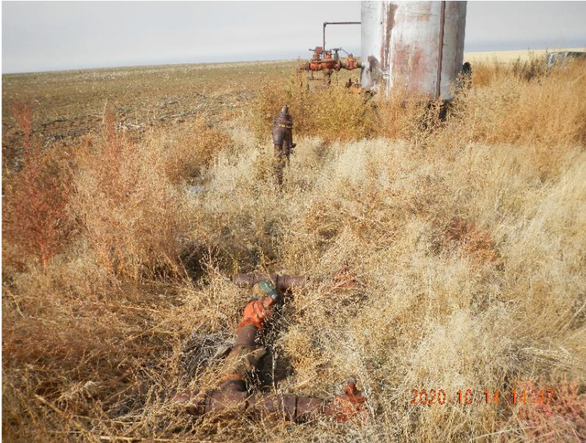
Photo 11: Additional view of risers located between treater and tanks at production facility.