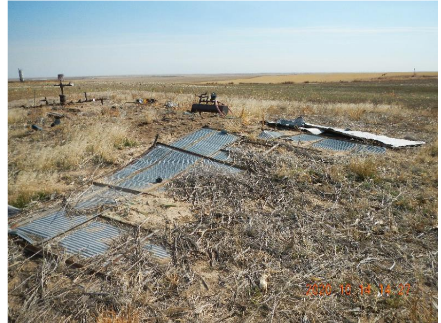
Photo 4: Collapsed shed with gas vessel and wellhead in background.