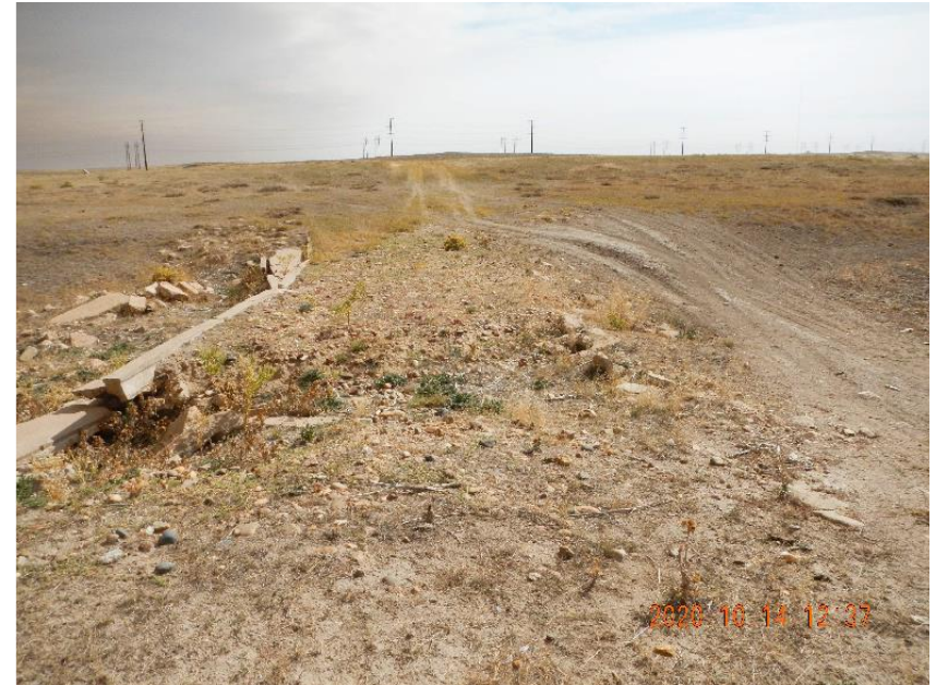
Photo 10: Access road where traffic is leaving the road and driving around erosion channel.