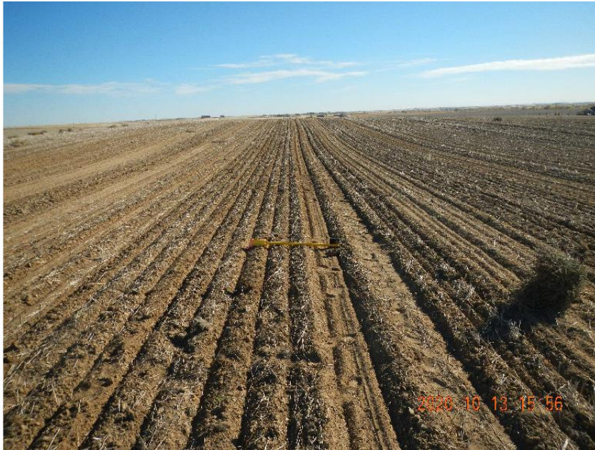
Photo 3: View of locating equipment over located plugged and abandoned surface casing.