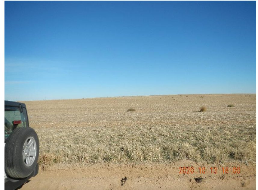
Photo 4: View looking E from CR towards plugged and abandoned well location.