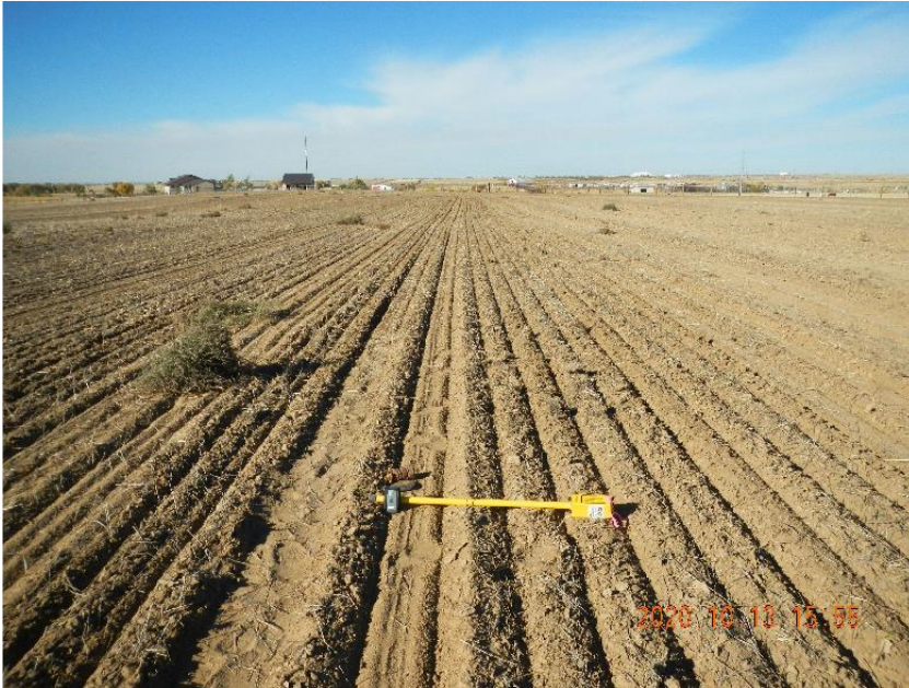
Photo 1: View of locating equipment over located plugged and abandoned surface casing.

Well Name : LJT Partnership 44-33 API # : 123-11243