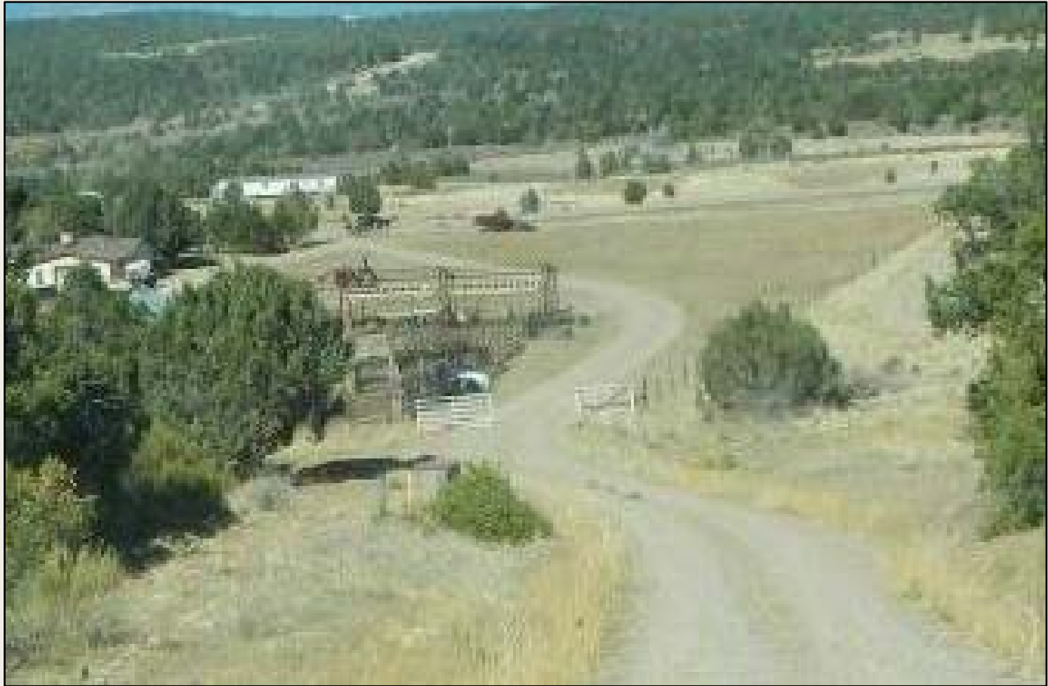
Photo 6. View of farm gates already open while entering and leaving location.