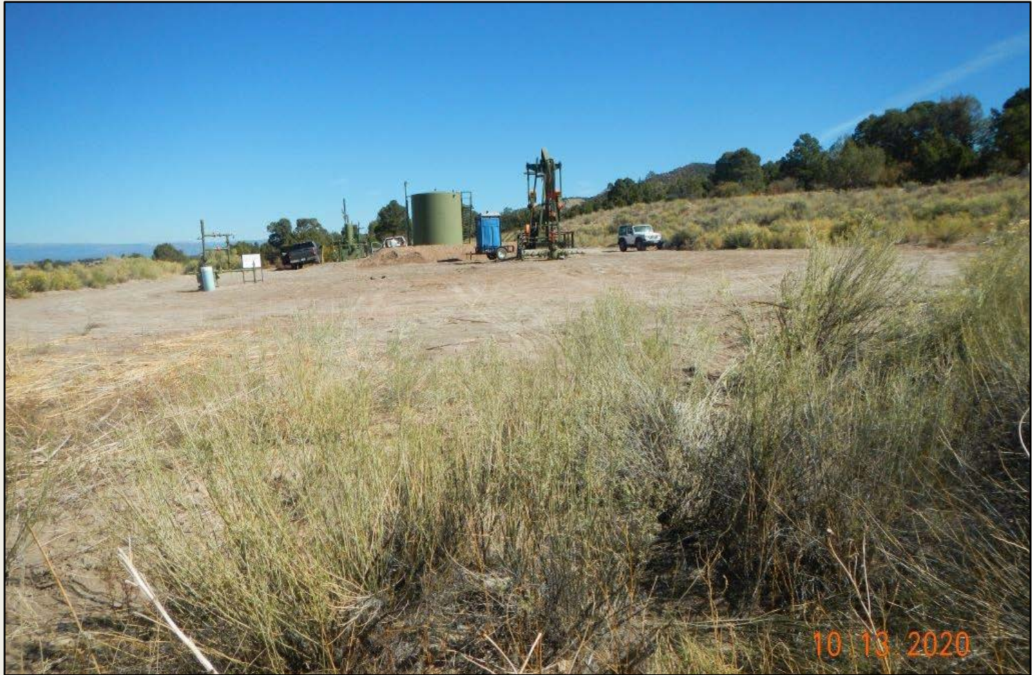
Photo 1. View of the project area from the northwestern corner facing center.