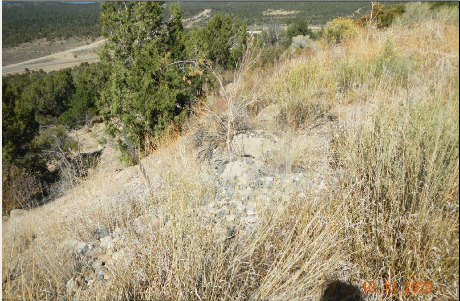
Photo 3. View of revegetation in the northwestern fill slope, that appears to be stabilized at this time.