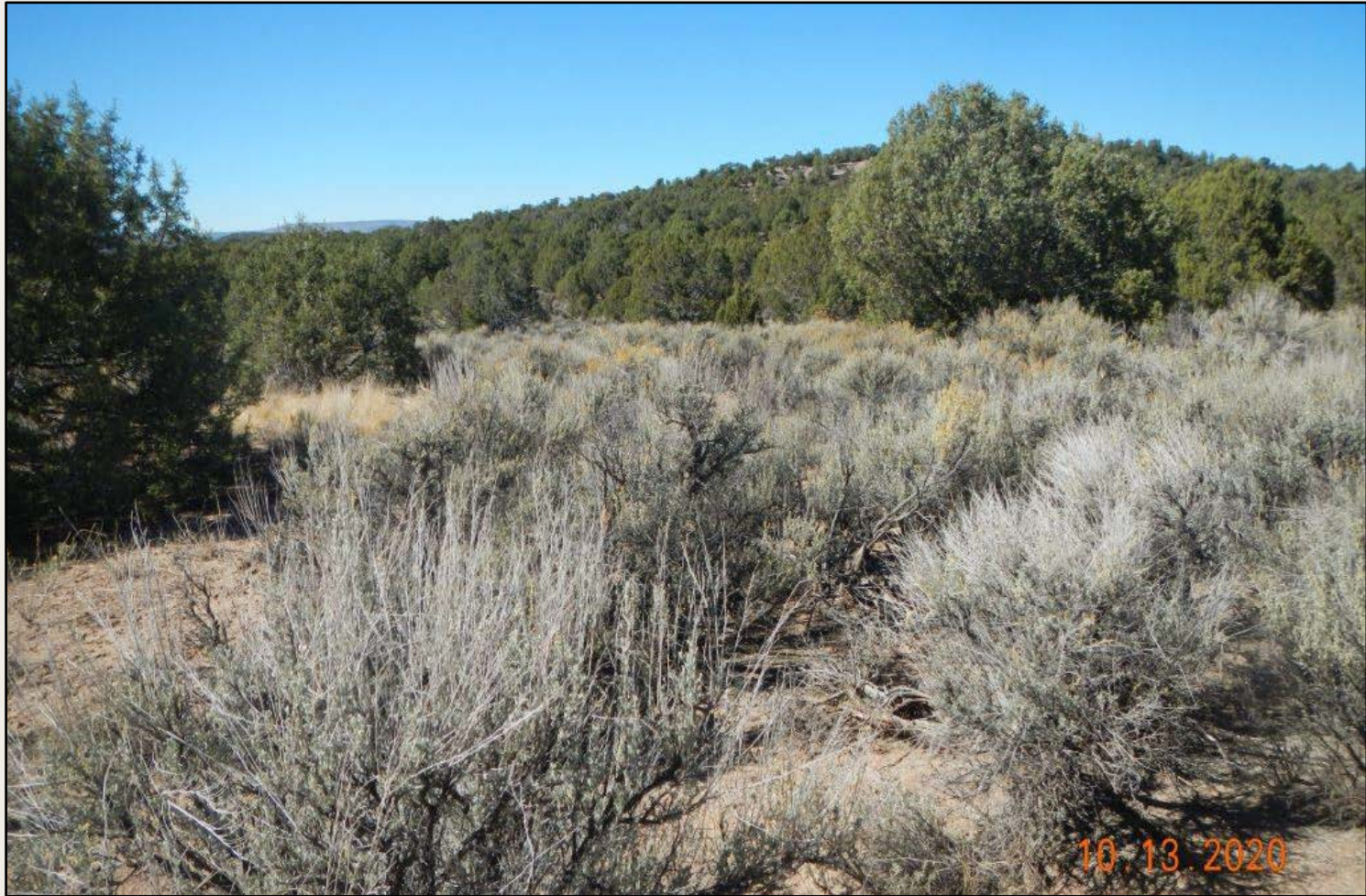
Photo 5. View of reference area vegetation comprised of pinyon and juniper woodland with and understory of sagebrush, squirreltail, Indian ricegrass, and mixed forbs.