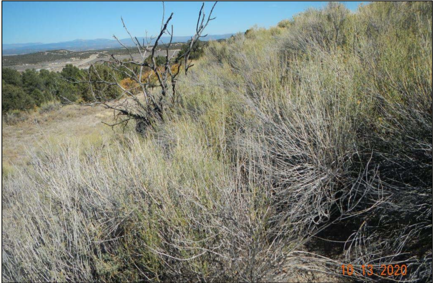
Photo 2. View of the northern fill slope from the northwestern corner facing eastward. Revegetation is progressing with smooth brome, western wheatgrass, and rubber rabbitbrush.