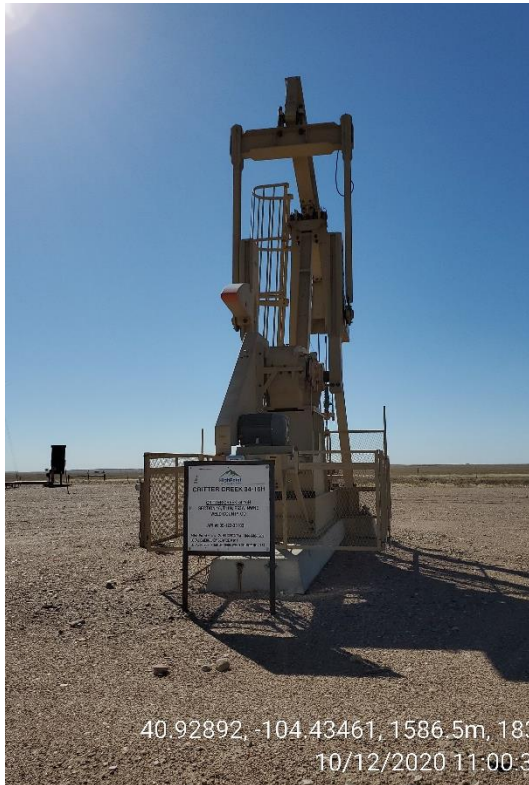
Photo 1 05-123-33103 Critter Creek 34-16H