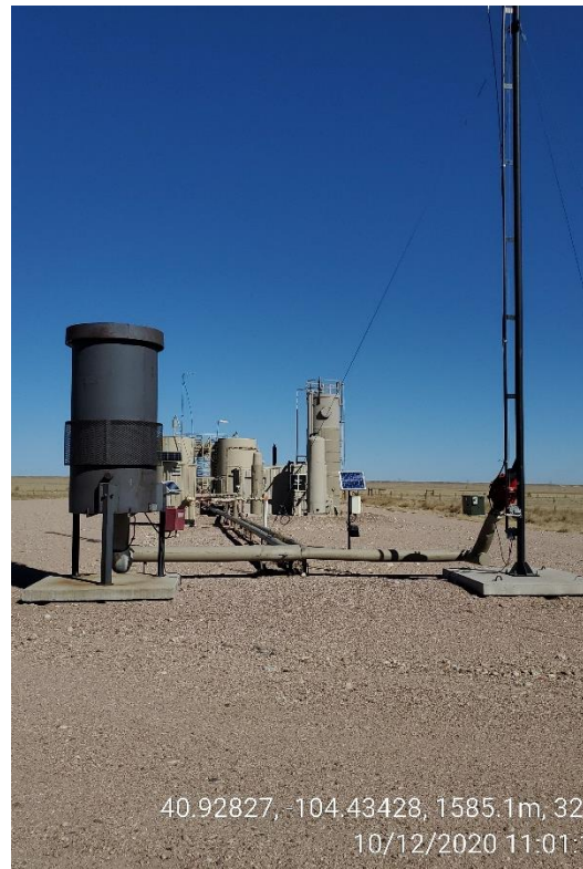
Photo 2 Production Equipment