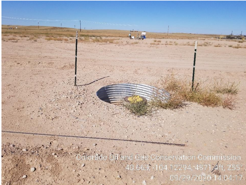
Photo 3 – 8-60-17-20-2 Wellhead, Weeds