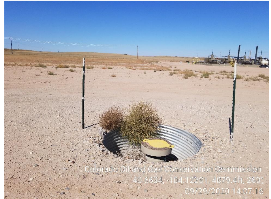
Photo 4 – 8-60-17-8-5 Wellhead, Weeds