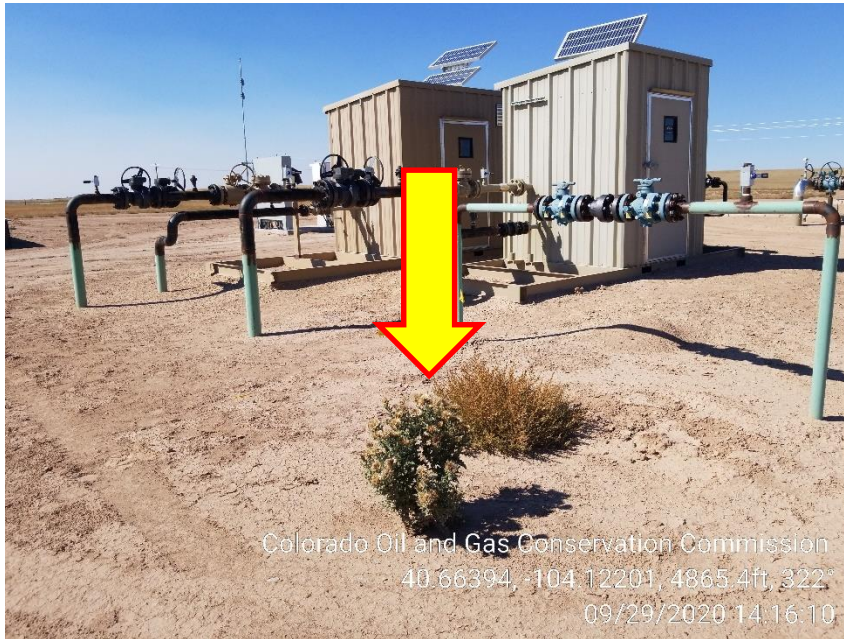
Photo 11 Gas Meters, Weeds