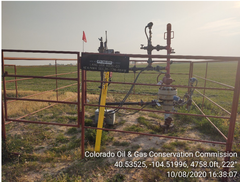
Colorado Oil & Gas Conservation Commission 40.53525, -104.51996, 4758.0ft, 222° 10/08/2020 16:38:07