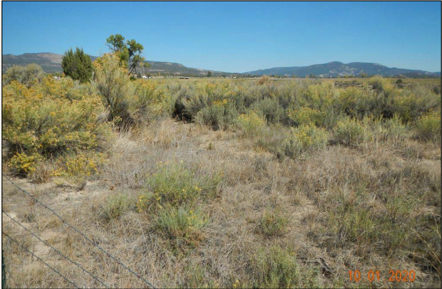
Photo 4. View of reference area vegetation comprised of dense rubber rabbitbrush with understory of grasses such as sand dropseed and western wheatgrass.