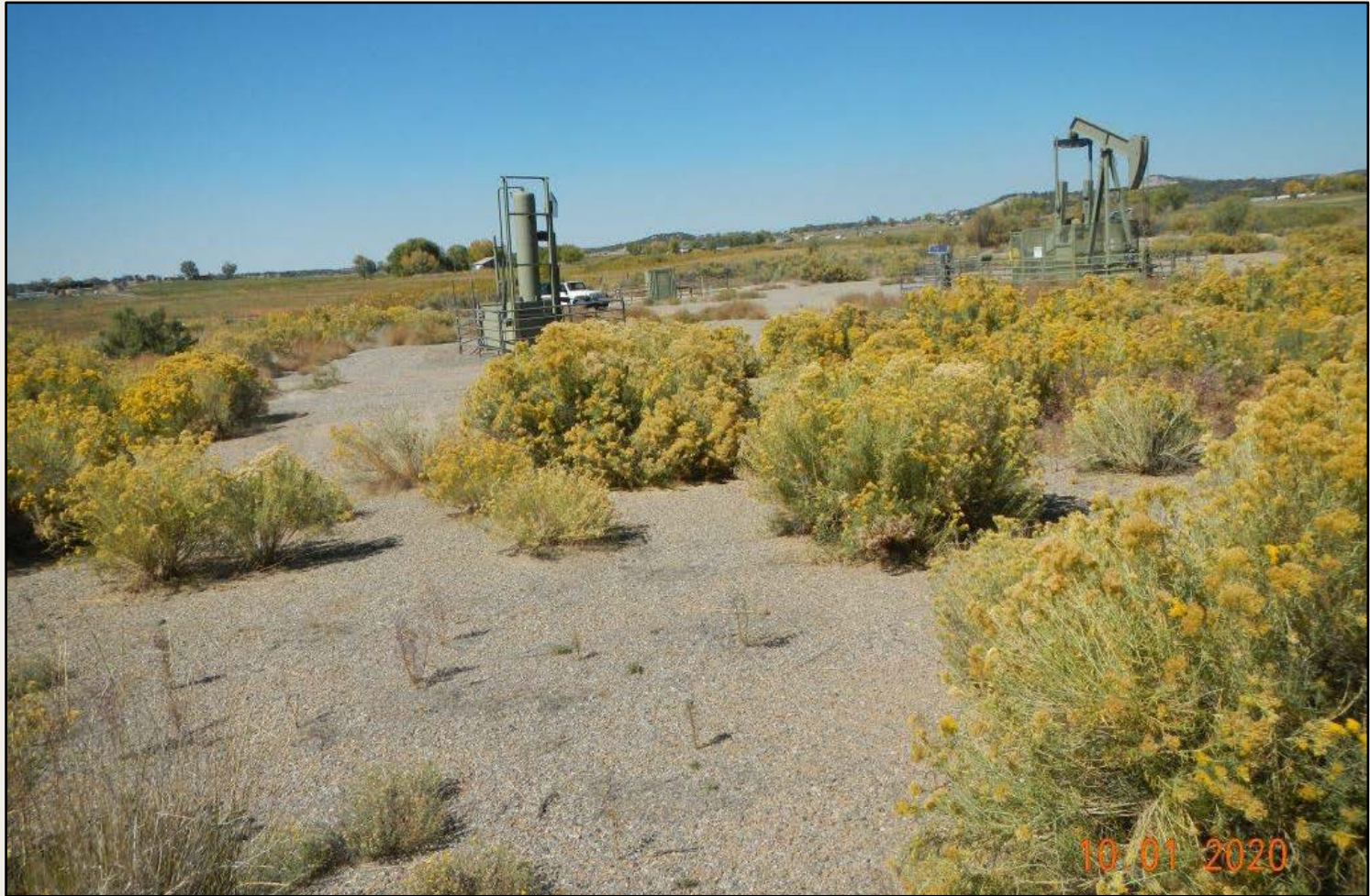
Photo 1. View of the project area from the southeastern corner facing center.