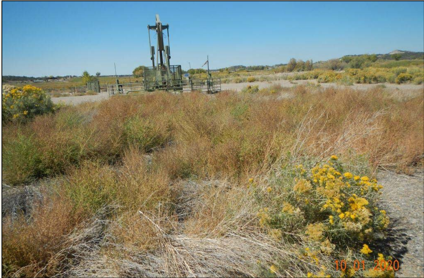
Photo 3. View of dense Russian thistles growing on the well pad, need to be removed and properly disposed of.