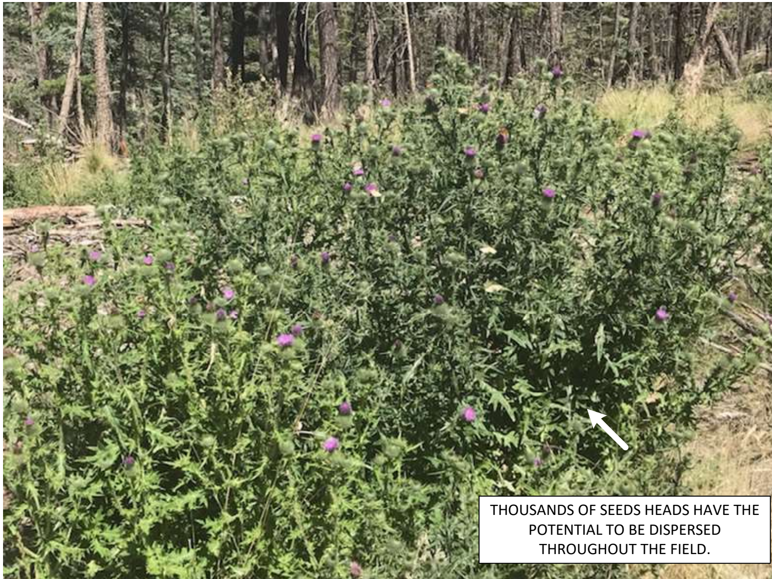
PHOTO 8 : THE COLORADO PARKS AND WILD LIFE (CPW) HAVE ON GOING TREE CLEARING OPERATIONS IN THE BOSQUE DEL OSO STATE WILDLIFE AREA. THE NOXIOUS WEEDS IN THE FOREST (UNDISTURBED NATURAL VEGETATION) IS THE RESPONSIBILITY OF THE CPW TO MANAGE.

APACHE CANYON 10-01 API# 05-071-08277 – TIMBER CREEK OPERATING OGCC OPERATOR NUMBER 10672 - DATE: SEPTEMBER 05, 2020 CORRECTIVE ACTIONS COMPLETED REGARDING COGCC FIR DOCUMENT # 695103256