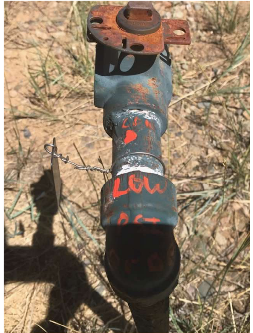
PHOTO 2: THERE IS A HIGH PRESSURE DRIP RISER AND A LOW PRESSURE DRIP RISER THAT ARE IN USE AND WERE MARKED WITH AN ORANGE MARKING PIN FOR ADDITIONAL IDENTIFICATION.