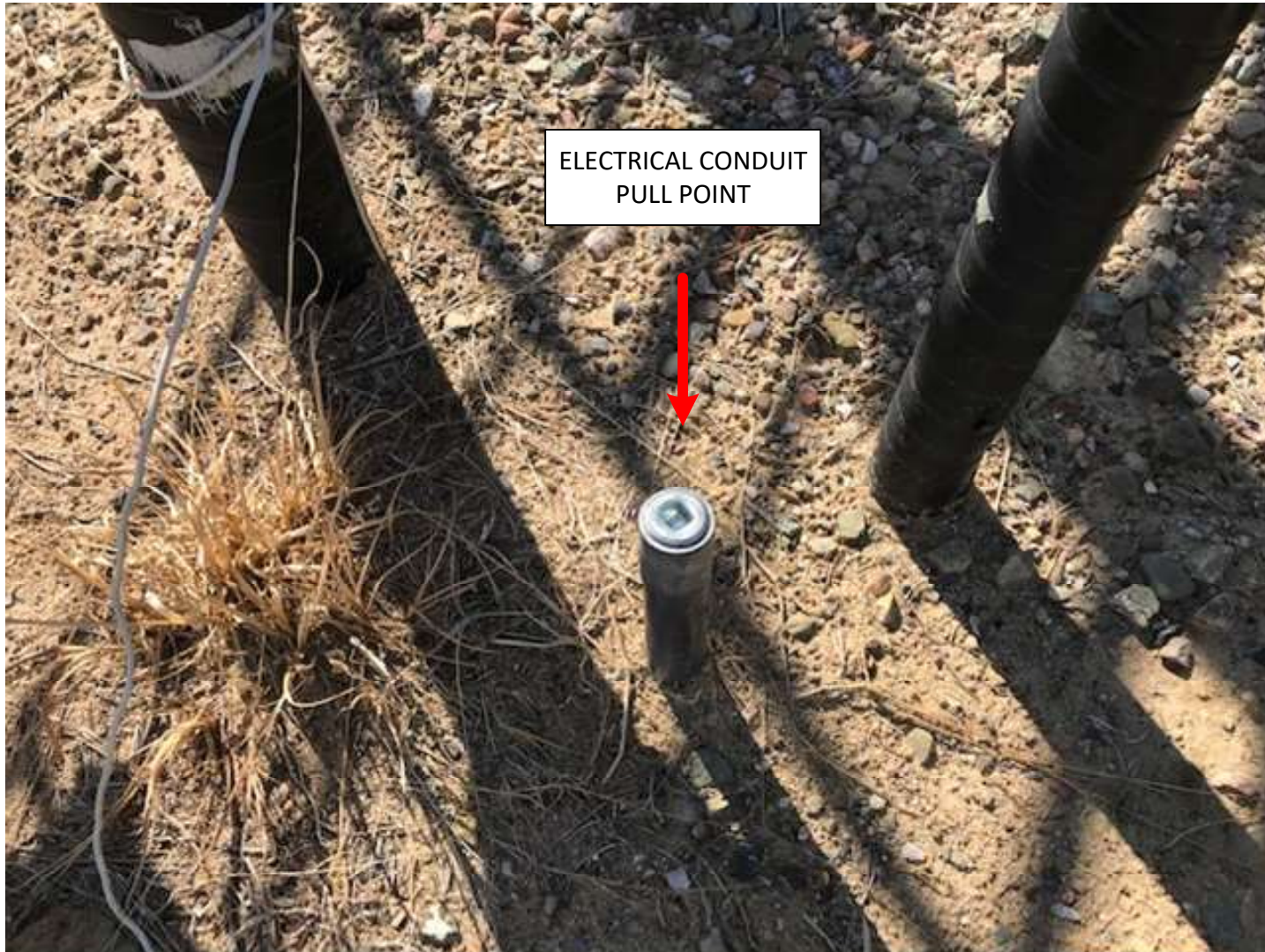
PHOTO 3: THIS IS AN ELECTRICAL CONDUIT PULL POINT AND NOT A " RISER". THE END CAP WAS IMPROVED.

APACHE CANYON 10-01 API# 05-071-08277 – TIMBER CREEK OPERATING OGCC OPERATOR NUMBER 10672 - DATE: SEPTEMBER 03, 2020 CORRECTIVE ACTIONS COMPLETED REGARDING COGCC FIR DOCUMENT # 695103256