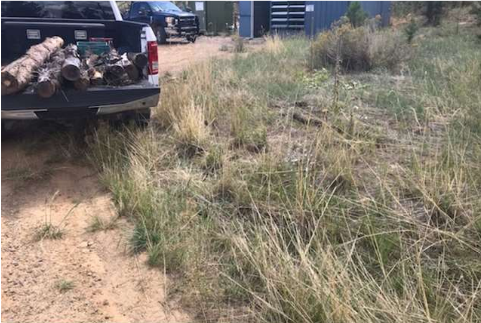
PHOTO 4 : THE COLORADO PARKS AND WILD LIFE (CPW) HAVE ON GOING TREE CLEARING OPERATIONS IN THE BOSQUE DEL OSO STATE WILDLIFE AREA. THESE TREE DEBRIS WERE DROPPED OFF ON LOCATION BY THE LOGGING COMPANY. TIMBER CREEK RELOCATED DISCARDED TREE CUTTINGS FROM WELL PAD TO THE NEAR BY SLASH PILES.

APACHE CANYON 10-01 API# 05-071-08277 – TIMBER CREEK OPERATING OGCC OPERATOR NUMBER 10672 - DATE: SEPTEMBER 15, 2020 CORRECTIVE ACTIONS COMPLETED REGARDING COGCC FIR DOCUMENT # 695103256