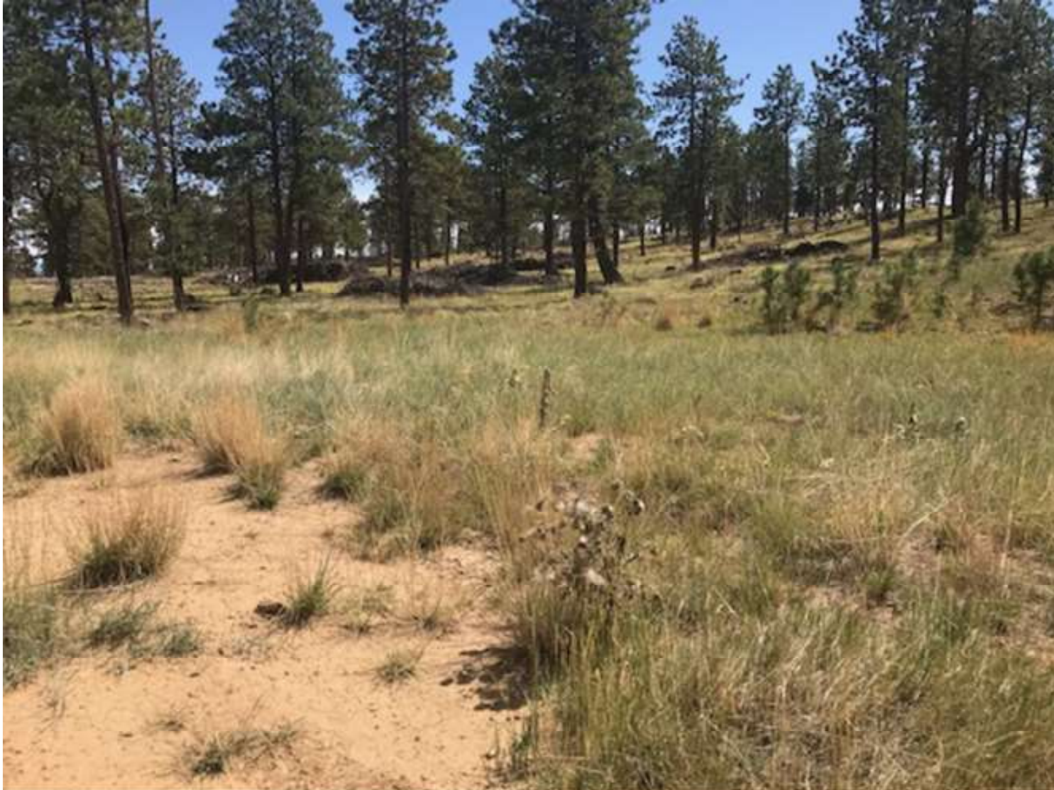
PHOTO 6 : THE NOXIOUS WEEDS ON THE WELL PAD AND ADJACENT TO THE LEASE ROAD WEST OF LOCATION WERE TREATED ON 09/05/20.

APACHE CANYON 10-01 API# 05-071-08277 – TIMBER CREEK OPERATING OGCC OPERATOR NUMBER 10672 - DATE: SEPTEMBER 05, 2020 CORRECTIVE ACTIONS COMPLETED REGARDING COGCC FIR DOCUMENT # 695103256