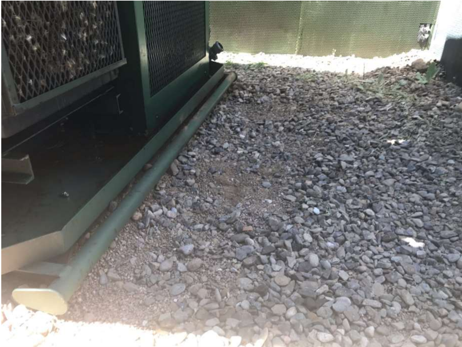
PHOTO 5 : THE IMPACTED SOIL NEAR THE COMPRESSOR INSIDE THE SOUND WALLS HAS BEEN CLEANED UP.

APACHE CANYON 10-01 API# 05-071-08277 – TIMBER CREEK OPERATING OGCC OPERATOR NUMBER 10672 - DATE: SEPTEMBER 03, 2020 CORRECTIVE ACTIONS COMPLETED REGARDING COGCC FIR DOCUMENT # 695103256