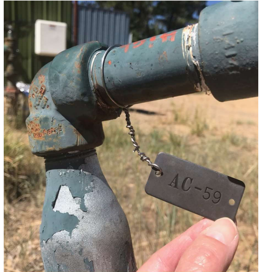
PHOTO 1: THE (2) RISERS ARE IN USE AND EACH ONE HAS BRASS TAG WHICH ARE VISABLE IN THE FIELD INSPECTION REPORT DOC # 695103256 PHOTO # 3 DOC # 695103260. THE NUMBERING SYSTEM IS STAMPED ON IT TO IDENTIFY THE DRIP RISERS. AC-58 AND AC-59 ARE ABBREVIATED FOR APACHE CANYON DRIP # 58 AND APACHE CANYON DRIP # 59.