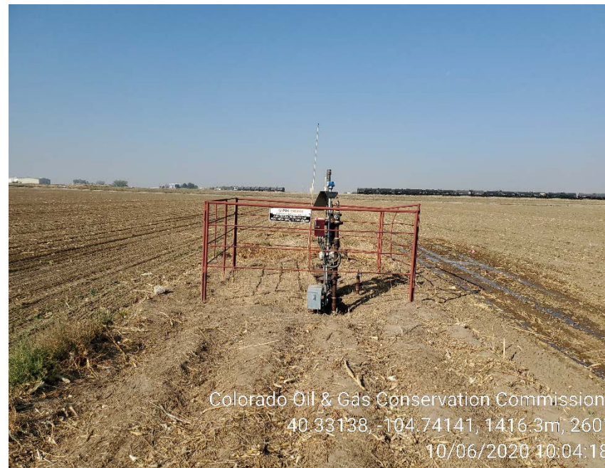
Weeds on 10/6/2020