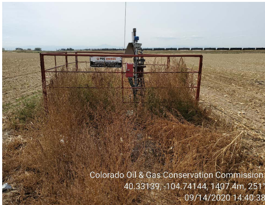
Weeds on 9/14/2020