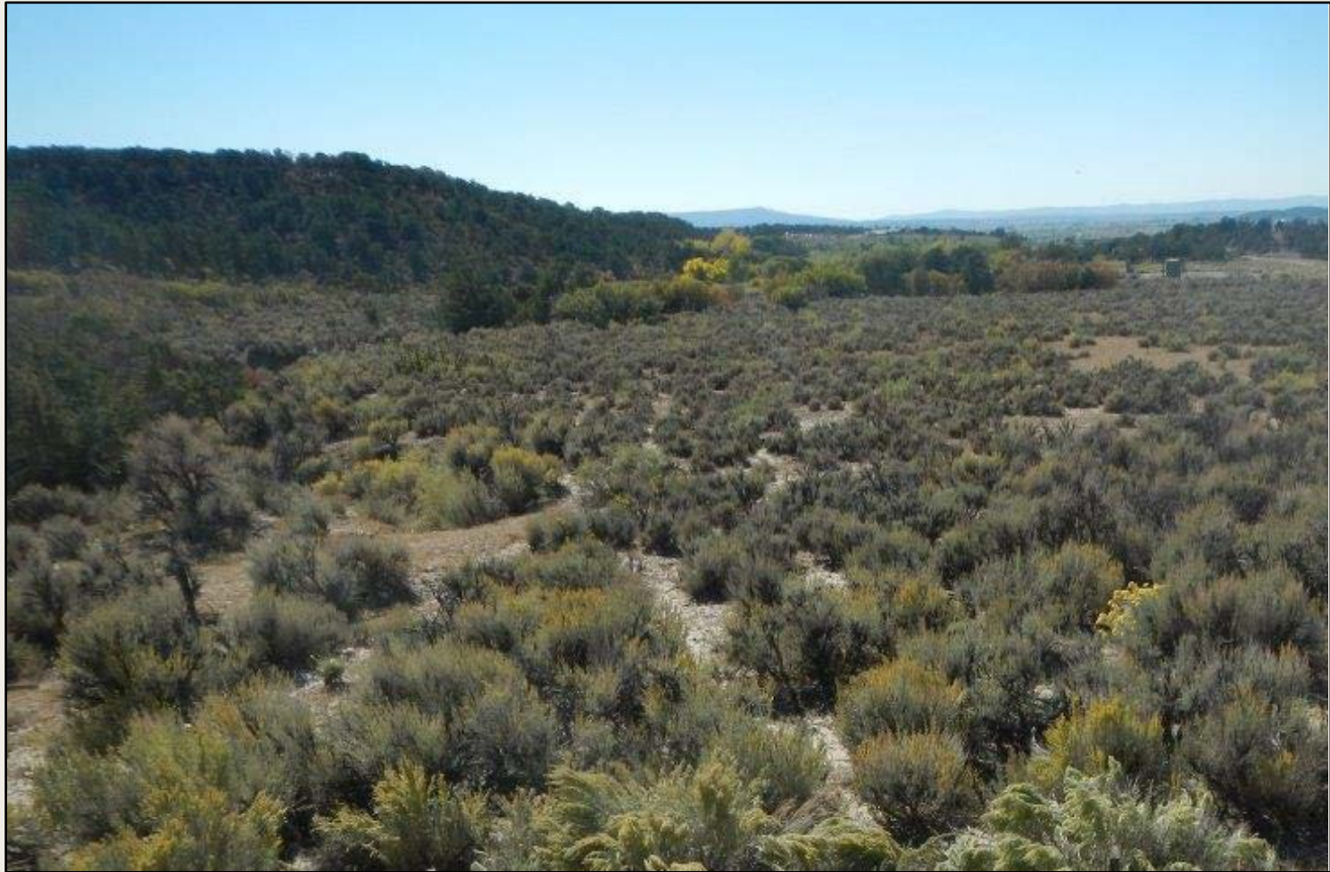
Photo 6. View of reference area vegetation comprised of sagebrush shrubland with grasses such as western wheatgrass and forbs such as