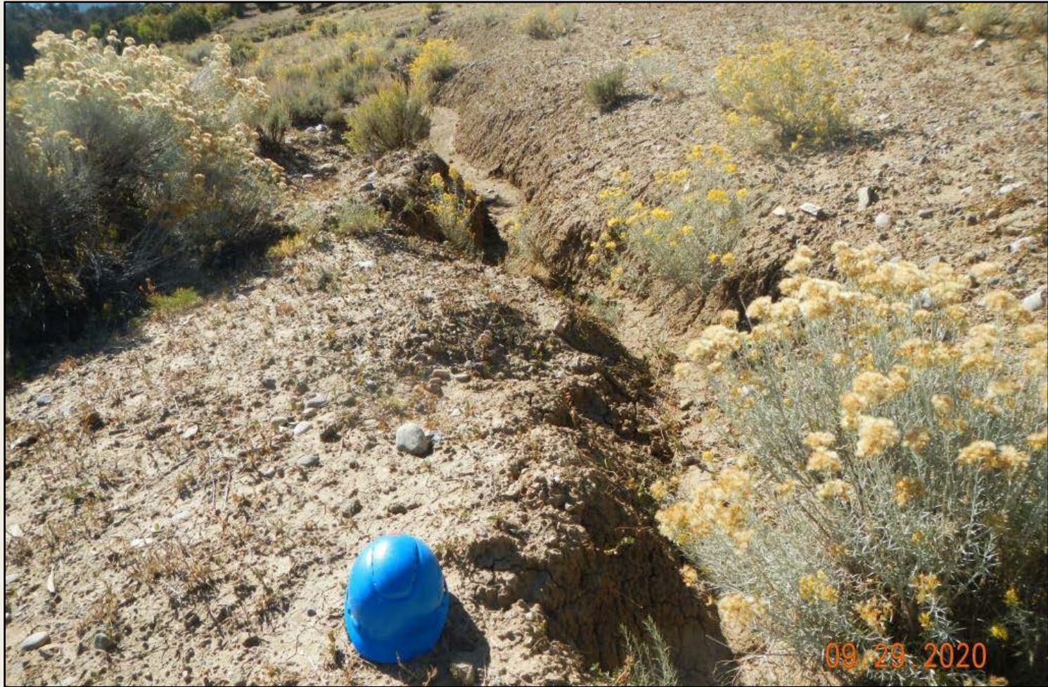
Photo 5. View of erosional channel approximately 2.5 feet wide and 3 feet deep at culvert outlet near well pad entrance. Erosional headcut is present here that needs to be stabilized.