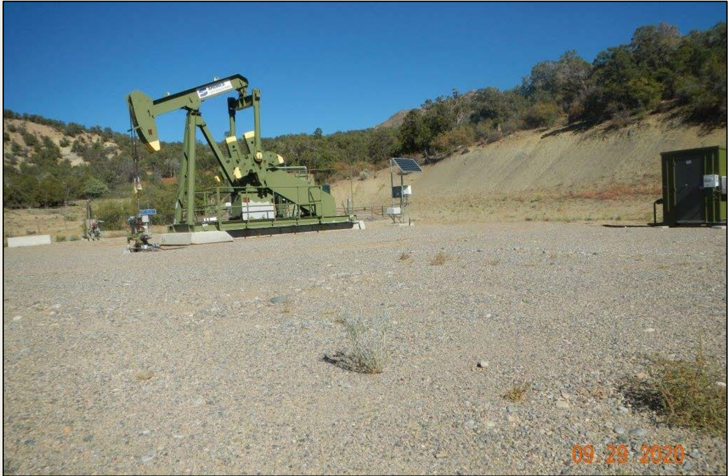
Photo 1. View of the project area from the western corner facing center.