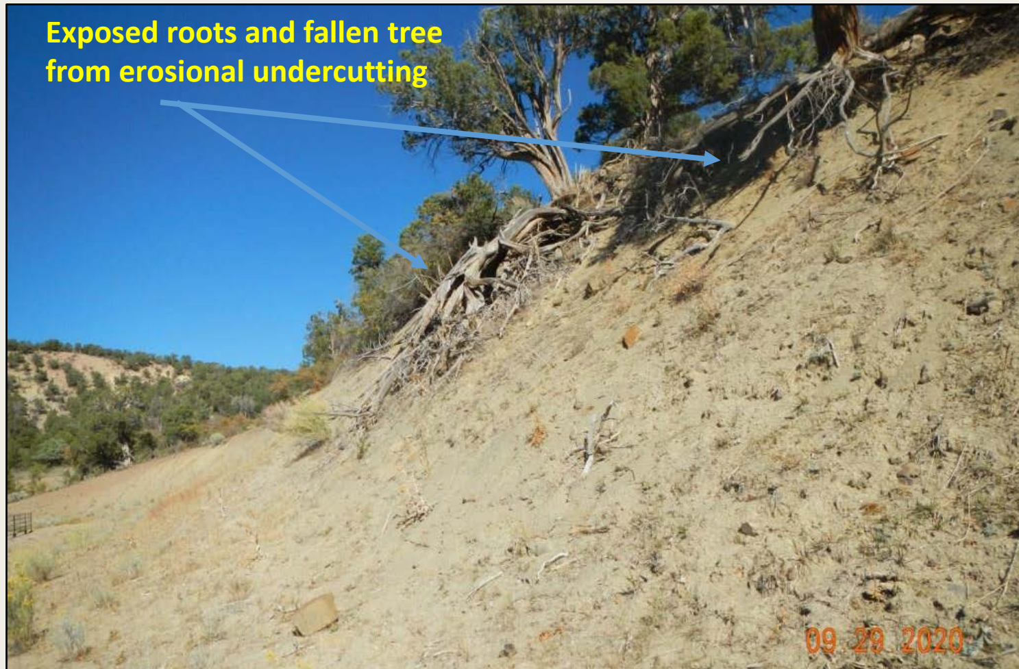
Photo 2. View of the eastern cut-slope facing northward. Undercutting of vegetation observed at the top of the slope.