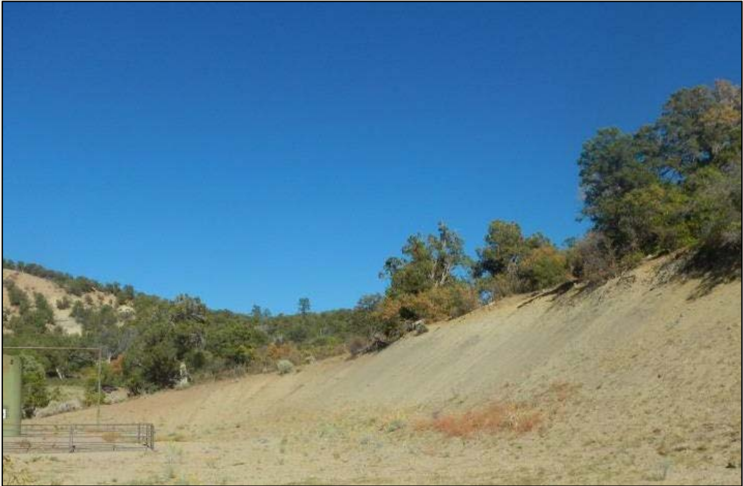
Photo 3. View of the northeastern portion of the well pad cut-slope showing bare soils with little desirable vegetation present.