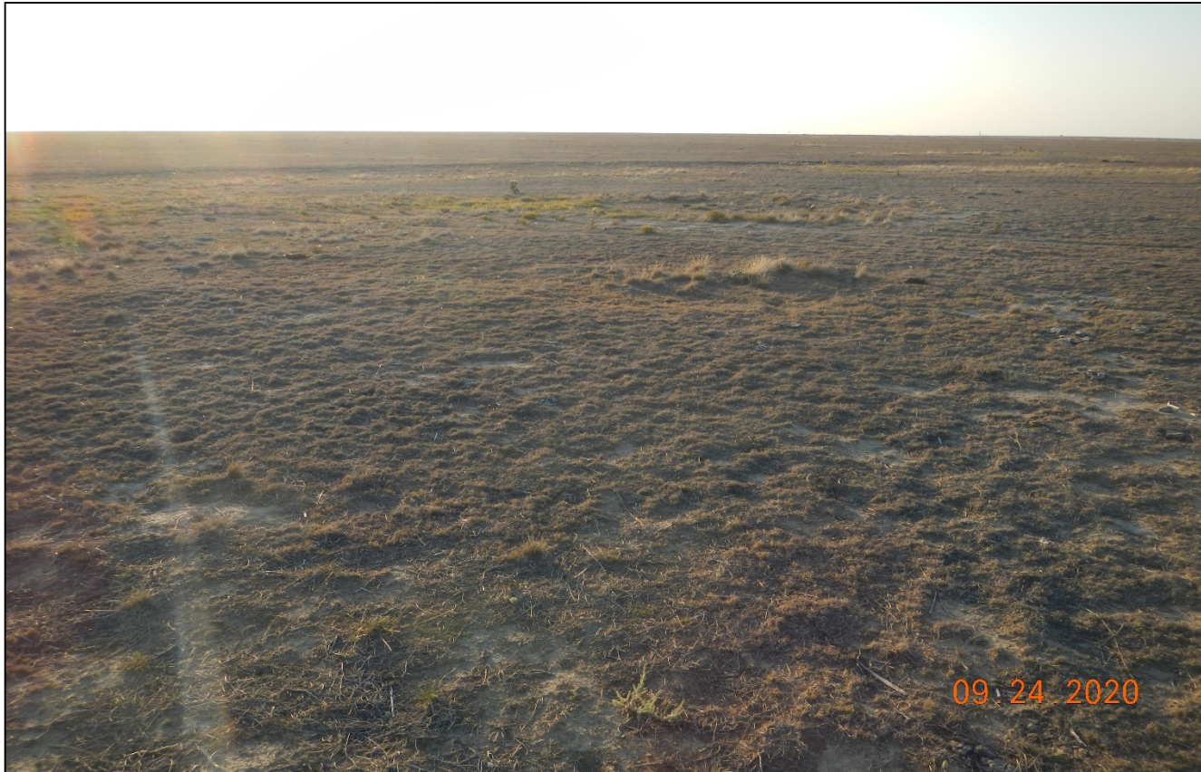
Photo 5. Facing east at the location.