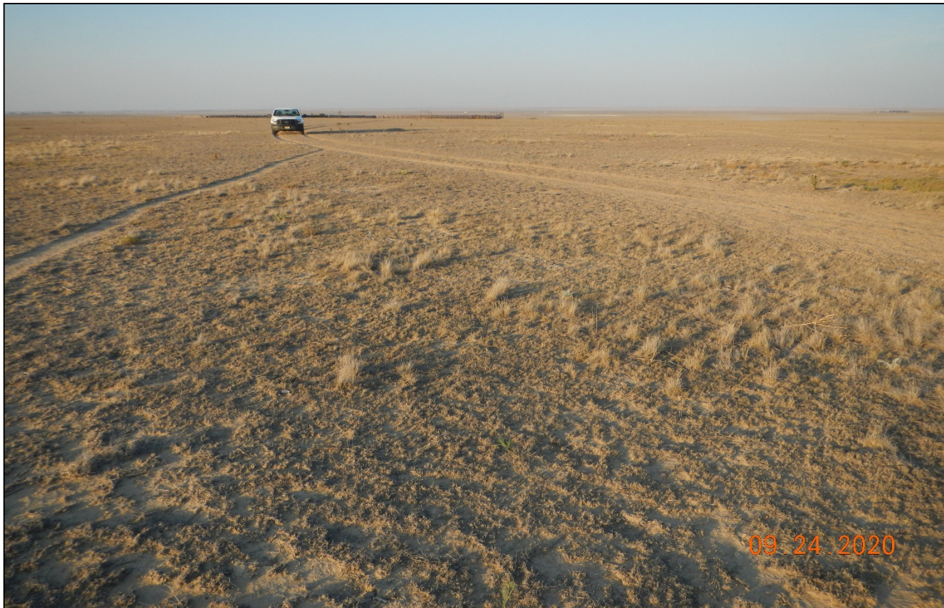
Photo 3. Facing southwest at the location.