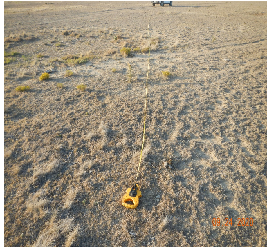
Photo 7. Facing southwest at the end of the vegetation transect performed at the location.