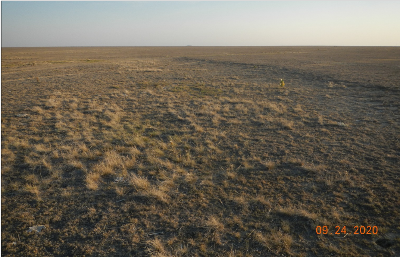
Photo 2. Facing northeast at the east side of the location. Vegetation has uniformly established throughout the location and reflects the surrounding Blue grama grassland.