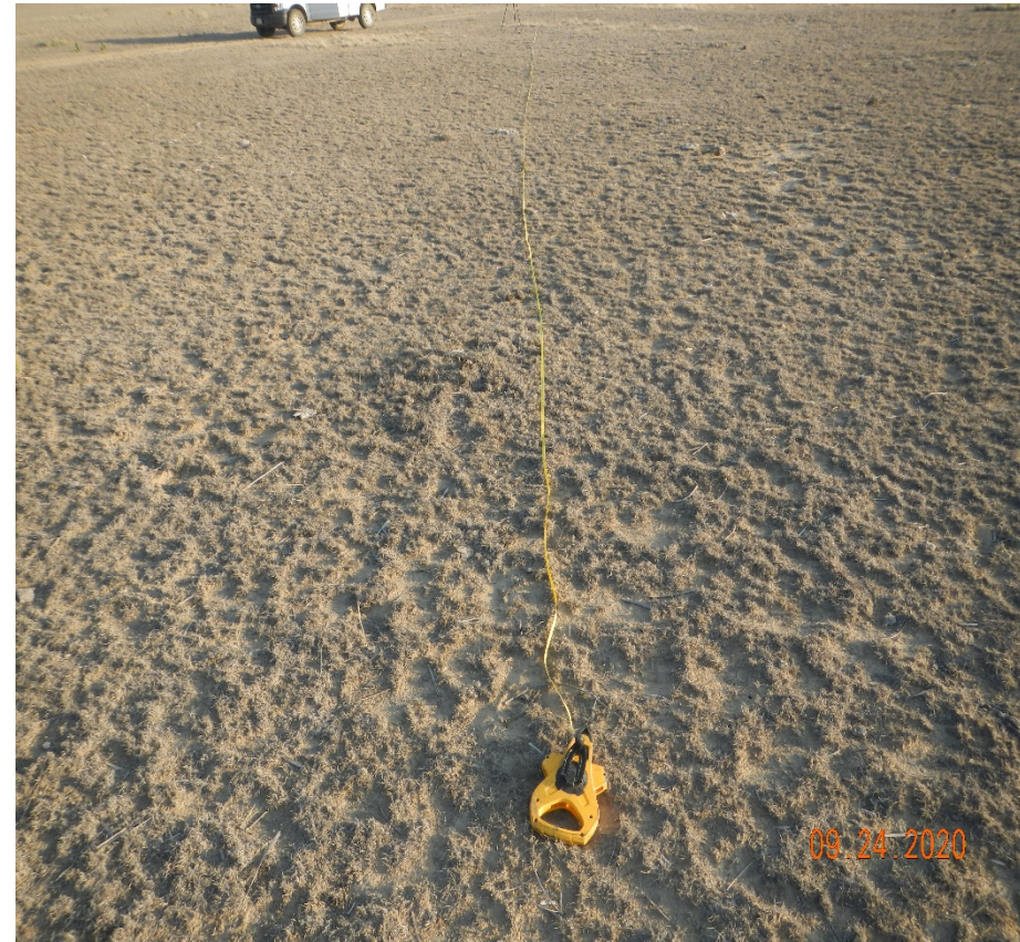
Photo 9. Facing north at the end of the vegetation transect performed at the reference area..