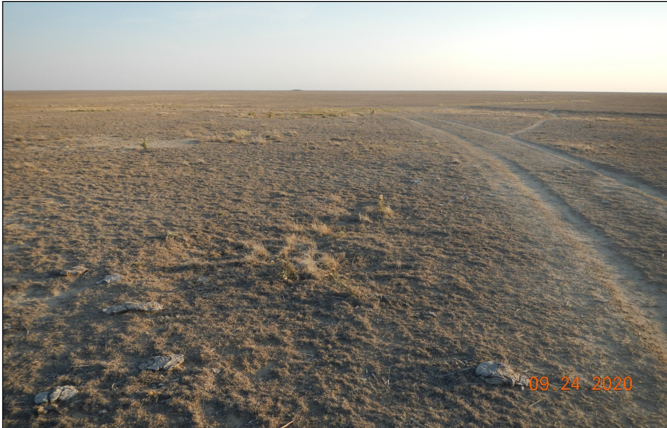
Photo 1. Facing northeast toward the location. A two track road continues through the location.