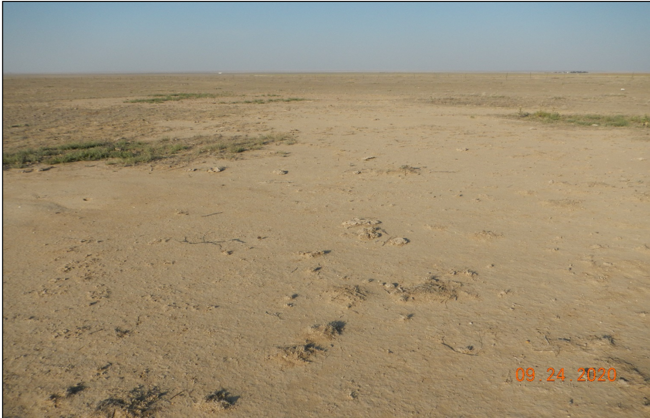
Photo 1. Facing west toward the location. Vegetation is not establishing and there are areas bare of vegetation which indicate soil potential soil issues.