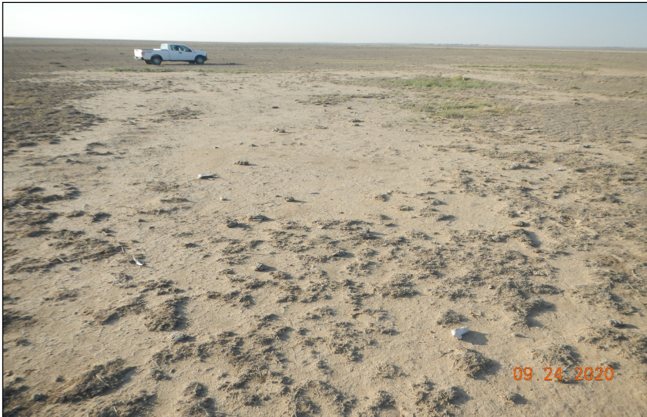
Photo 2. Facing south toward the location.