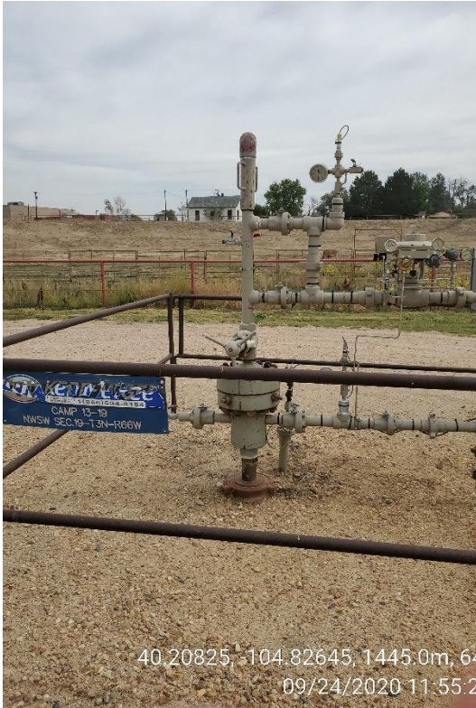
Photo 1 05-123-18488 CAMP 13-19A