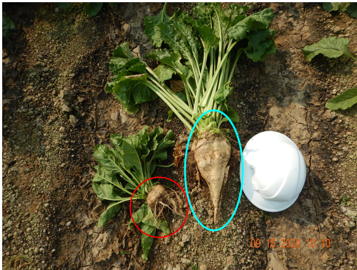
Photo 9. Photo taken of a sugar beet from the P&A area (red circle) and from the reference area (blue circle).