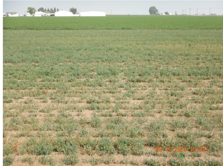
Photo 15. Photo taken from the northern interim reclamation area, facing North. See comments under Photo 14.