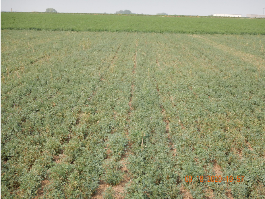
Photo 14. Photo taken from the western interim reclamation area, facing West. Photo illustrates crop growth within the interim area is not reflective of reference area crop growth.