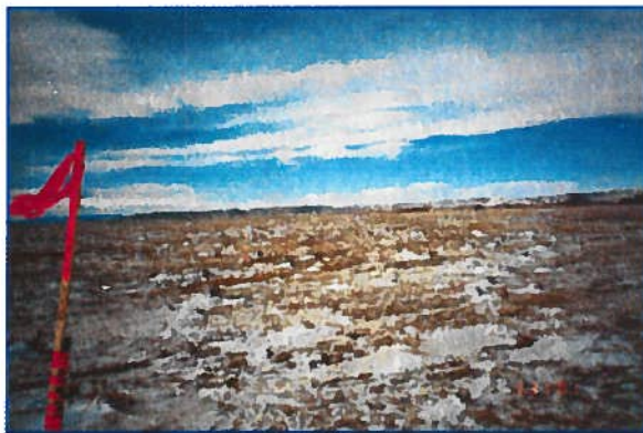
LOOKING WEST FROM WELL SITE