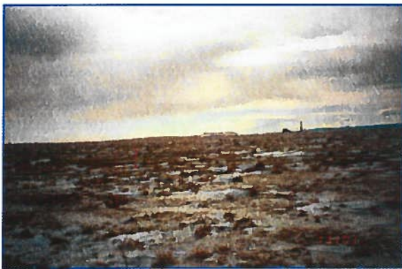
LOOKING SOUTH FROM WELL SITE TO PROPOSED ACCESS ROAD FOR PAD