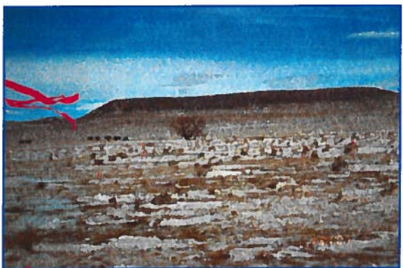
LOOKING NORTHEAST FROM WELL SITE