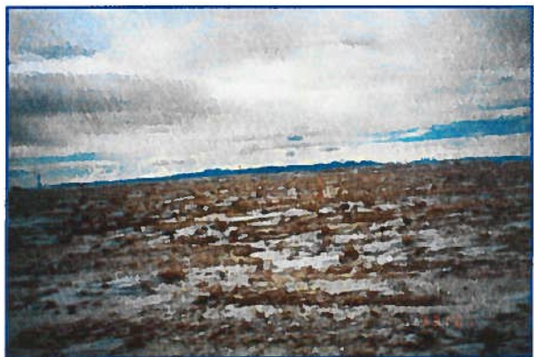
LOOKING SOUTHWEST FROM WELL SITE