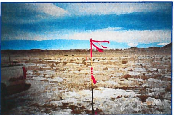
LOOKING NORTH FROM WELL SITE