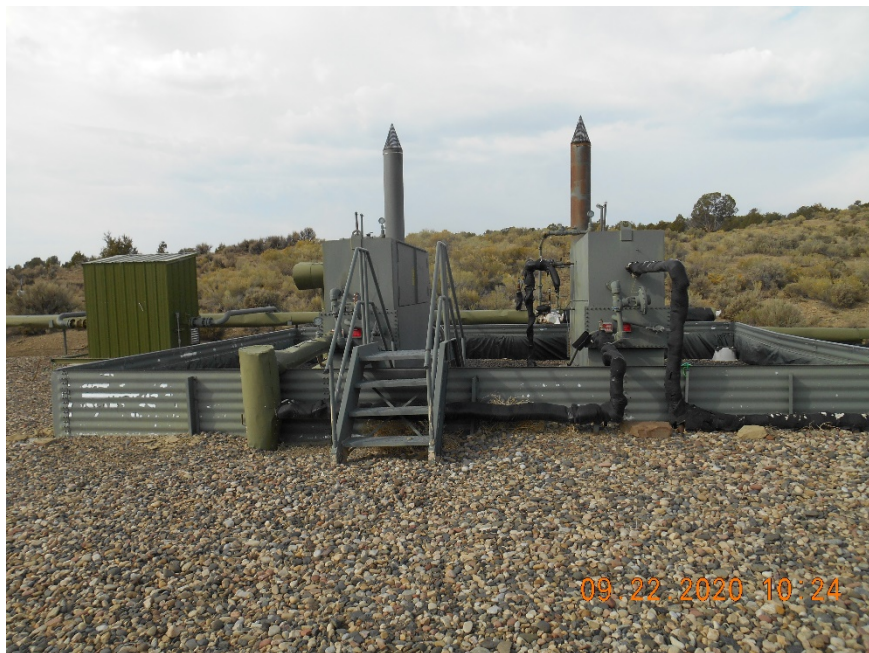
Separator & Meter housing