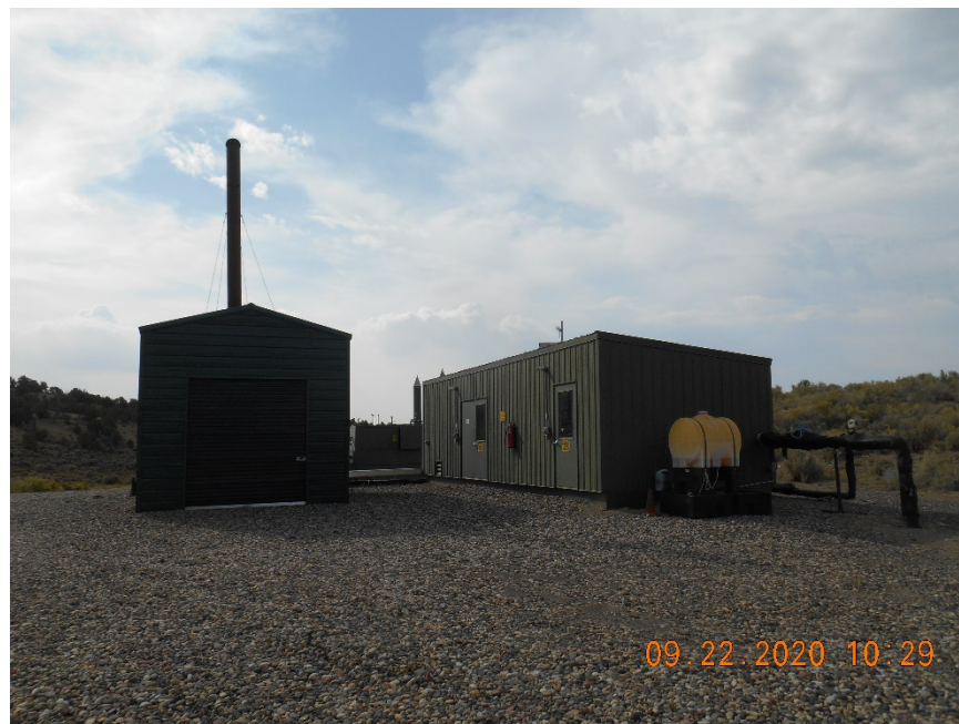
Generator housing and pump housing