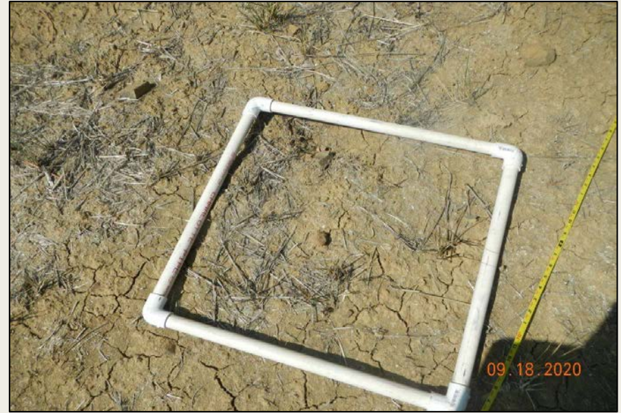
Photos 5/6. Birdseye view of typical germination quadrats along the transect. Young grasses such as western wheatgrass are becoming established here.