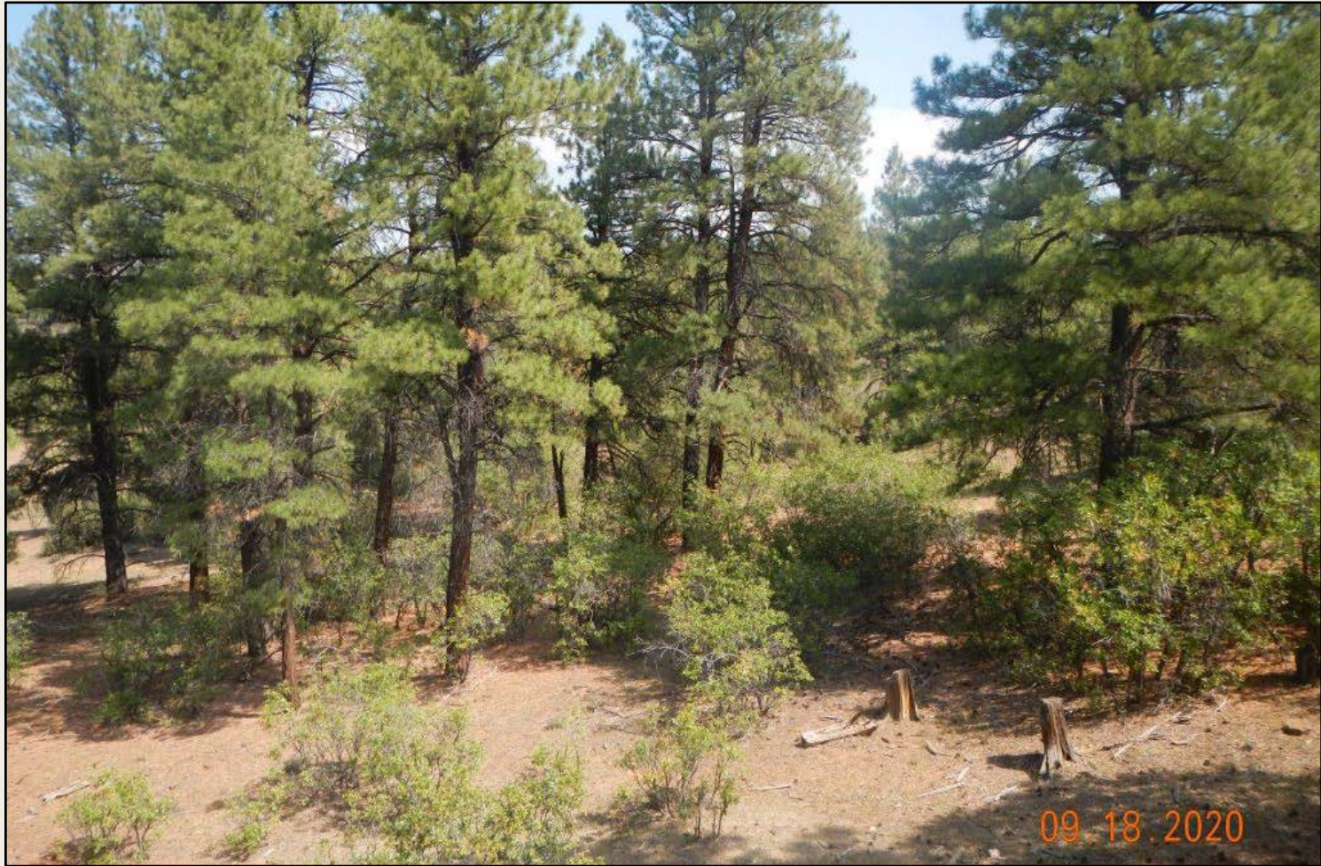
Photo 9. View of reference area vegetation comprised of ponderosa pine woodland with understory of gambel oak, western wheatgrass, and antelope bitterbrush.