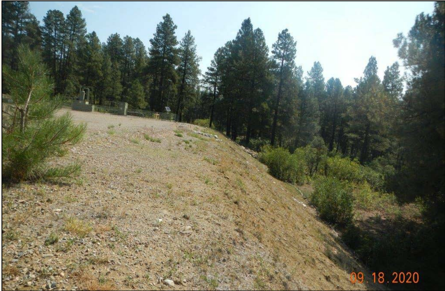
Photo 2. View of the southern project area from the southwestern corner facing eastward. Revegetation is progressing with grasses such as western wheatgrass and smooth brome.