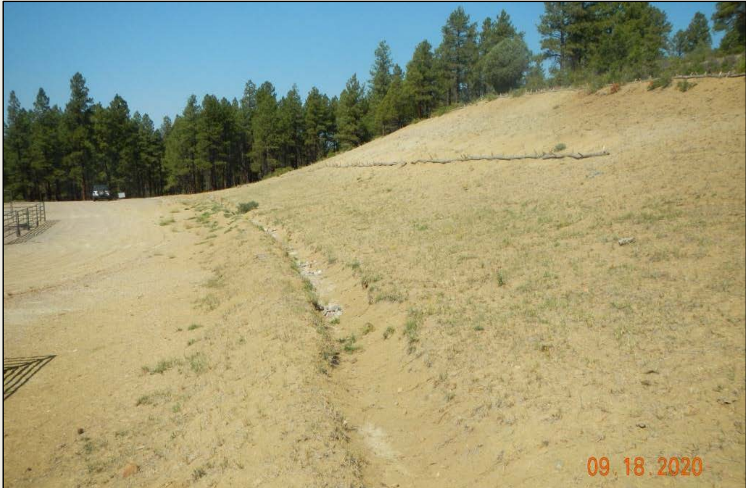
Photo 3. View of the northern project area from the northeastern corner facing westward.