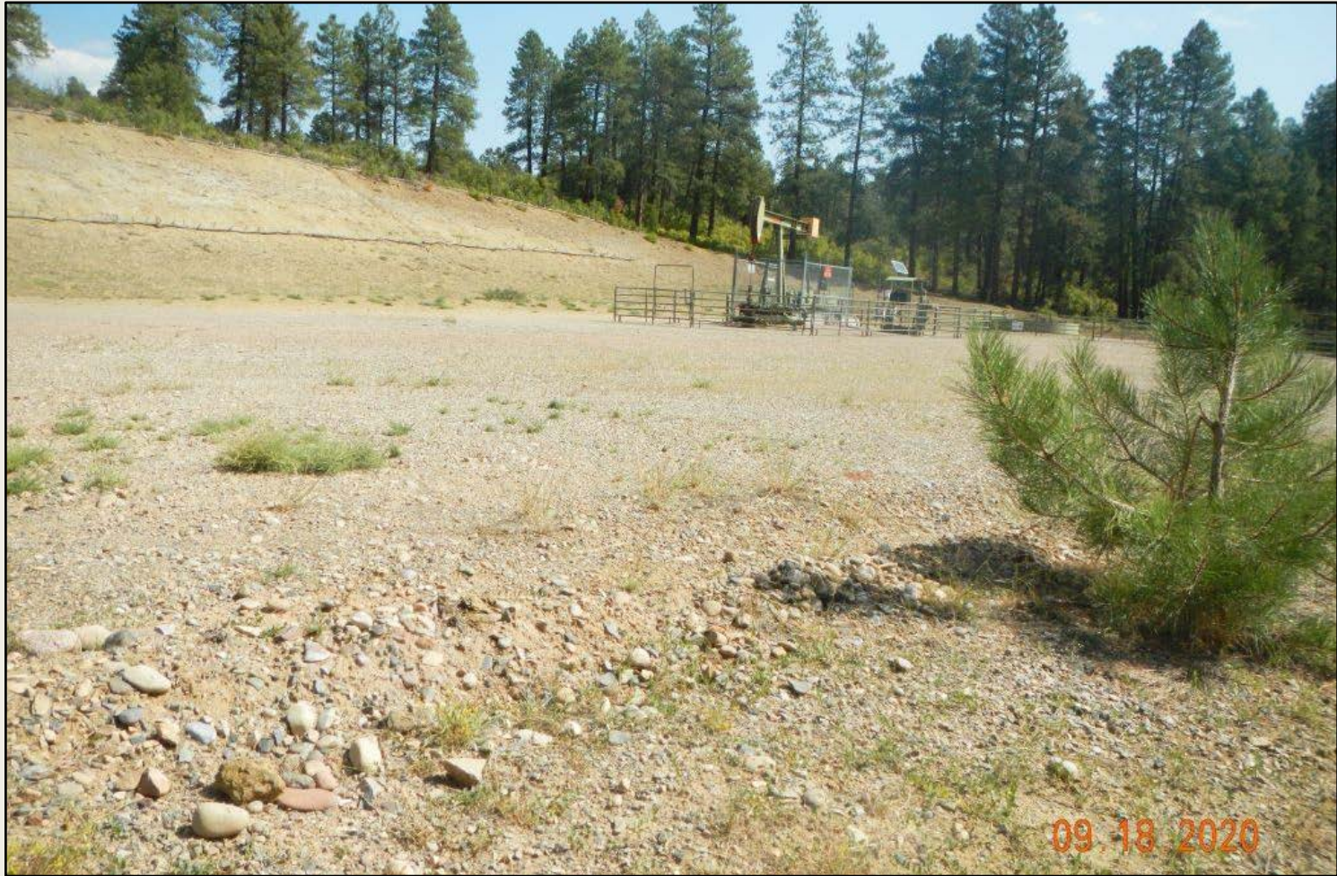
Photo 1. View of the project area from the southwestern corner facing center.