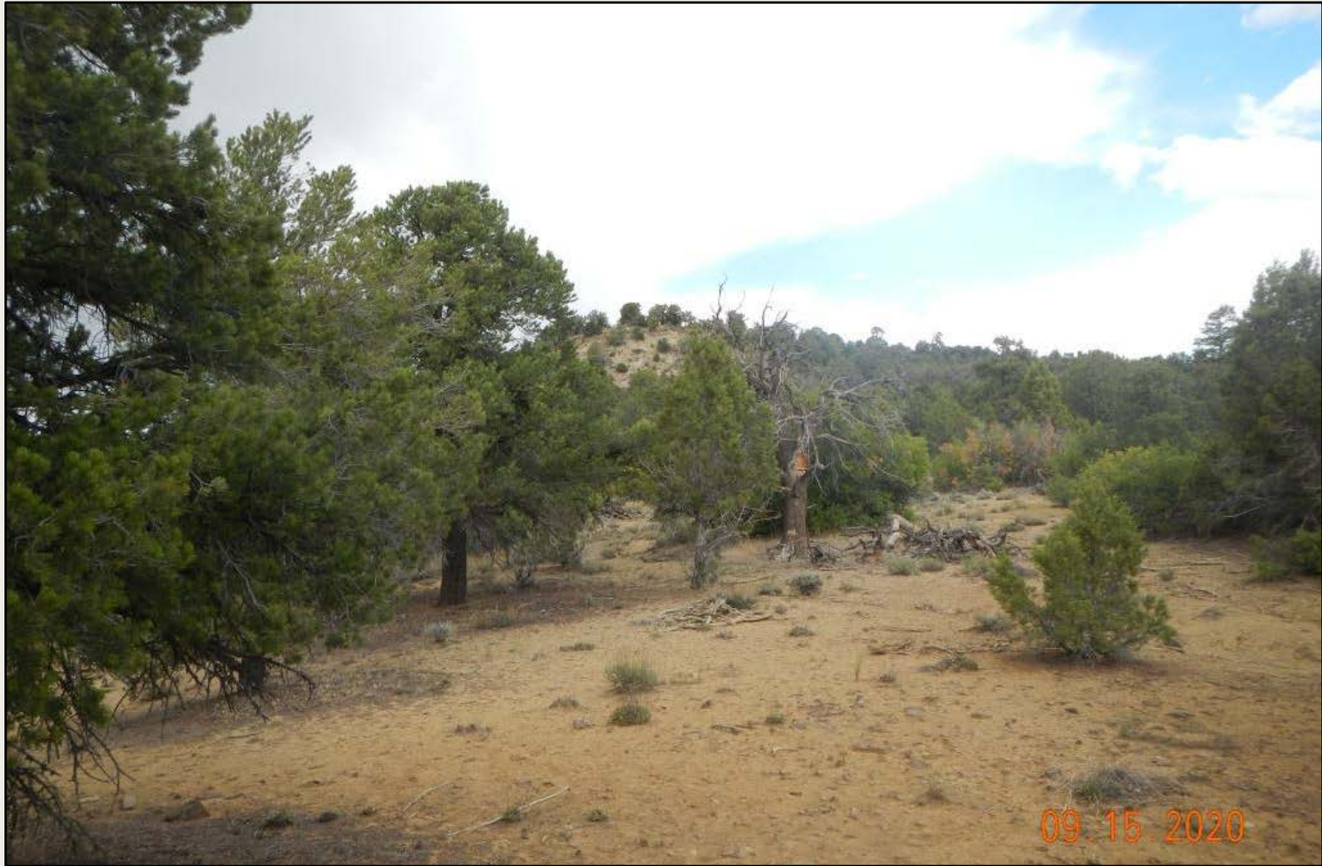
Photo 5. View of reference area vegetation comprised of pinyon and juniper woodland with shrubs and forbs in the understory such as big sagebrush, gambel oak, buckwheat, and Indian ricegrass.