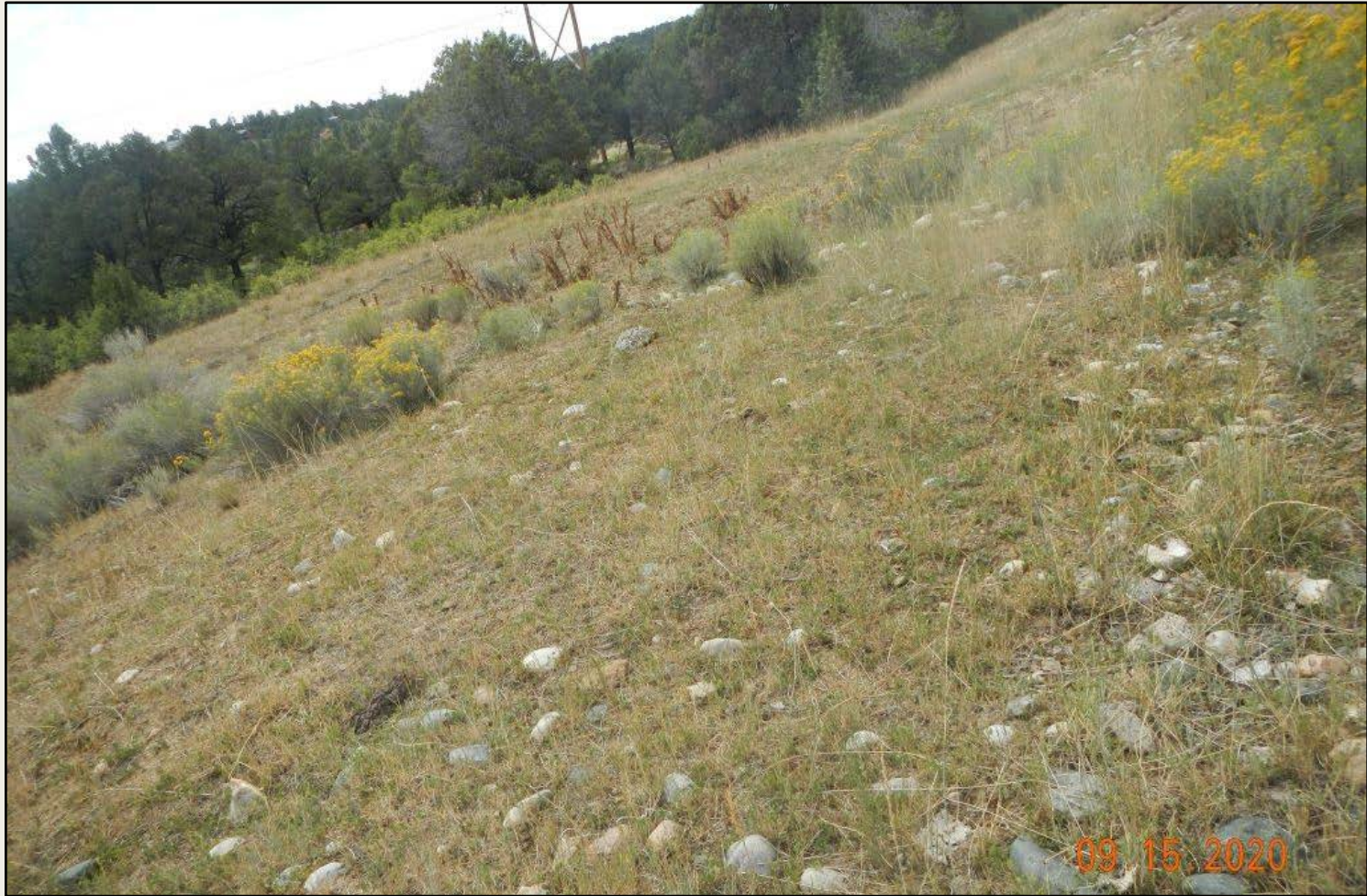
Photo 2. View of the southern fill slope from the southeastern corner facing westward. Revegetation is progressing within the interim reclamation area, largely with grasses such as western wheatgrass, smooth brome, and sand dropseed.