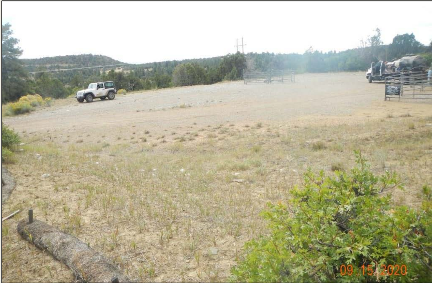
Photo 1. View of the project area from the northeastern corner facing center.