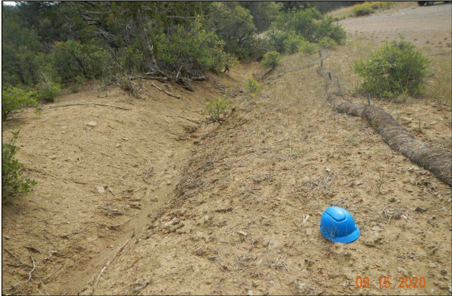
Photo 4. View of eastern stormwater diversion. Stormwater controls need to be installed to de-energize stormwater flowing through the channel and over the banks. Channel is eroding in width and depth (approx. 5-6 ft wide and 4-5 feet deep).