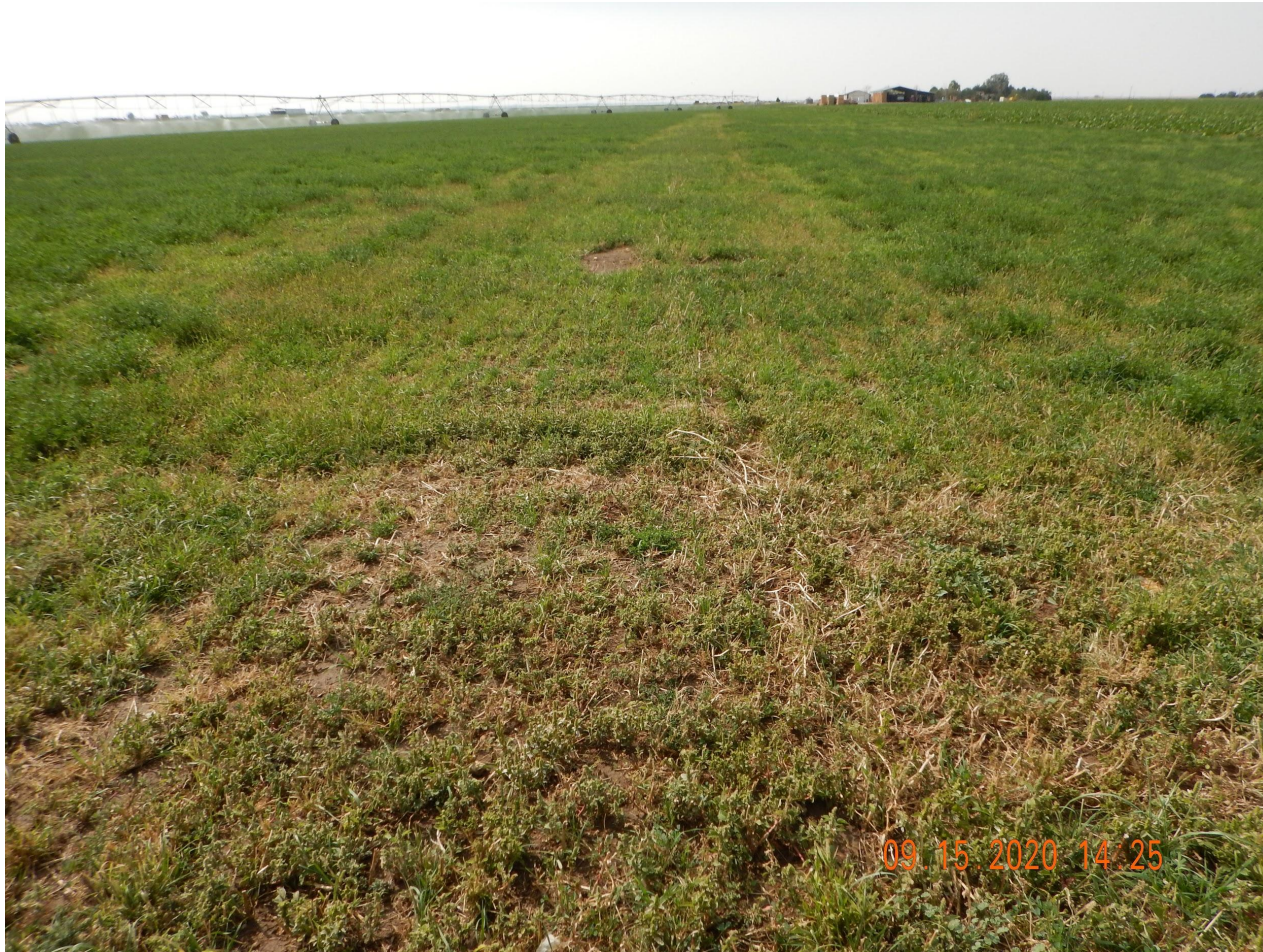
Photo 2. Photo taken from the eastern access road, facing West. Photo illustrates Operator has performed final reclamation activities. However, crop establishment is not reflective of reference areas and will remain in-process.