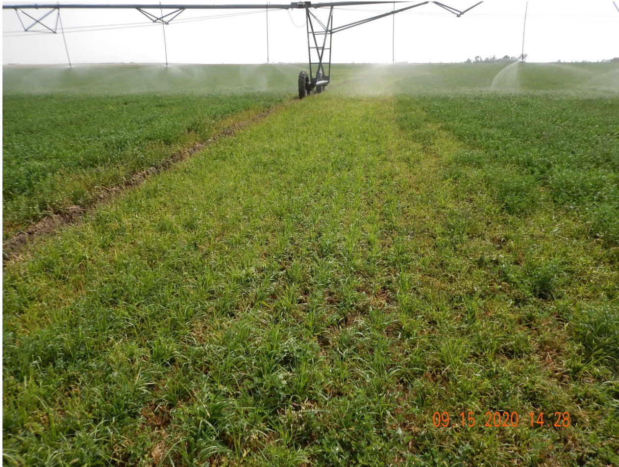
Photo 4. Photo taken from the western access road, facing South. See comments under Photo 2.

Inspection Photos Location Name: STATE #36-1 Location ID: 317487