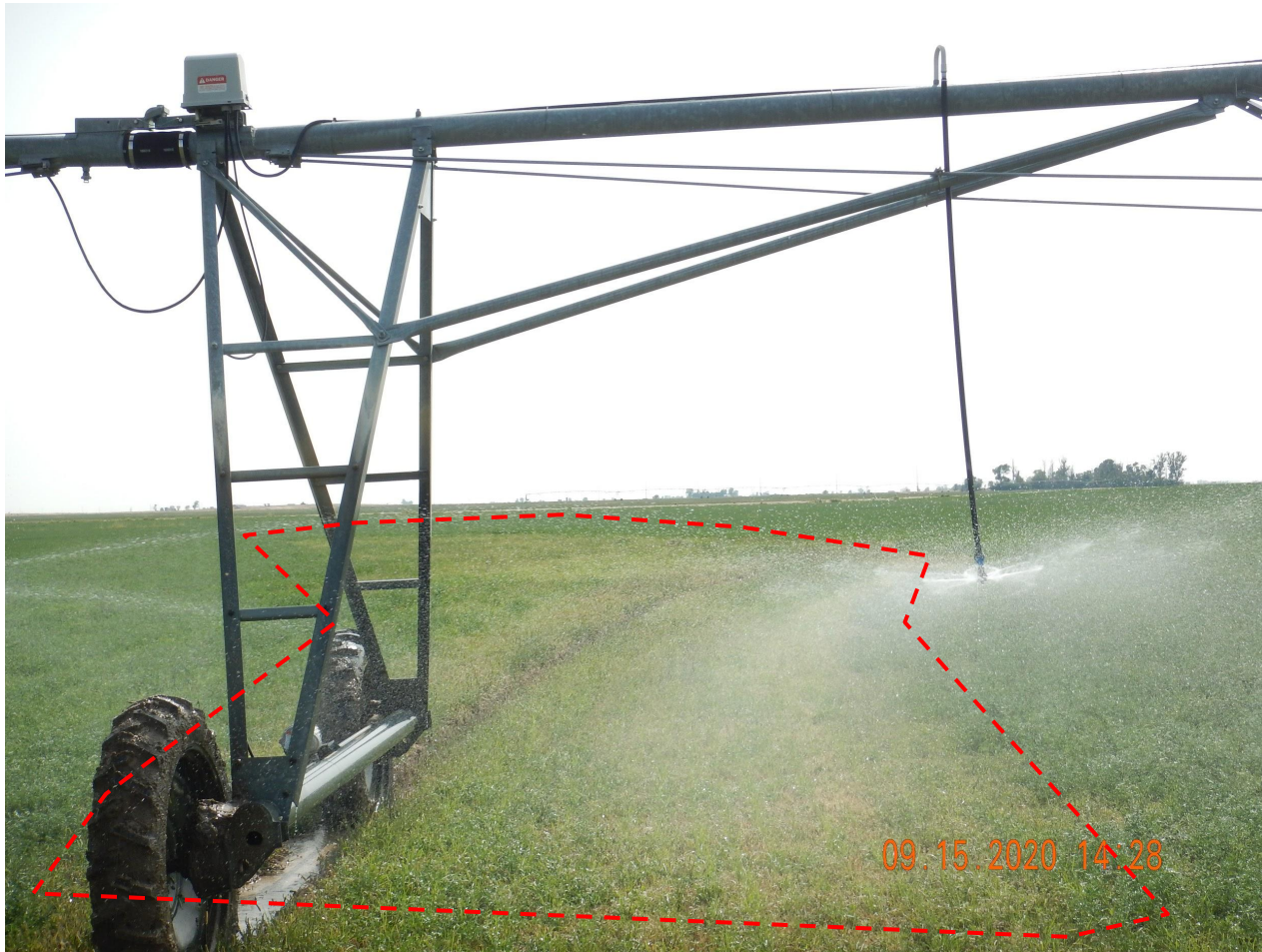
Photo 5. Photo taken from the western access road, facing South. Photo illustrates Operator has removed all equipment.