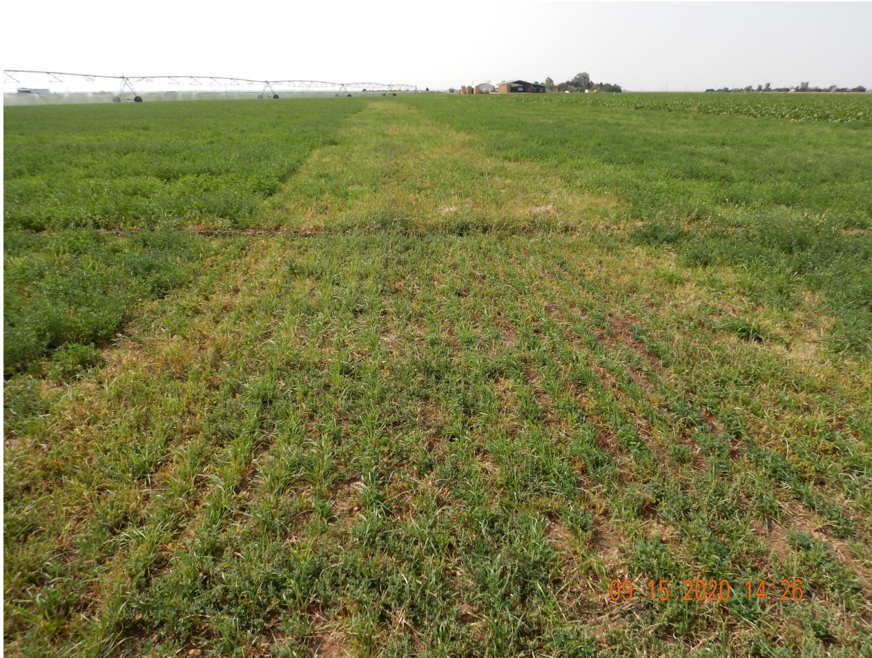
Photo 3. Photo taken from the central access road, facing West. See comments under Photo 2.