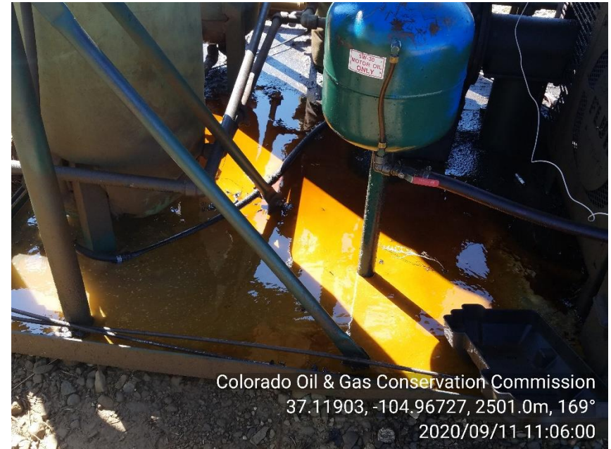
PHOTO 4: OIL WATER MIXTURE IN COMPRESSOR SKID. Comply with general provisions of the oil and gas act for wildlife protection. CA DATE 9-23-20.