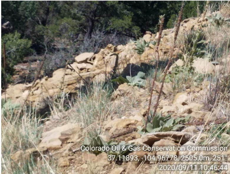
PHOTO 9: CLASS C NOXIOUS WEEDS ON AROUND LOCATION INCLUDING THE INTERIM RECLAMATION AREA. COMPLY WITH RULE 1003.f. CA DATE 9-23-20.