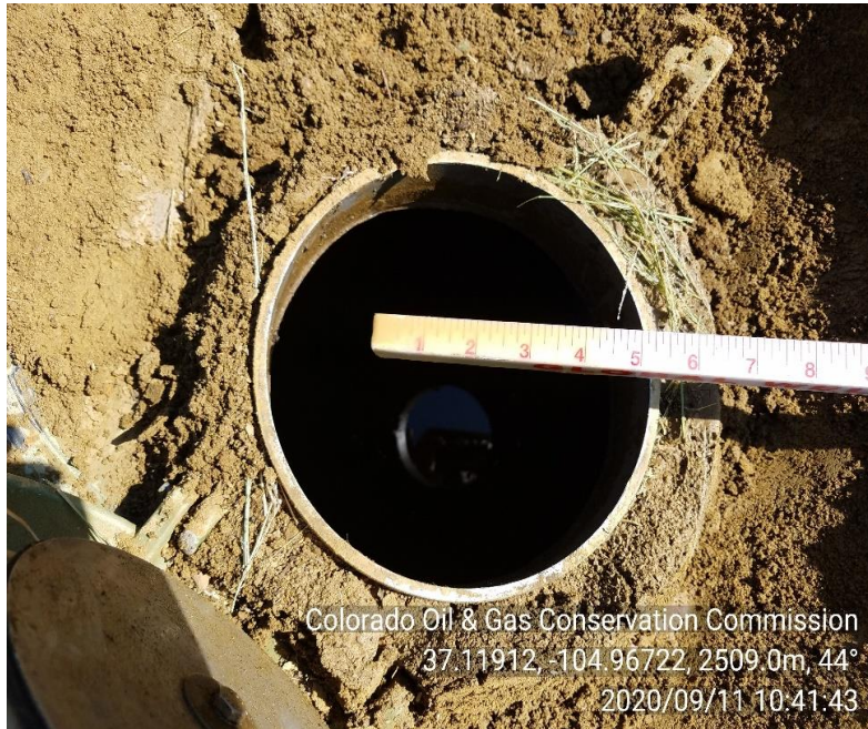
PHOTO 3: APPEARS TO BE OIL IN PRODUCED WATER TANK. Pursuant to Rule 907A. Operator shall properly identify and dispose of non-E&P. Wastes in accordance with state and federal regulations, including storing, treating, and disposing of hazardous waste in accordance with 6 C.C.R. 1007-3. All non-hazardous/non-E&P wastes are considered solid waste which require storage, treatment, and disposal in accordance with 6 C.C.R. 1007-2. Rule 907.b.(2) - provide all transportation and disposal documentation required by Rule 907.b.(2)