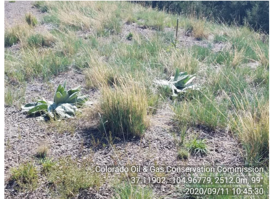
PHOTO 8: CLASS C NOXIOUS WEEDS ON AROUND LOCATION INCLUDING THE INTERIM RECLAMATION AREA. COMPLY WITH RULE 1003.f. CA DATE 9-23-20.