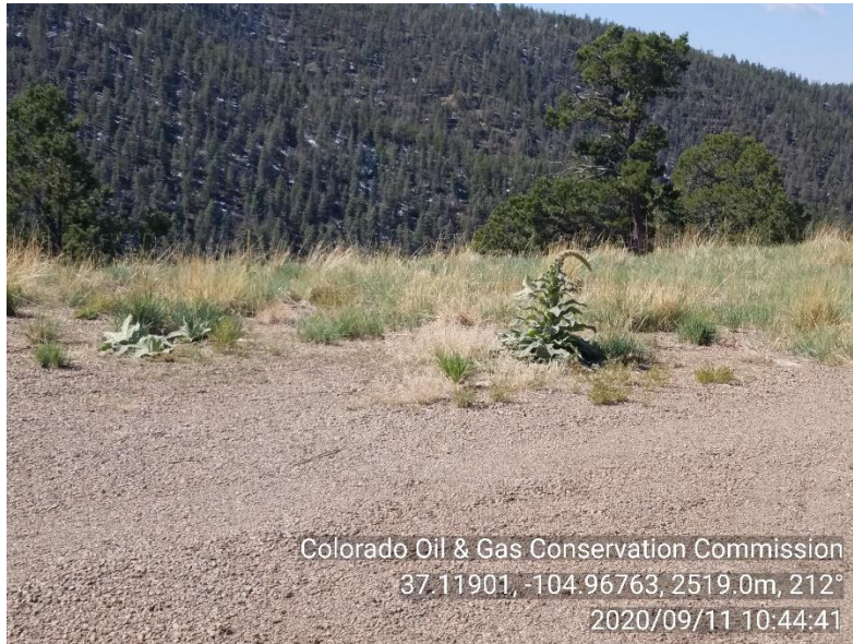
PHOTO 7: CLASS C NOXIOUS WEEDS ON AROUND LOCATION INCLUDING THE INTERIM RECLAMATION AREA. COMPLY WITH RULE 1003.f. CA DATE 9-23-20.