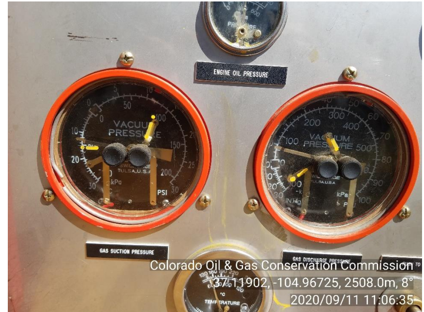
PHOTO 10: WELL IS BEING PRODUCED ON A VACUUM. FORM 4 SUNDRY APPROVED 6-8-06