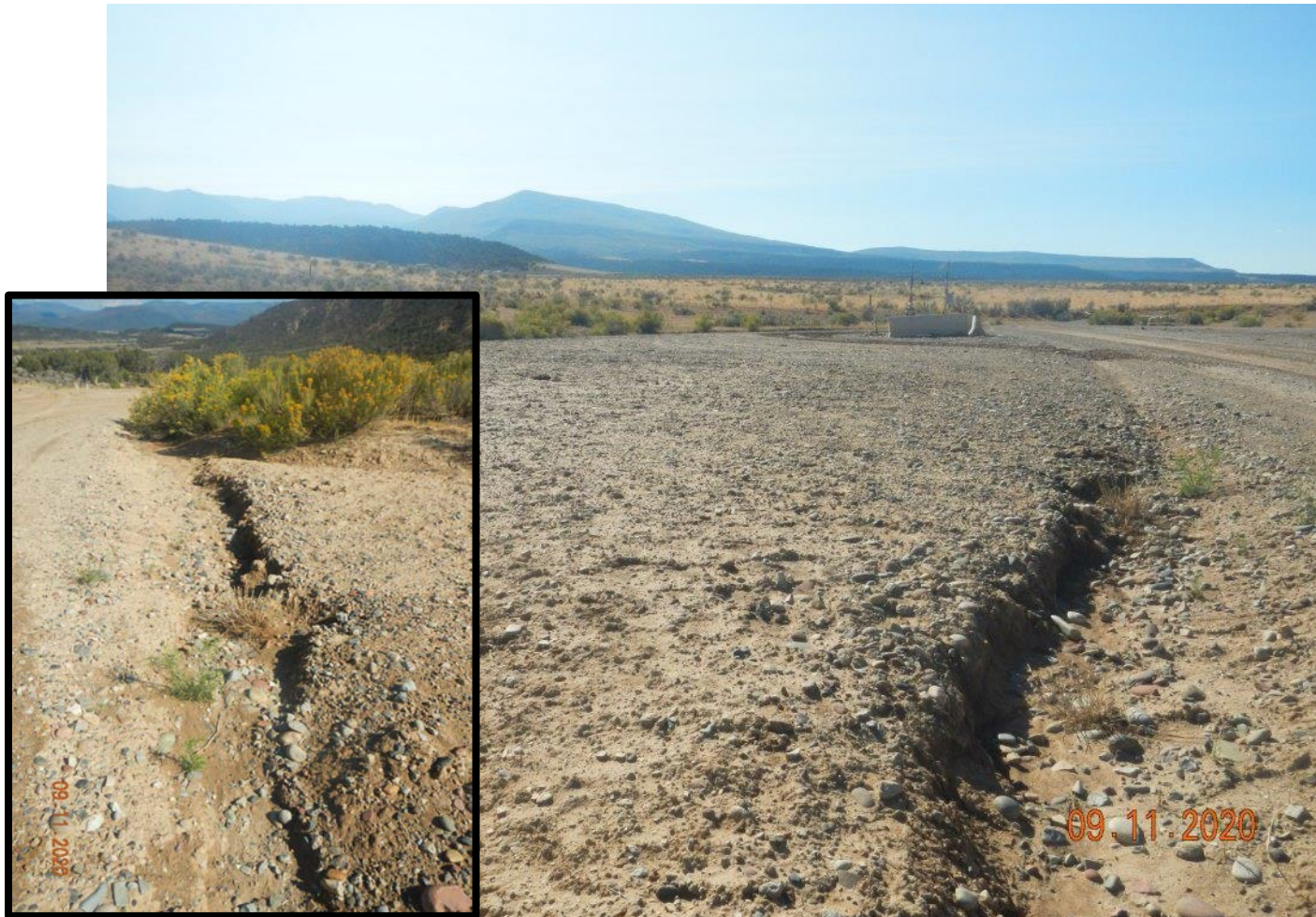
Photo#1: Overview of area (approx. .25 acre) on South side of pad Location that has not been stabilized.