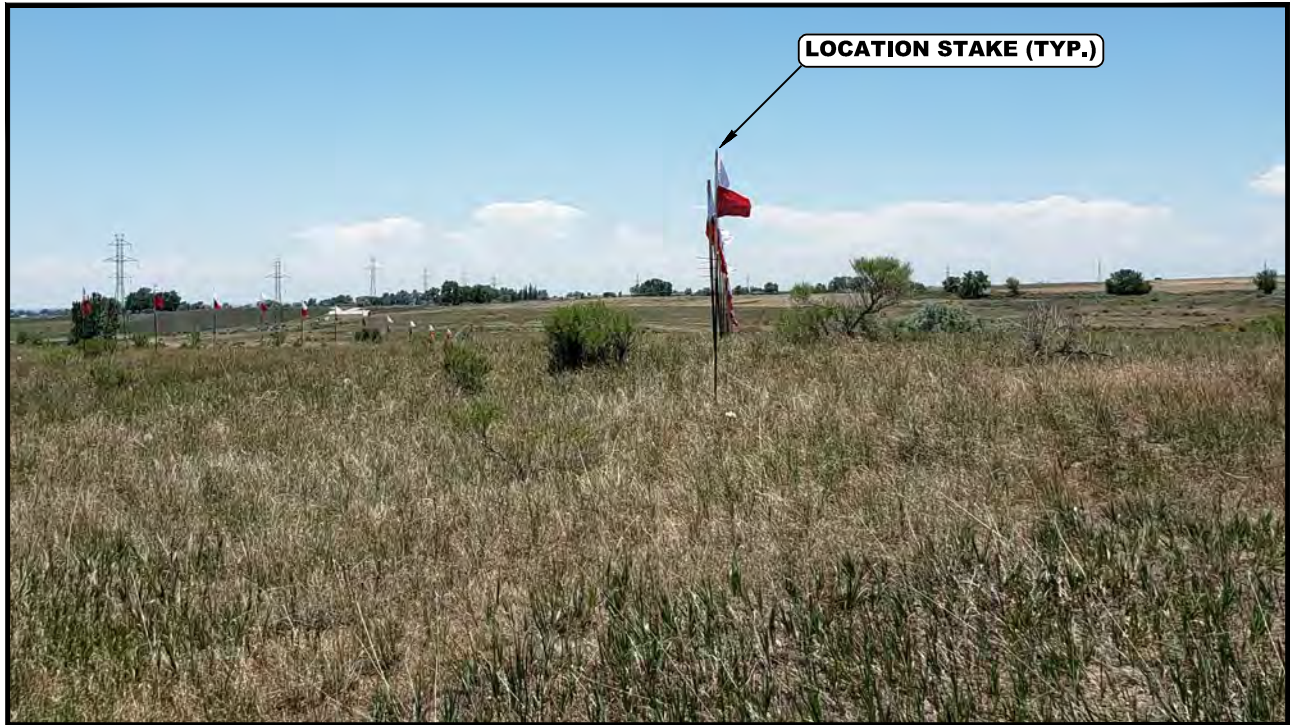
PHOTO: VIEW OF LOCATION STAKES