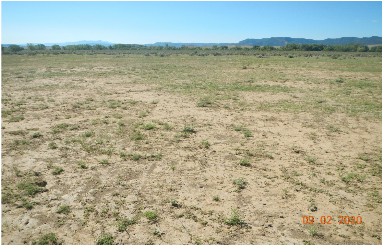
Photo 4. Facing south. The photo shows sparse vegetation. It appears reseeding has occurred.