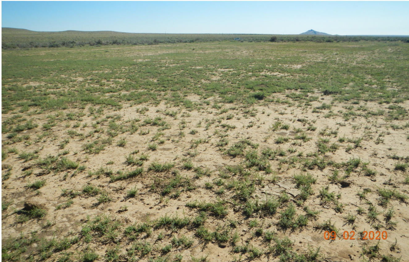
Photo 6. Facing east at the location. Much of the dark green vegetation is Kochia which is an undesirable weedy specie.