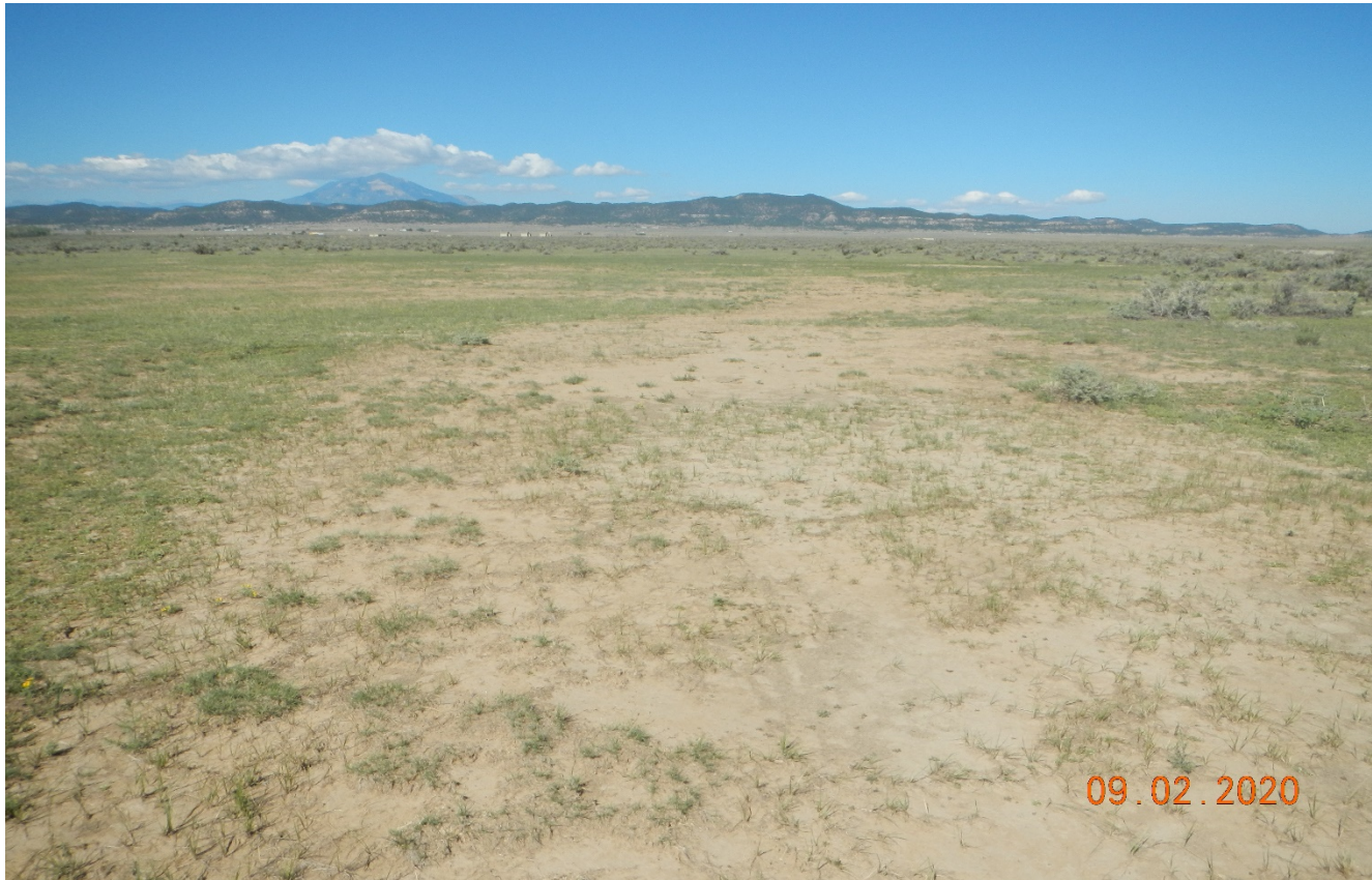
Photo 3. Facing west toward the location.