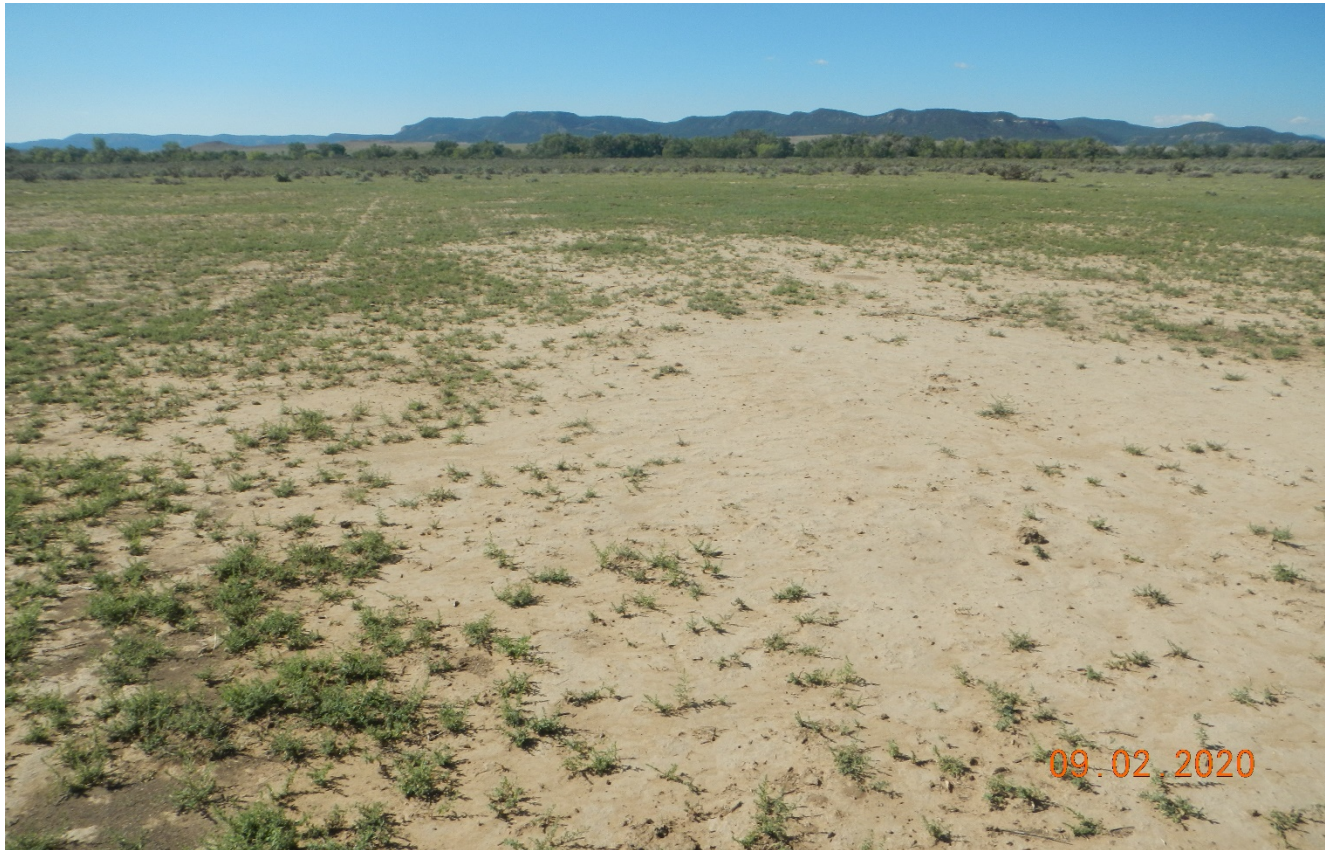
Photo 5. Facing southwest at the western portion of the location. There are areas bare of vegetation which appear to have been reseeded.