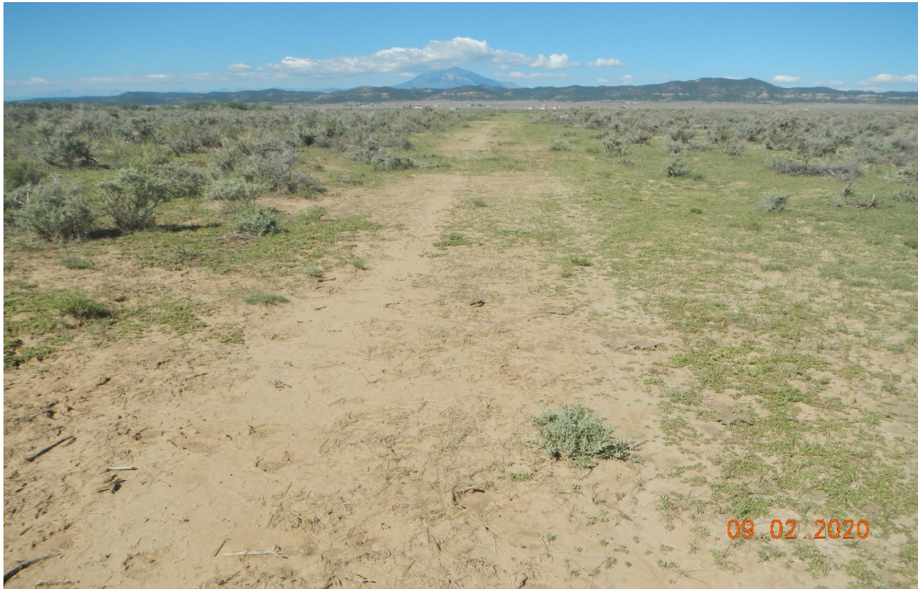
Photo 2. Facing west along the former access road.