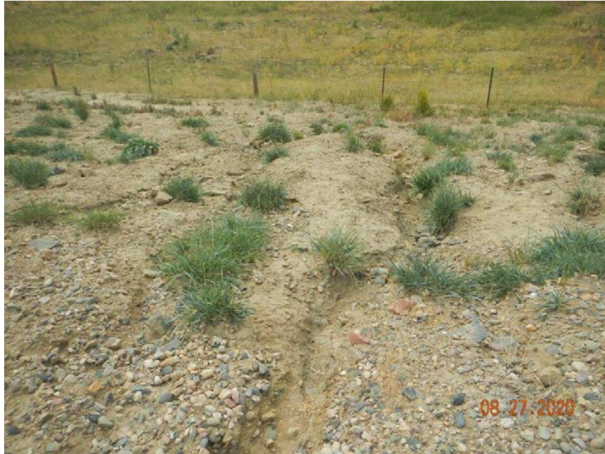
Photo#4: Eroding Fill slope of lease road on West side of Location.