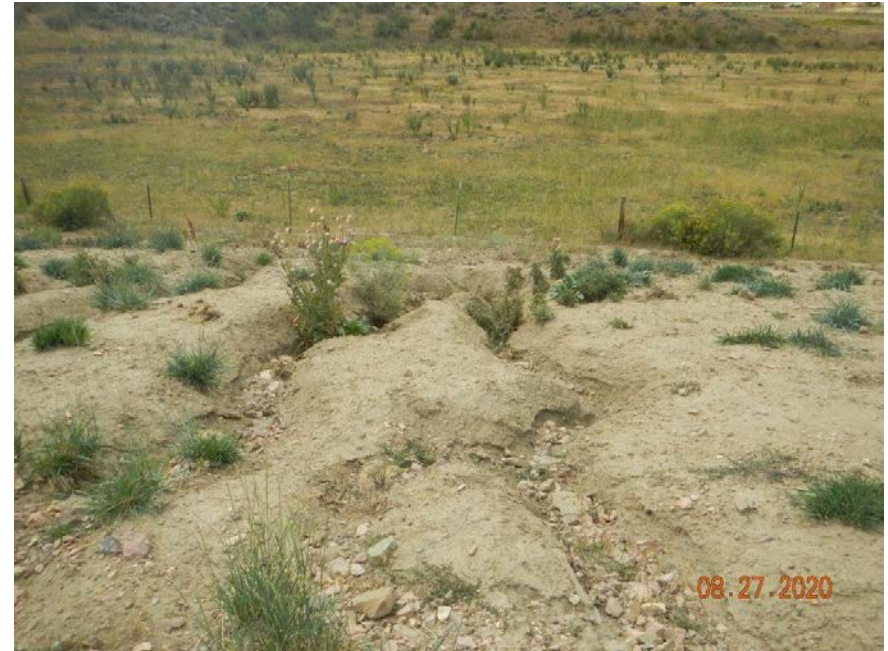
Photo#5: Eroding Fill slope of lease road on West side of Location