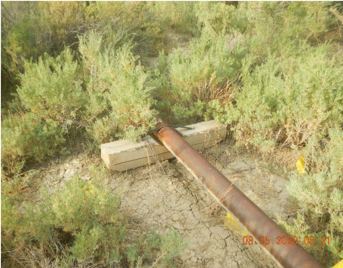
Photo #6 existing flowline. Was this flowline abandon per surface owner?

Inspection Photos Spill ID 463345 Remediation Project 12865 Inspection Date: 8/26/2020