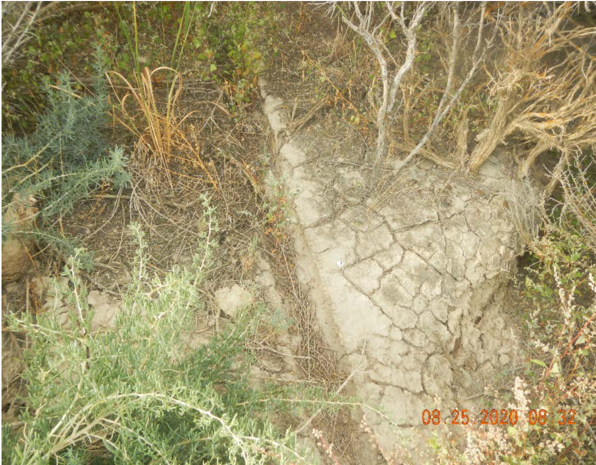
Photo #7 photo not in spill path. Appears that a flowline was removed.

Inspection Photos Spill ID 463345 Remediation Project 12865 Inspection Date: 8/26/2020