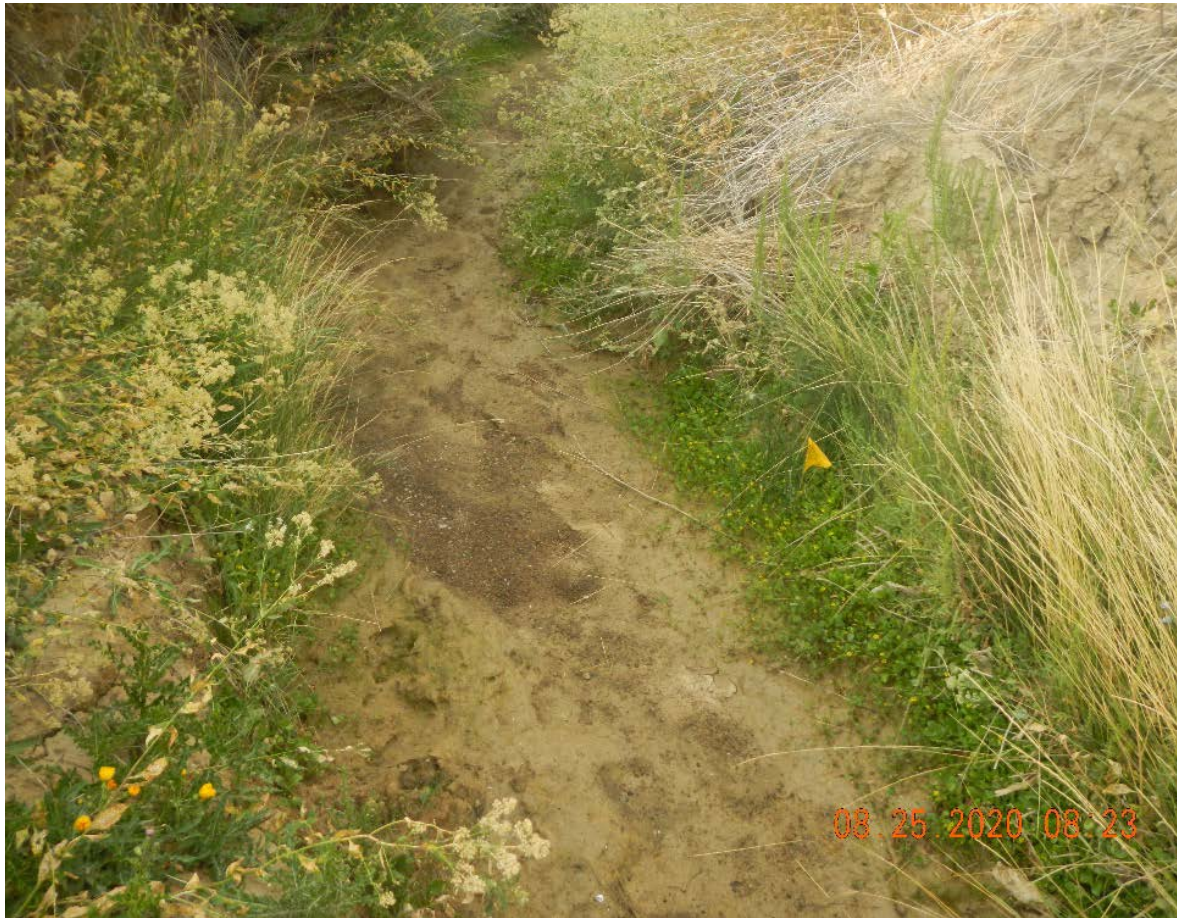
Photo #3 Close up of spill path in vermilion creek. No hydrocarbon or obvious impact was observed.

Inspection Photos Spill ID 463345 Remediation Project 12865 Inspection Date: 8/26/2020