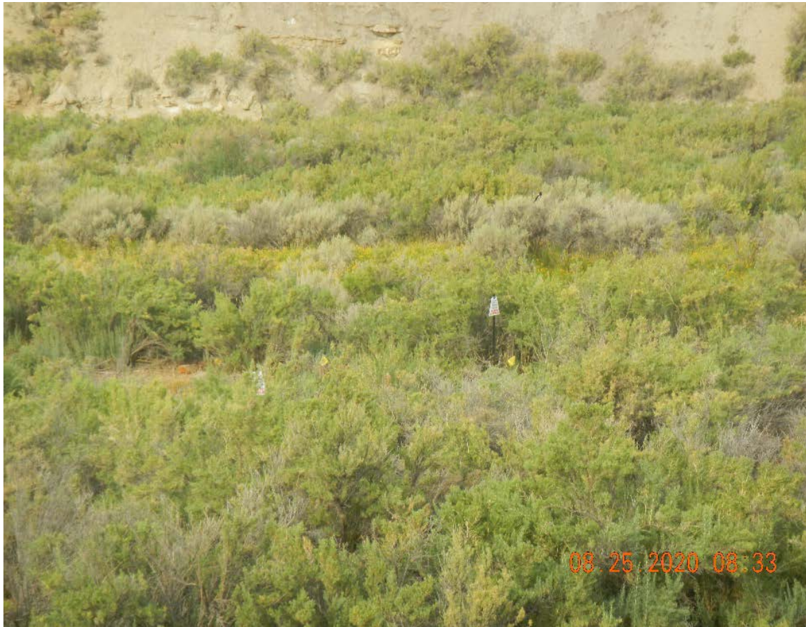
Photo #8 Flowline markers southwest of the impacted part of the creek.

Inspection Photos Spill ID 463345 Remediation Project 12865 Inspection Date: 8/26/2020