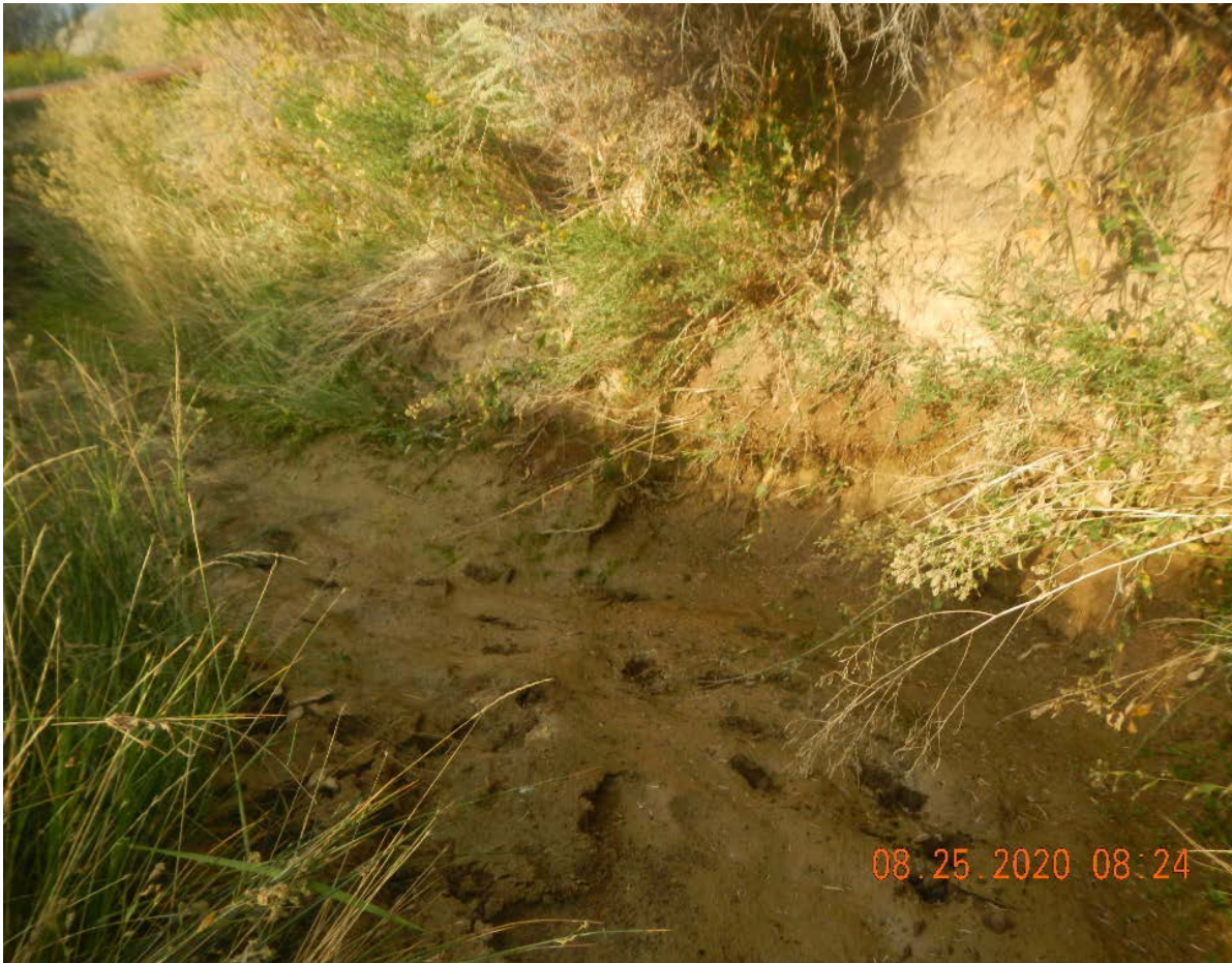
Photo #4 Close up of spill path in vermillion creek. No hydrocarbon or obvious impact was observed.

Inspection Photos Spill ID 463345 Remediation Project 12865 Inspection Date: 8/26/2020