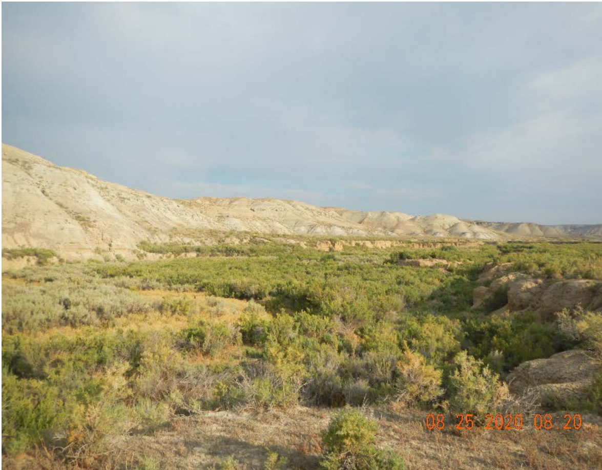
Photo #1. Photo looking north. Overview of Vermillion Creek. Spill impacted the creek channel in center of photo.

Inspection Photos Spill ID 463345 Remediation Project 12865 Inspection Date: 8/26/2020