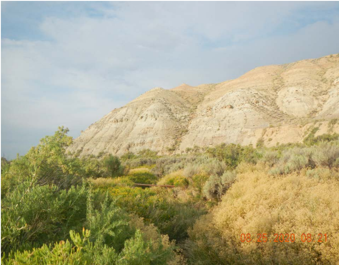
Photo #2 On back of channel impacted by spill. Is this the same line that failed?

Inspection Photos Spill ID 463345 Remediation Project 12865 Inspection Date: 8/26/2020