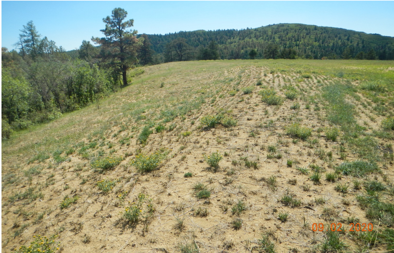
Photo 6. Facing southeast along the fill slope which has not been recontoured.