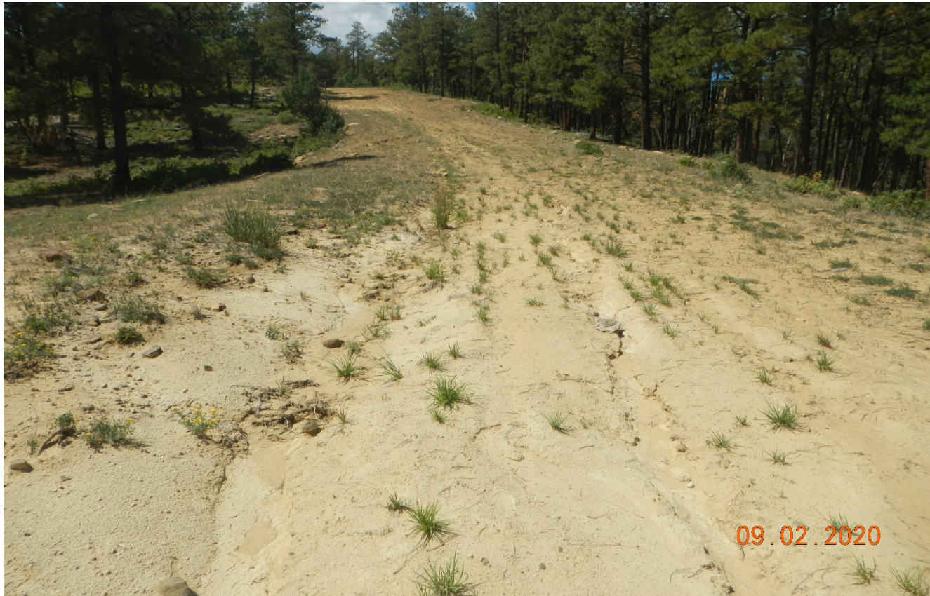
Photo 2. Facing west along the access road which has not been reclaimed.