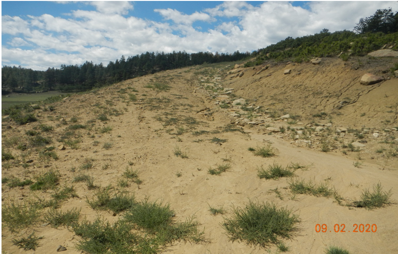
Photo 1. Facing west toward the beginning of the access road. The access road has not been recontoured and reclaimed and there is erosion occurring.