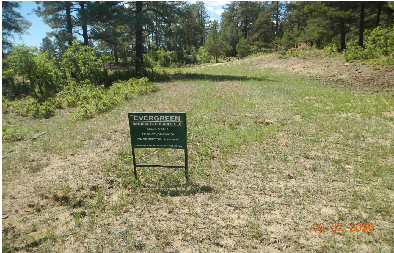
Photo 4. Facing southwest along the access road near the location.