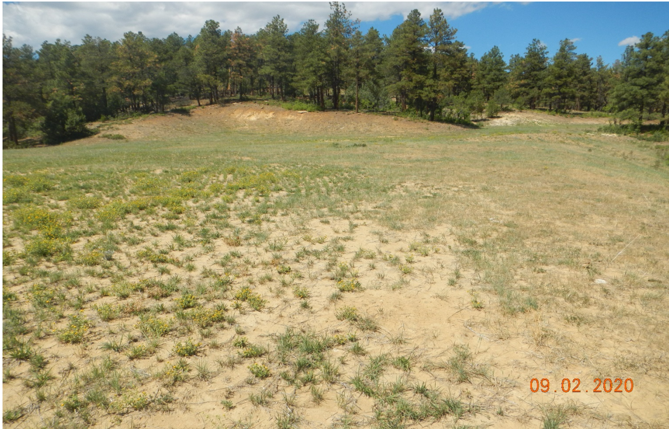
Photo 7. Facing northwest toward the location.