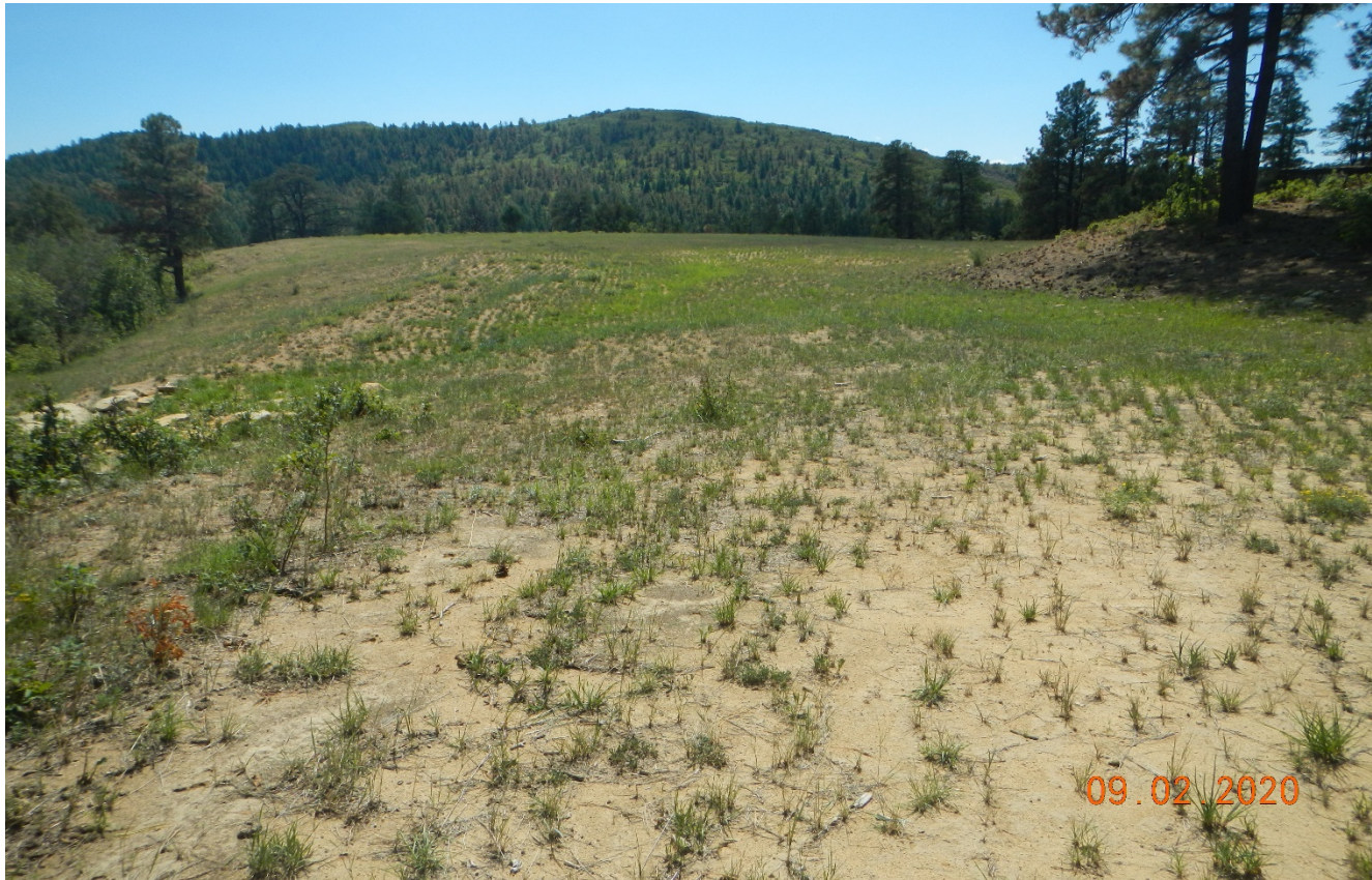
Photo 5. Facing southeast toward the location.