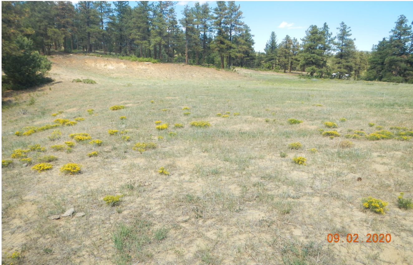
Photo 9. Facing northwest toward the location. The cut slope has not been recontoured to the approximate contours.