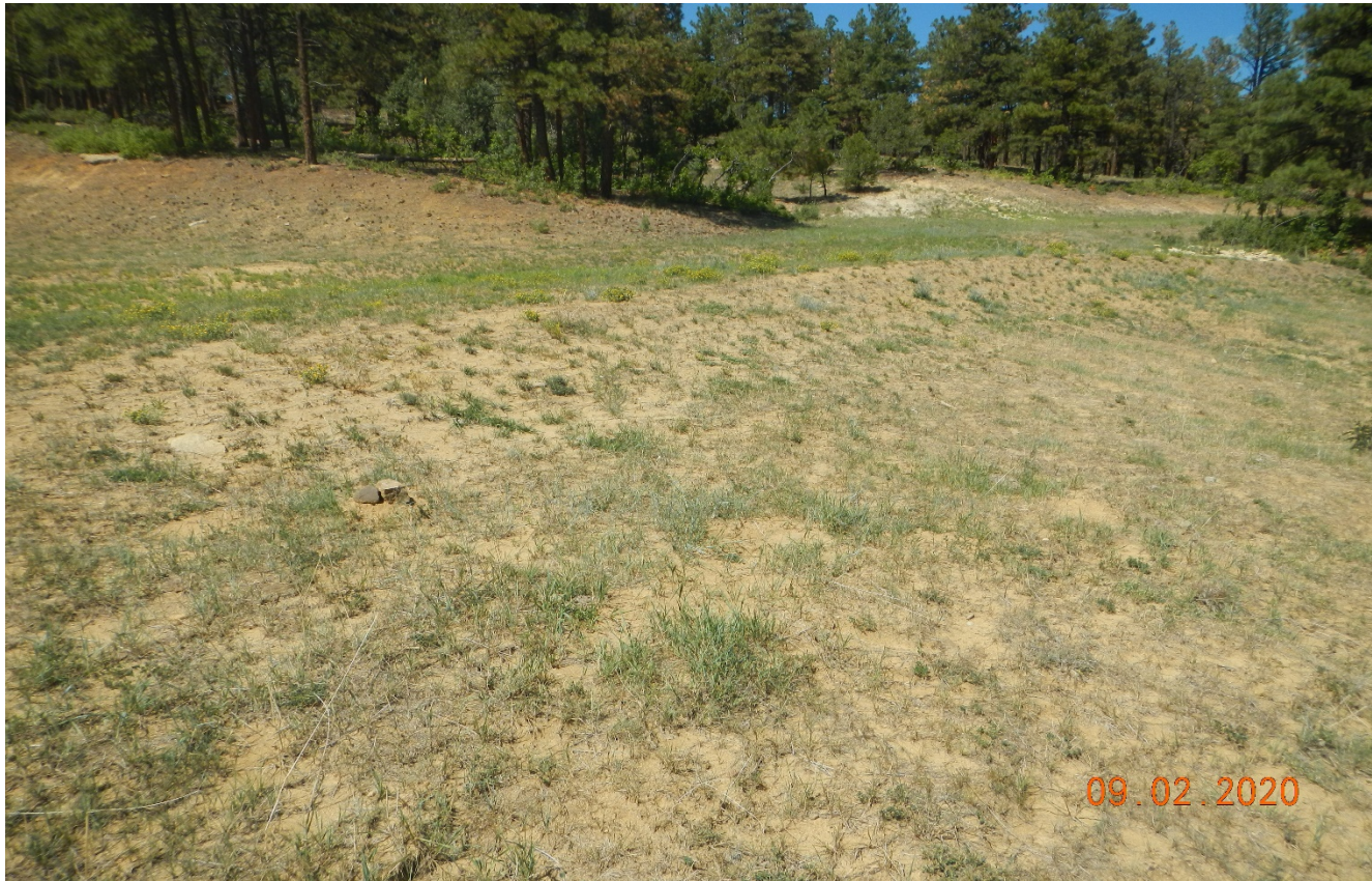
Photo 11. Facing northwest at the northern portion of the location. This fill slope area should be pushed back into the cut slope to match the approximate contours.