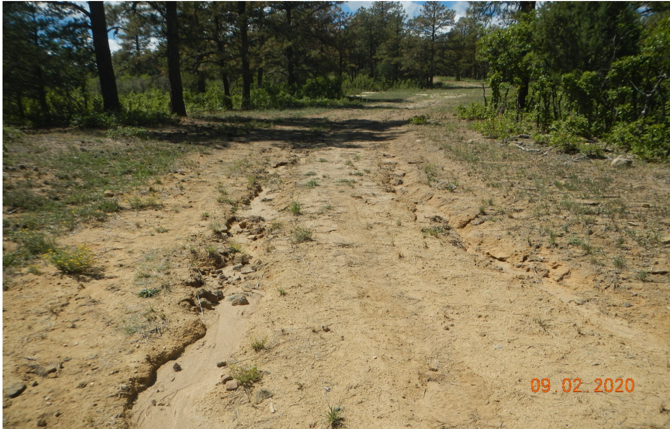
Photo 3. There is erosion occurring along the access road which is not stabilized.