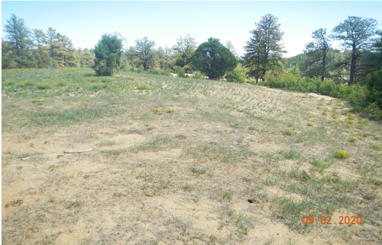
Photo 8. Facing east at the south side of the location. This area matches the contours. The south side of the location would likely not require recontouring.