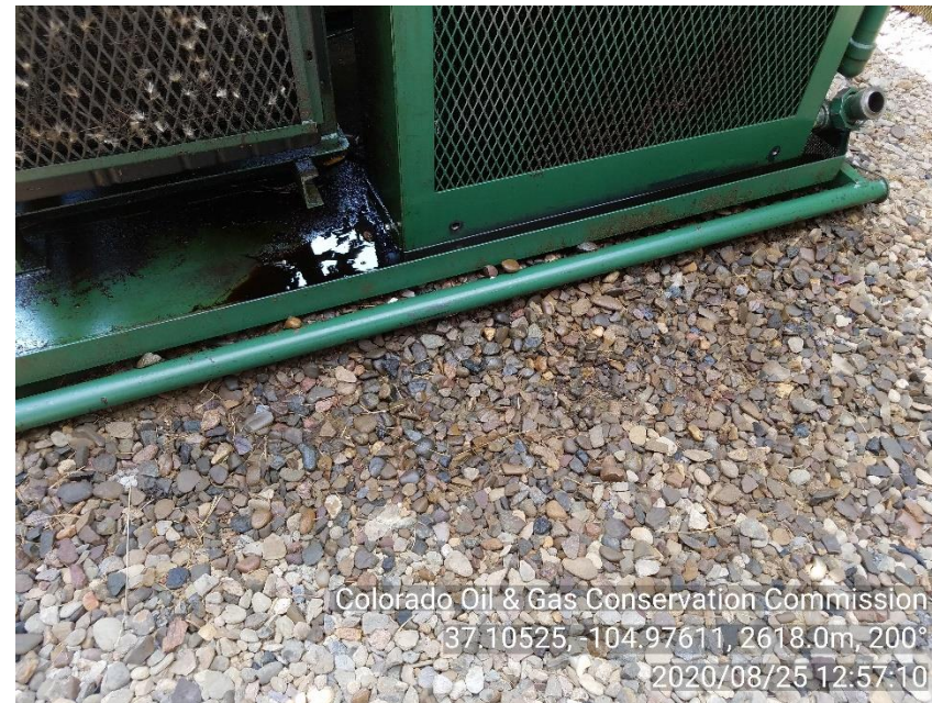
PHOTO 6: IMPACTED SOIL NEAR COMPRESSOR INSIDE SOUNDWALLS. "Properly dispose of oily waste in accordance with 907.e." CA DATE 11-25-20.