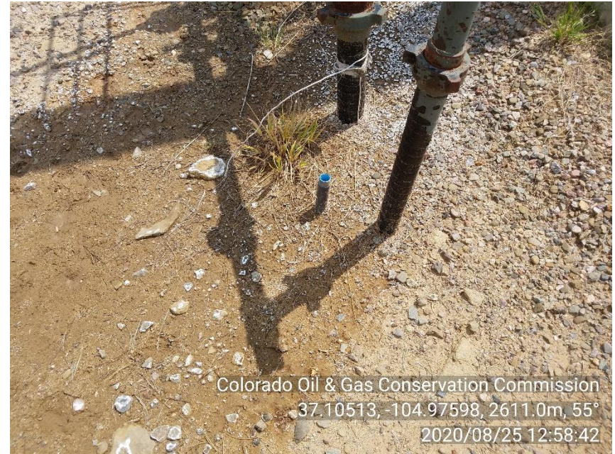
PHOTO 4: UNMARKED UNUSED RISERS NOT LO/TO. REMOVE OR MARK AND LOCKOUT/TAGOUT RISERS, COMPLY WITH RULE 603.f. CA DATE 11-25-20.