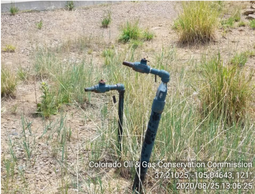
PHOTO 3: UNMARKED UNUSED RISERS NOT LO/TO. REMOVE OR MARK AND LOCKOUT/TAGOUT RISERS, COMPLY WITH RULE 603.f. CA DATE 11-25-20.