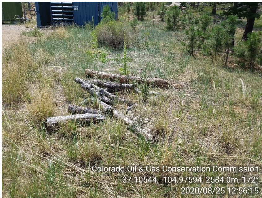
PHOTO 5: TRASH/DEBREE ON WEST SIDE OF LOCATION. REMOVE ALL TRASH ON AND AROUND LOCATION, COMPLY WITH RULE 603.f. CA DATE 11-25-20.