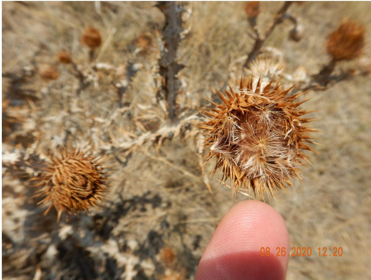
Photo 9. Close up photo taken from an unmanaged List B Colorado noxious weed, Scotch thistle. Most of the Scotch thistle has already flowered and set seed. Photo illustrates viable seeds which remain within the flowering head.