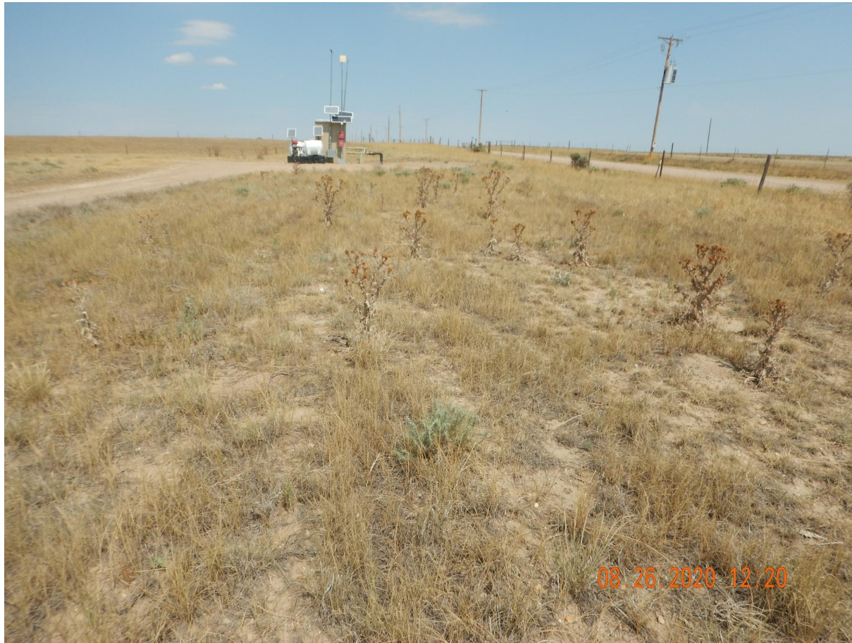
Photo 4. Photo taken from the entrance of the location, facing North. See comments under Photo 3.