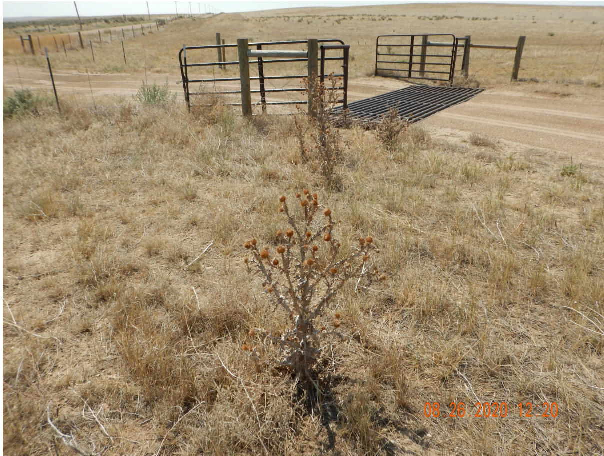
Photo 3. Photo taken from the entrance of the location, facing South. Photo illustrates unmanaged List B Colorado noxious weeds, Scotch thistle, which has spread off location.