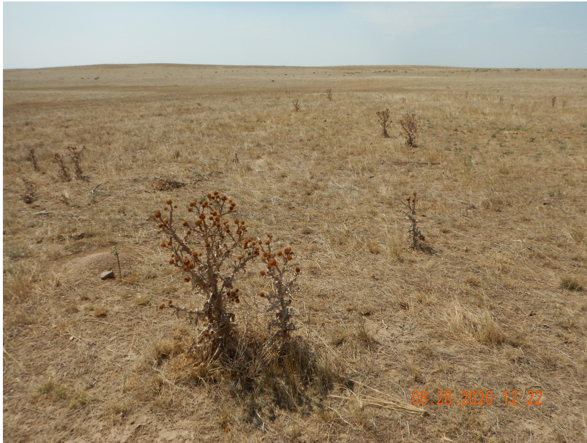
Photo 8. Photo taken from the southern interim area, facing South. Photo illustrates unmanaged List B Colorado noxious weeds, Scotch thistle, which have spread off location and beyond the interim reclamation areas.