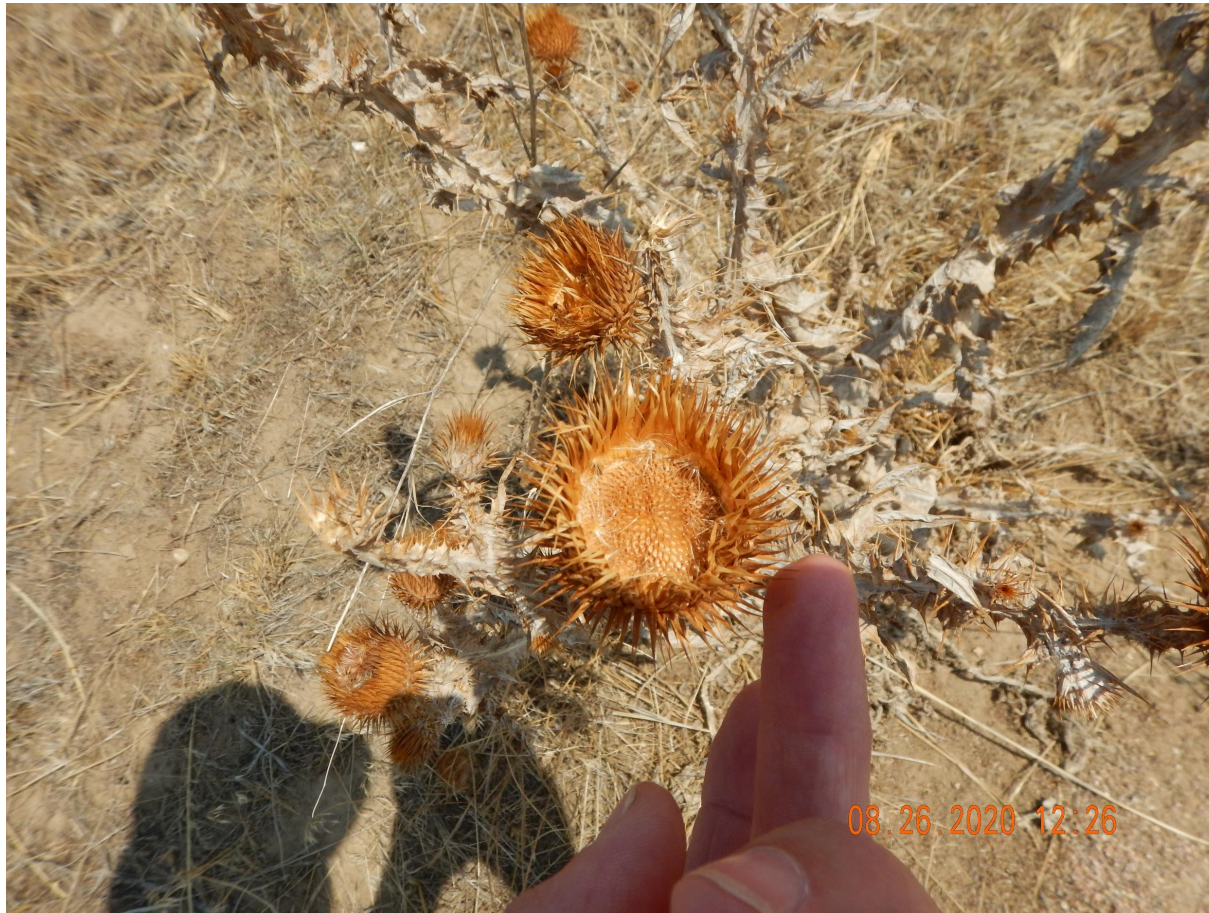
Photo 10. Close up photo taken from an unmanaged List B Colorado noxious weed, Scotch thistle. Most of the Scotch thistle has already flowered and set seed. Photo illustrates all seeds have been dispersed.