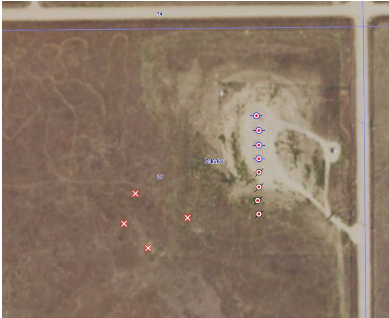
Photo 2. Aerial imagery from 2017 using COGCC database illustrates the location and surface disturbance after interim reclamation. The “red x’s” are locations of a List B Colorado noxious weed, Scotch thistle, which has spread off location.