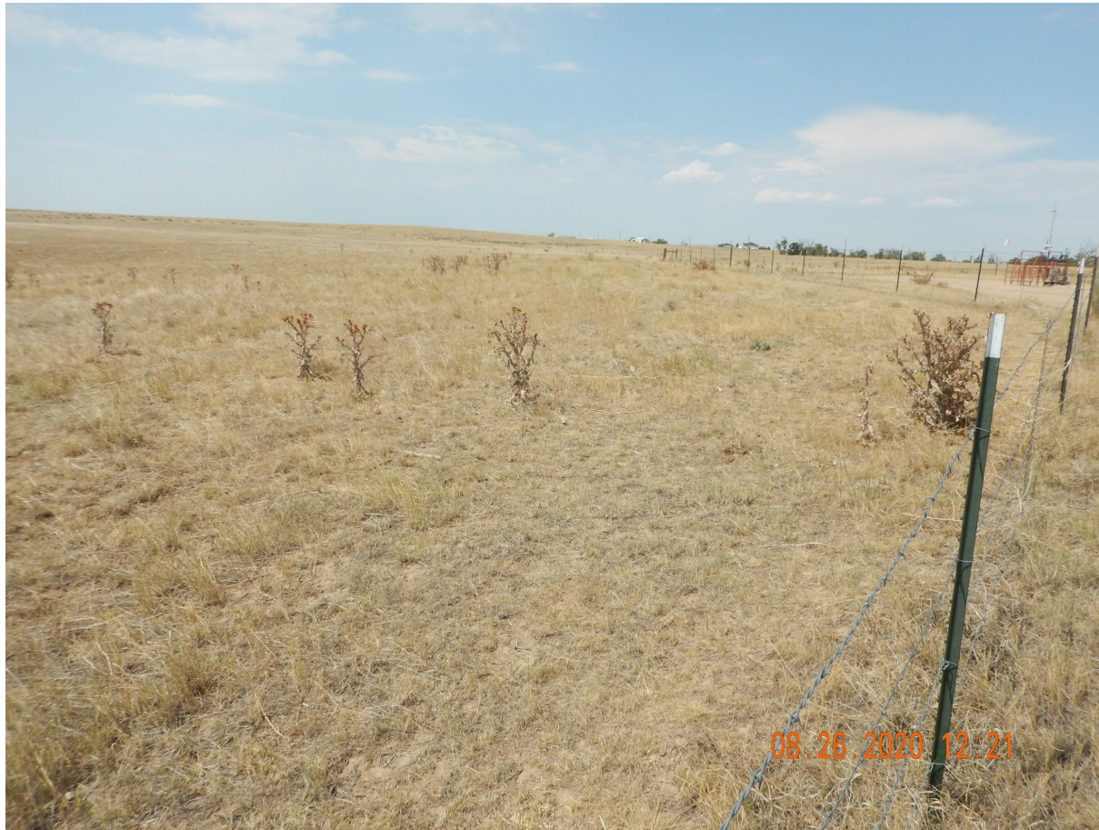
Photo 7. Photo taken from the southeastern well pad, facing West. Photo illustrates unmanaged List B Colorado noxious weeds, Scotch thistle, within the southern interim area.