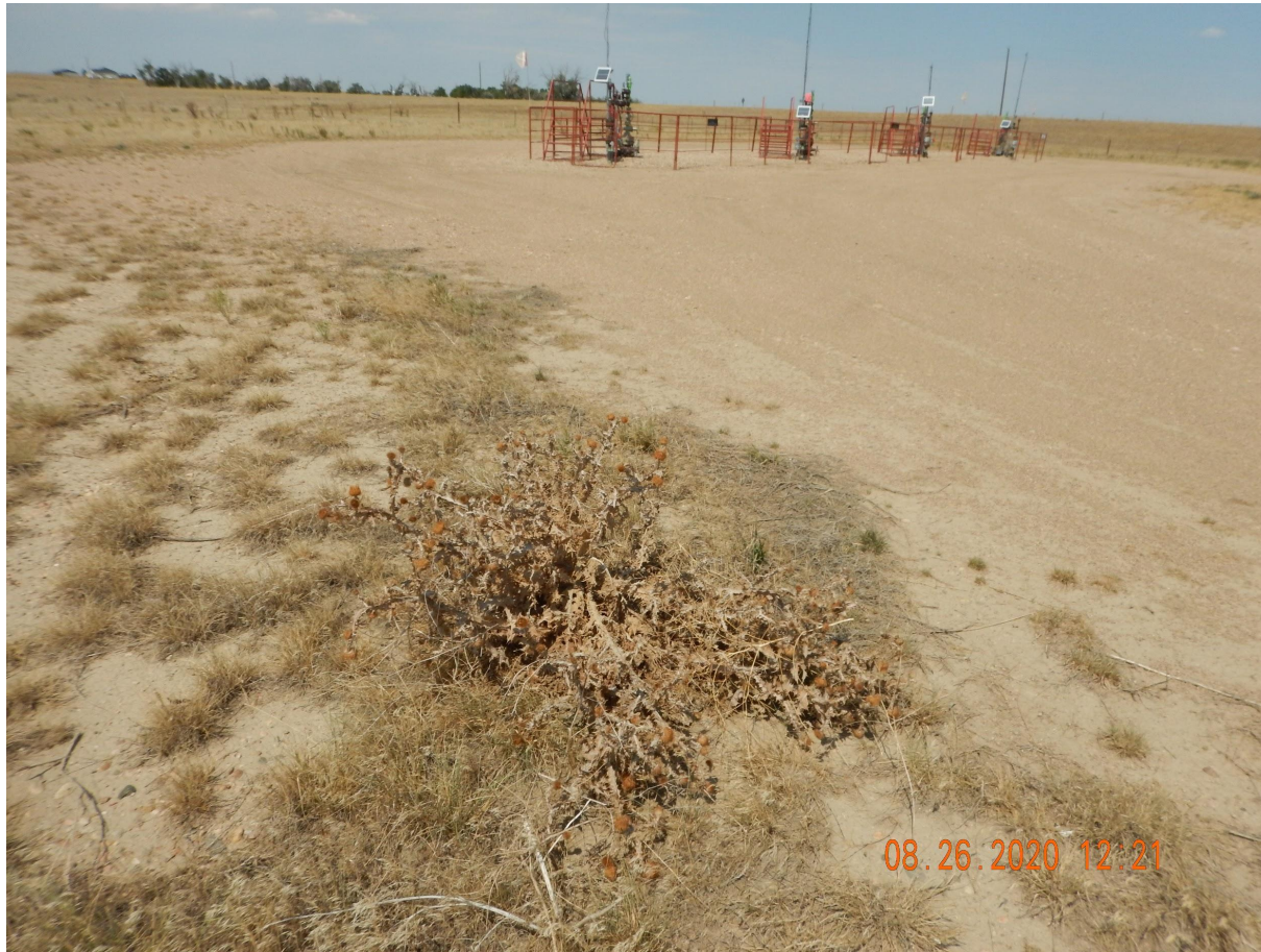
Photo 5. Photo taken from the southern well pad, facing West. See comments under Photo 3.