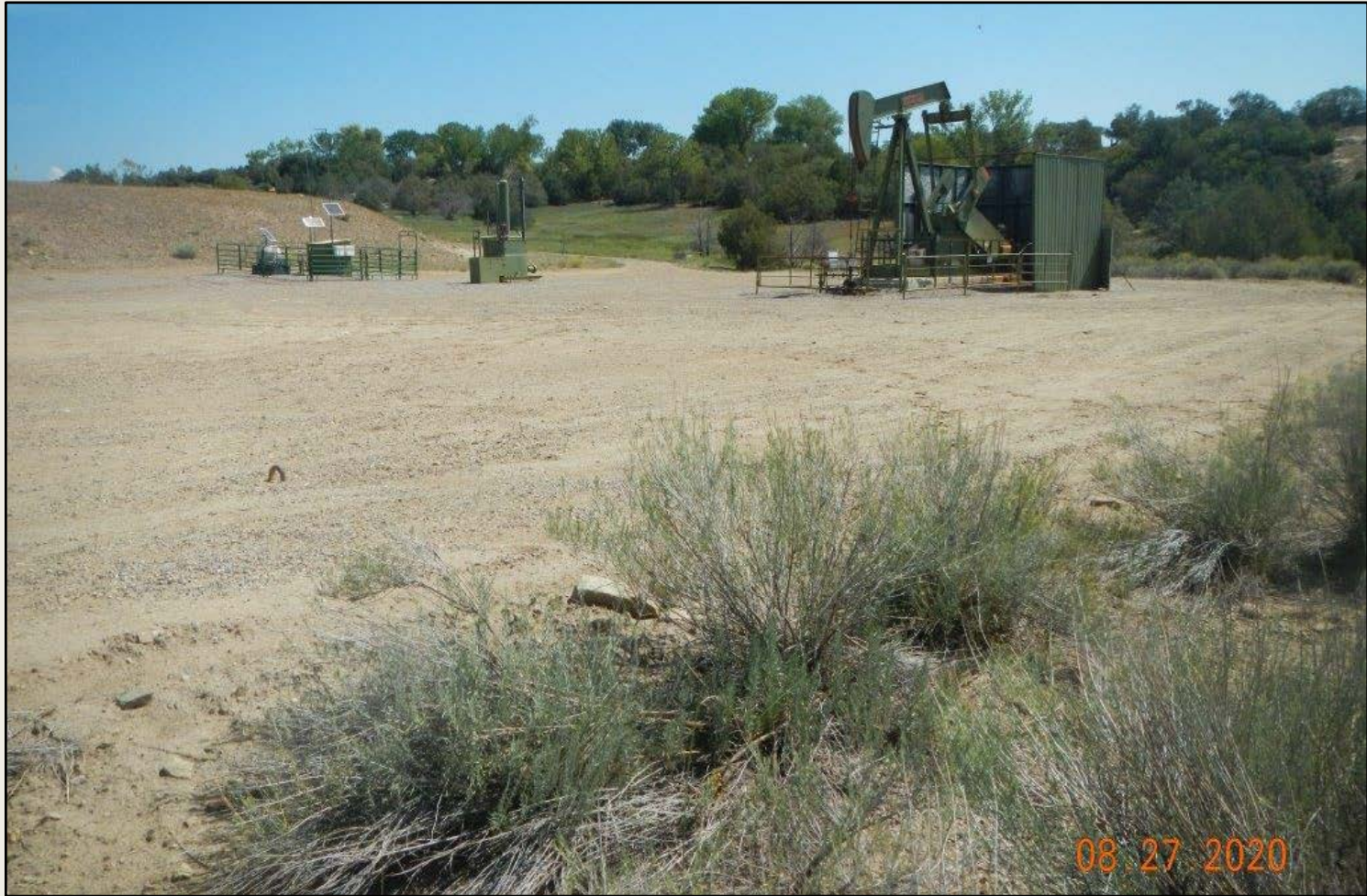
Photo 1. View of the project area from the southwestern edge facing center.