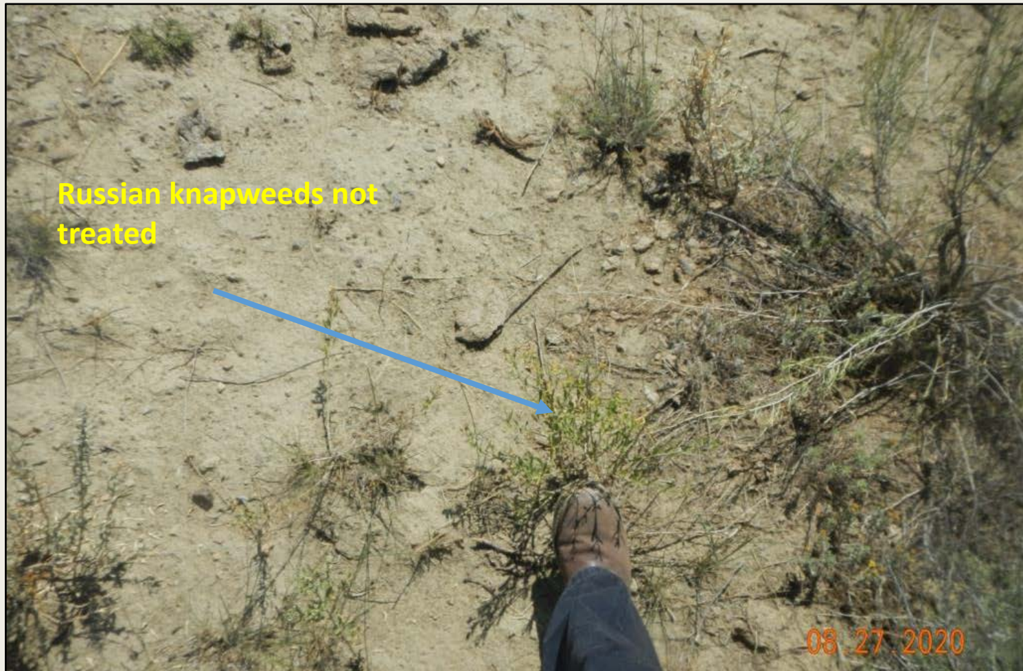
Photo 4. View of Russian knapweeds that do not appear to be herbicide treated within the project area.