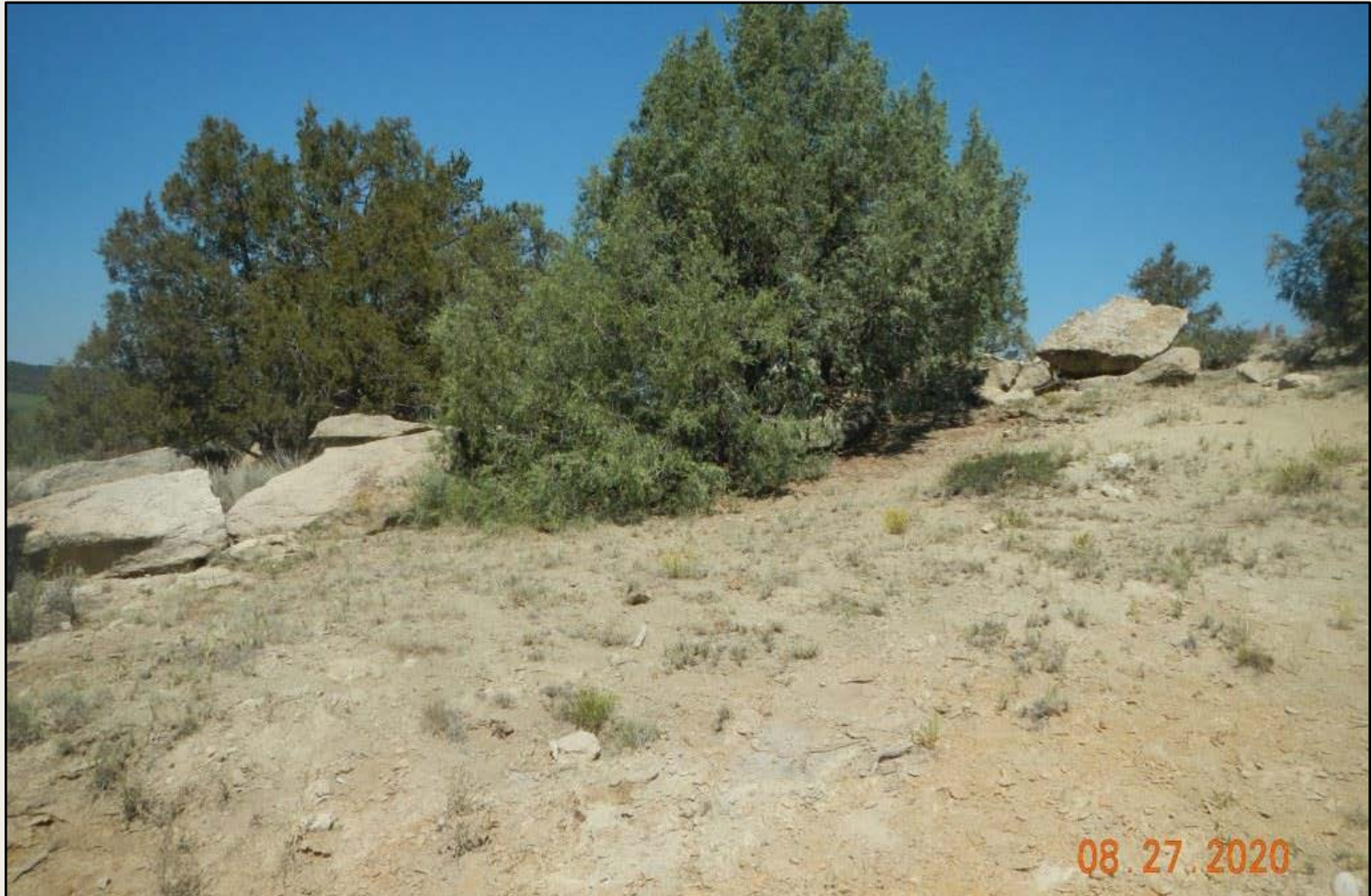
Photo 5. View of reference area vegetation comprised of pinyon juniper woodland with understory of big sagebrush, squirreltail, and antelope bitterbrush.