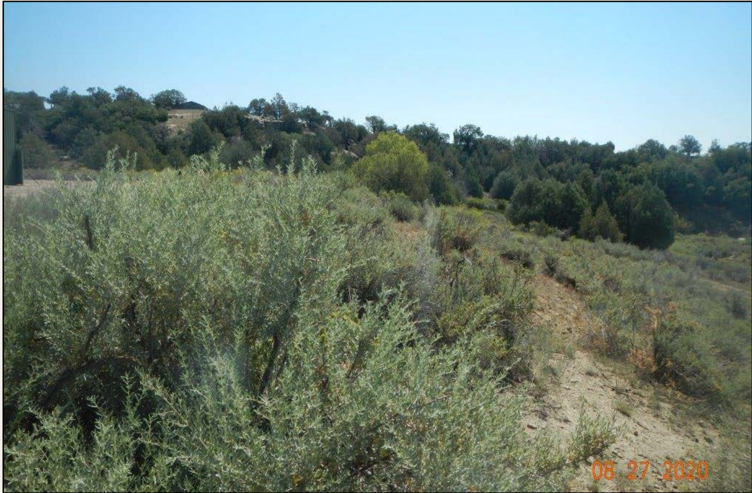
Photo 2. View of the southern fill slope facing westward. Vegetation is becoming established with fourwing saltbush, rubber rabbitbrush, and western wheatgrass.