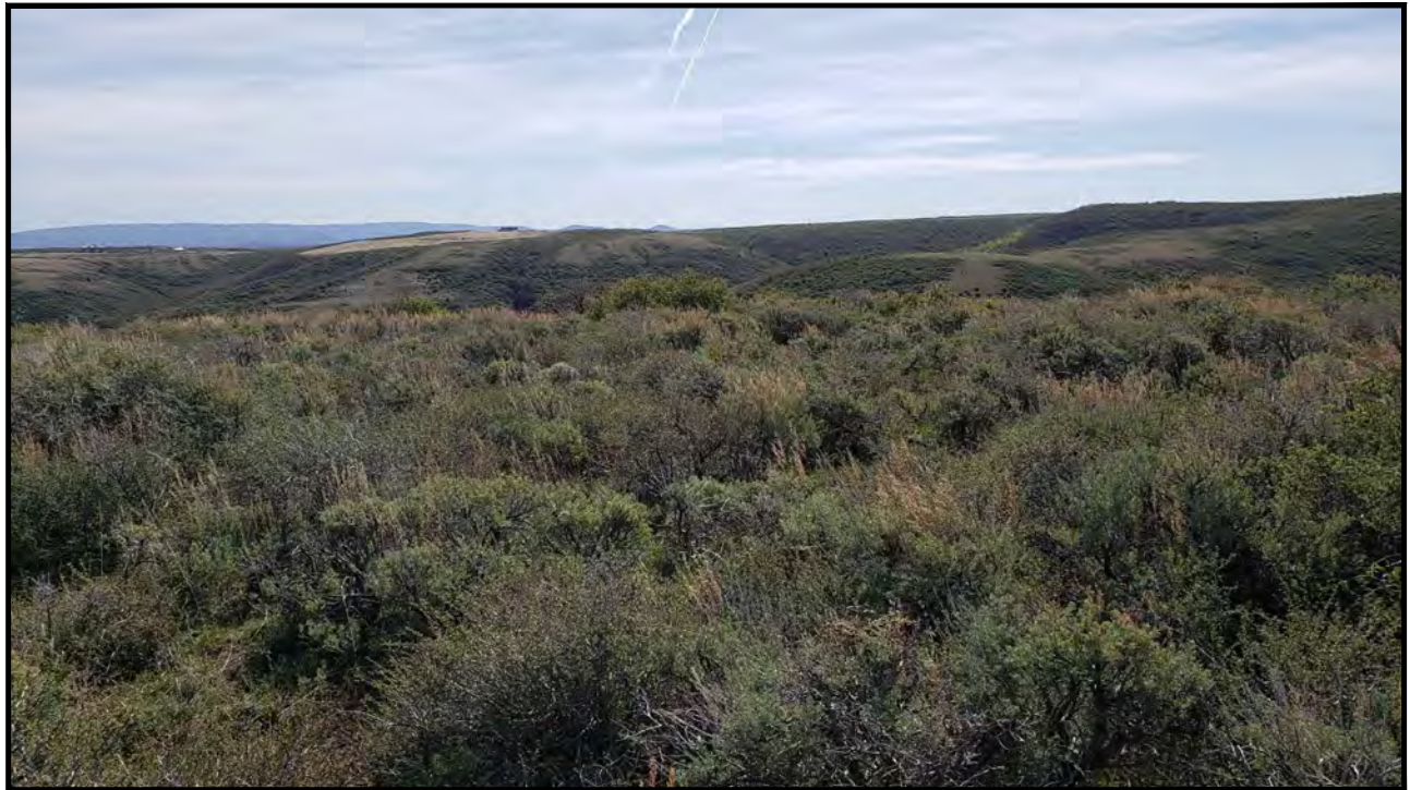
PHOTO: VIEW OF PAD AREA