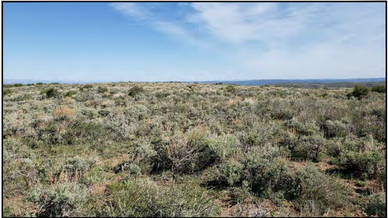
PHOTO: VIEW OF PAD AREA