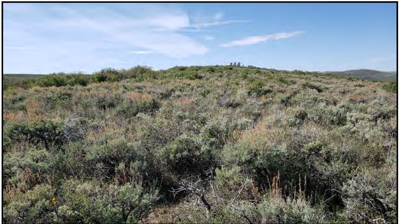
PHOTO: VIEW OF PAD AREA