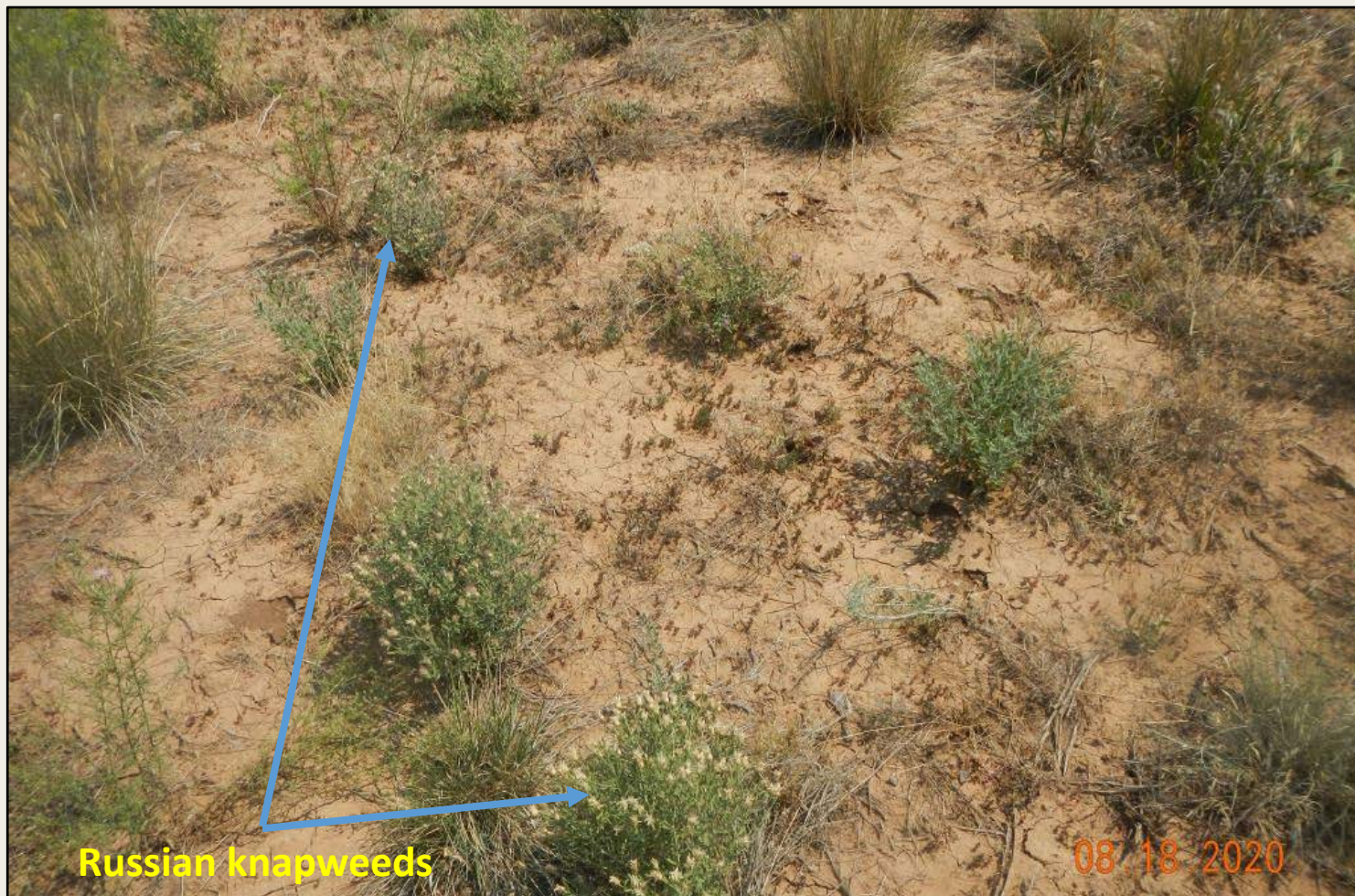
Photo 4. Another view of Russian knapweeds within the northern project area.