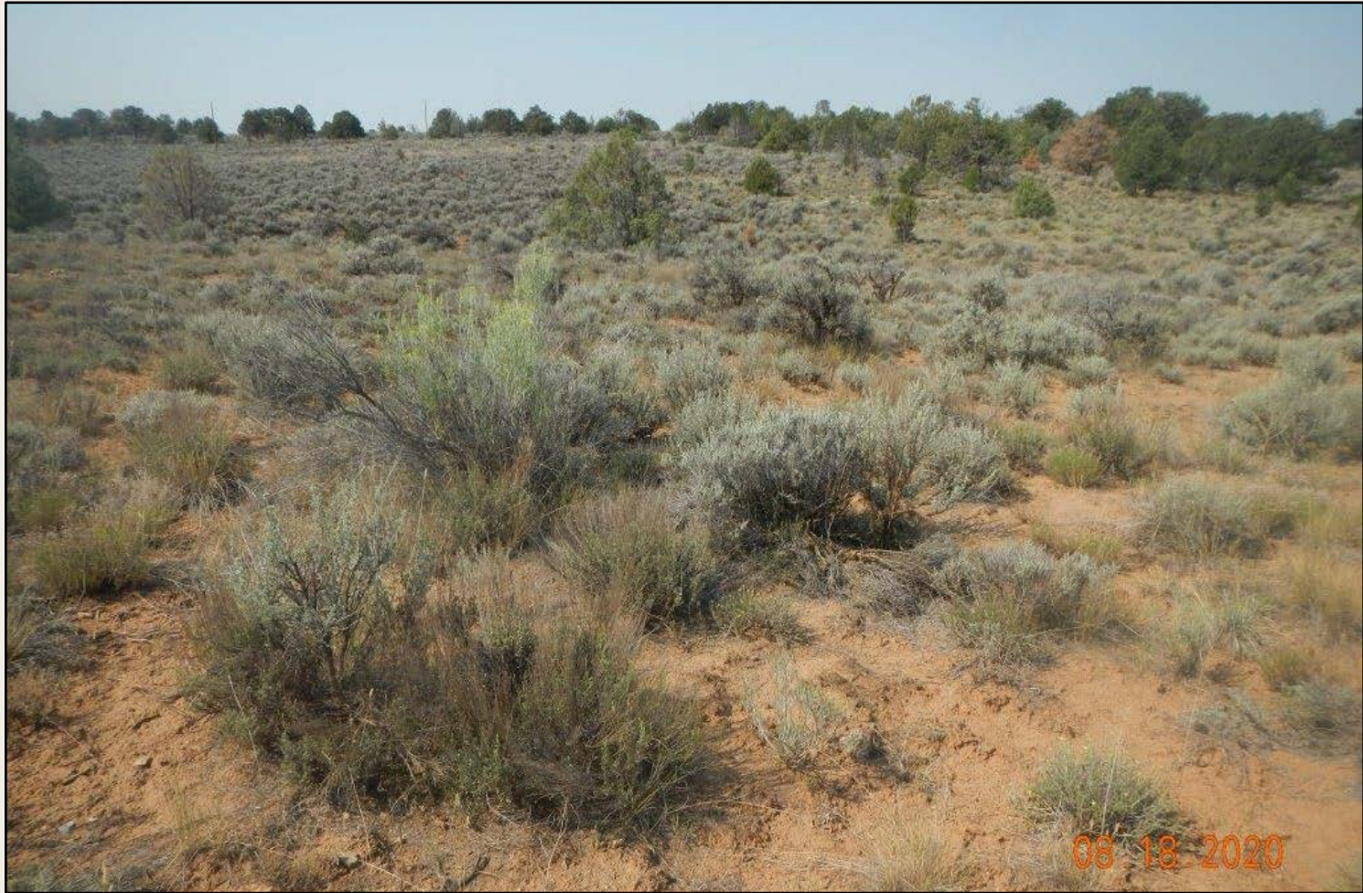
Photo 5. View of reference area comprised of sagebrush shrubland, with black sage and big sagebrush, scattered pinyon and ponderosa pine trees, with an understory of squirreltail, blue grama, purple three-awn, penstemons, and purple asters.