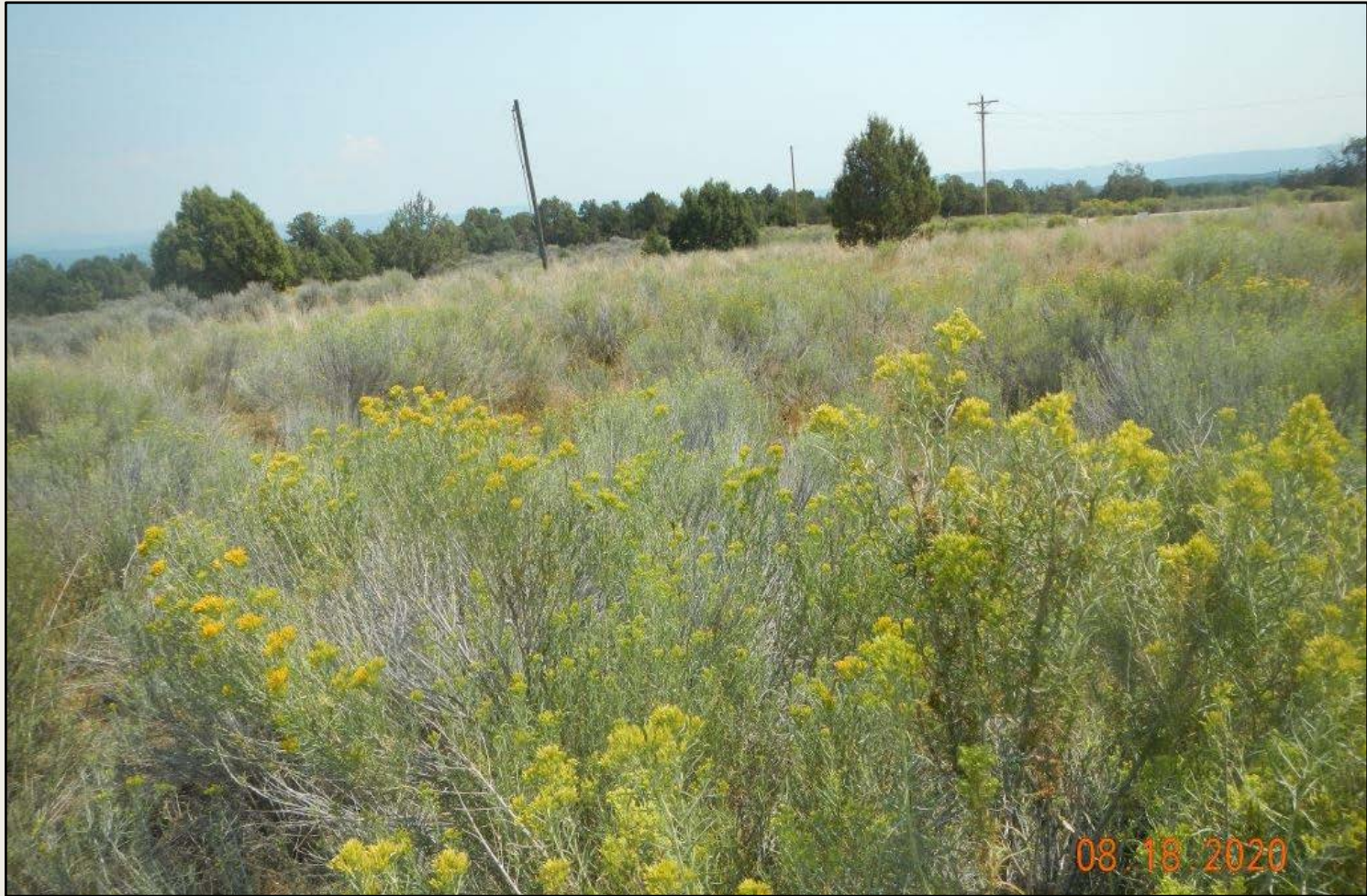
Photo 2. View of the northern project area, revegetation is progressing with rubber rabbitbrush, crested wheatgrass, and western wheatgrass.