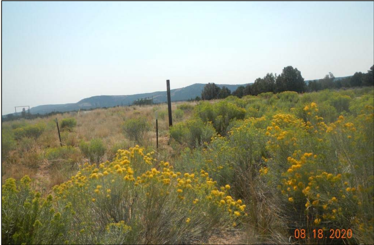
Photo 1. View of the project area from the northwestern edge facing center. Plugged well marker observed.